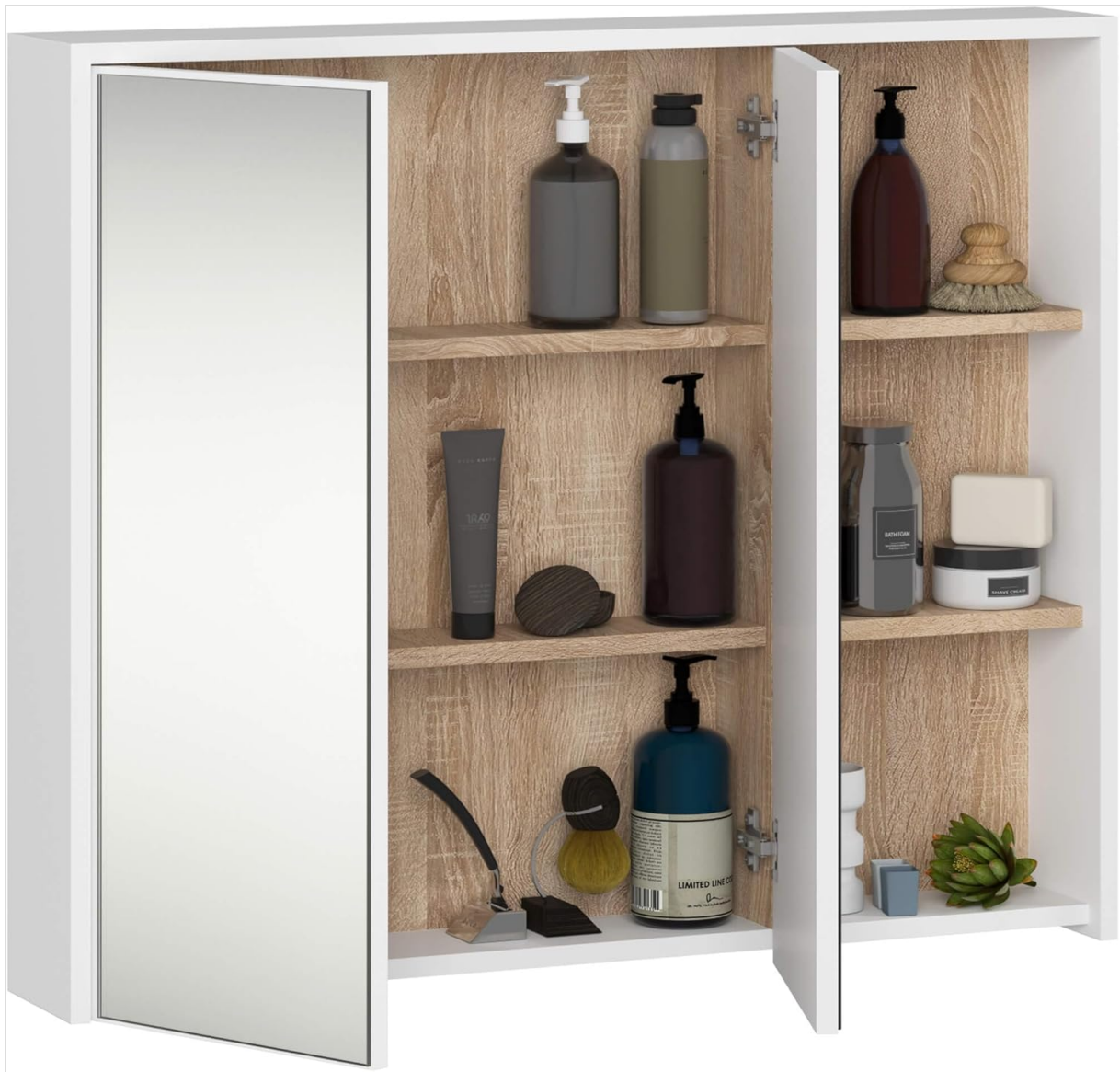
Figure 3: Cabinet Interior with Shelves