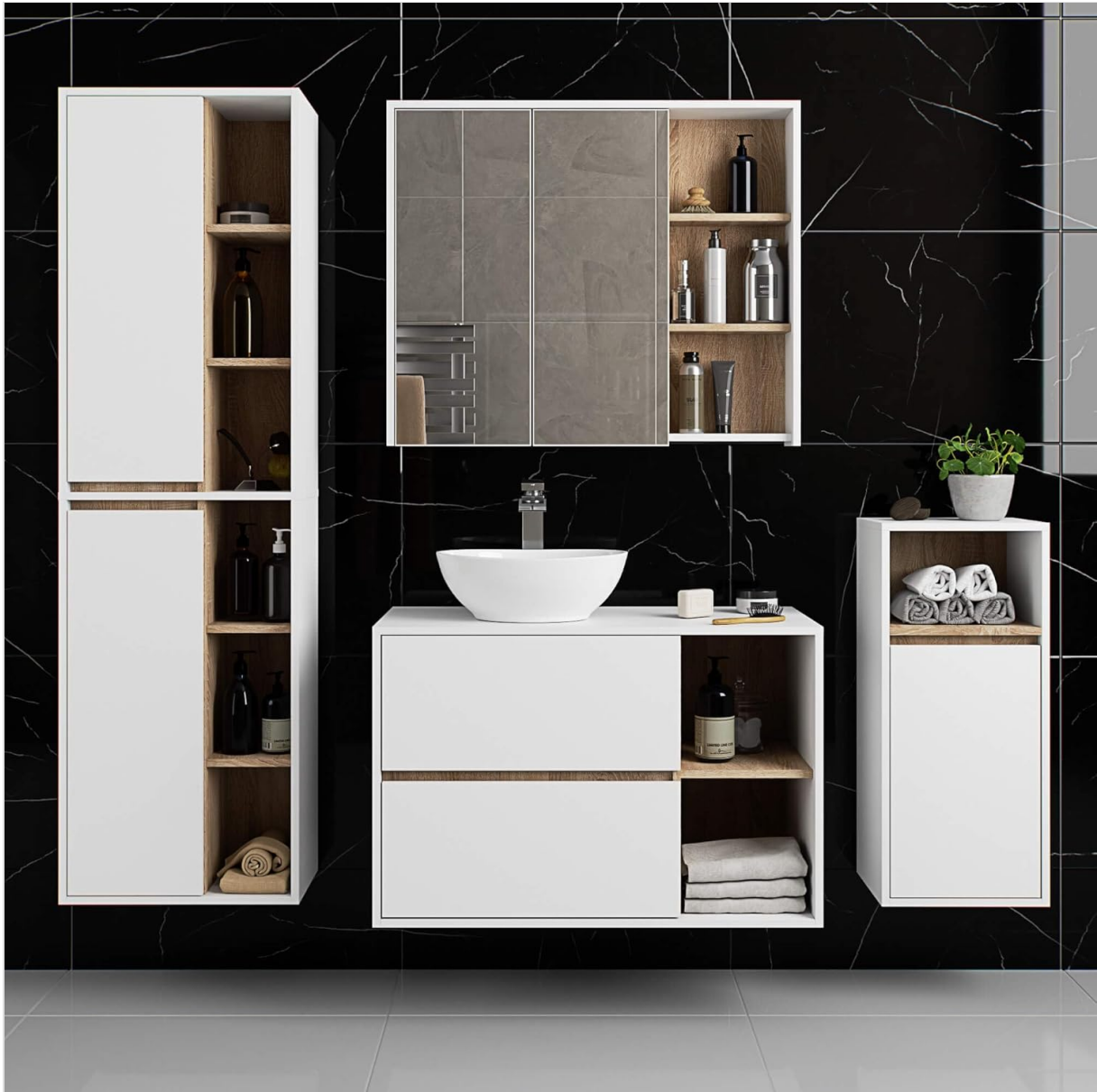
Figure 2: AKORD VAMI Mirror Cabinet in a Bathroom Setting