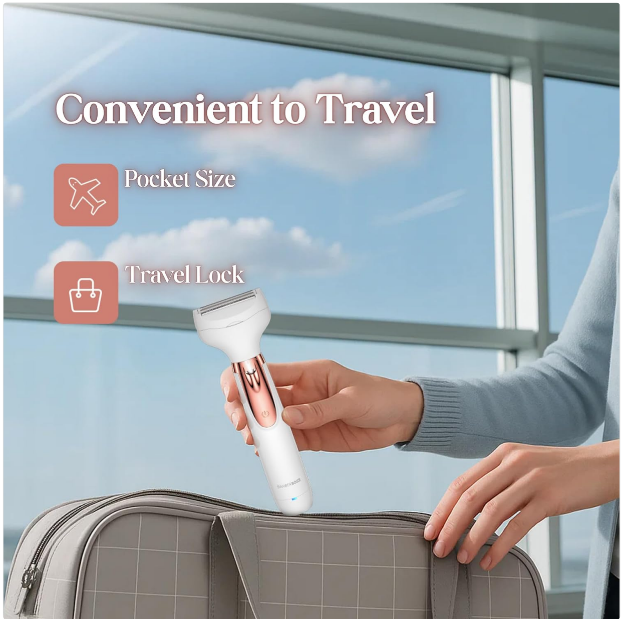
Image 5.7: The travel lock feature for convenient and safe transport.