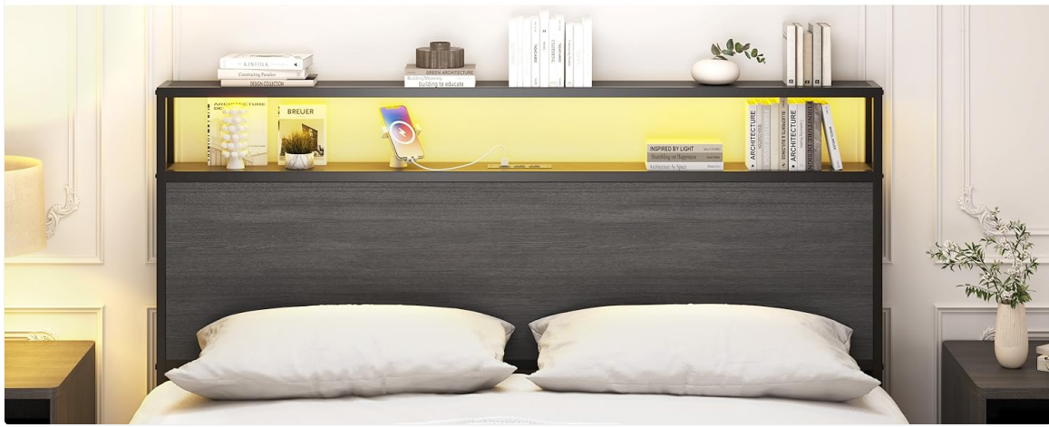
Image Description: A close-up view of the built-in charging station on the headboard, showing two AC power outlets, one USB-A port, and one USB-C port, designed for convenient device charging.