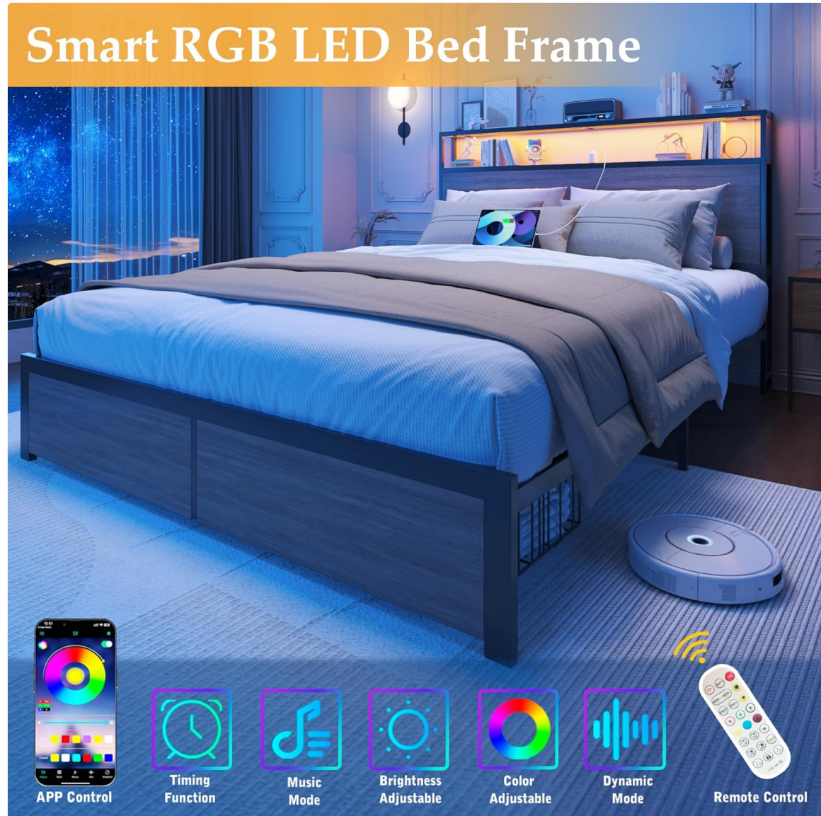
Image Description: A bedroom scene featuring the Lifezone Smart RGB LED Bed Frame with blue LED lights illuminating the headboard and under the bed. The image highlights features like APP Control, Timing Function, Music Mode, Brightness Adjustable, Color Adjustable, Dynamic Mode, and Remote Control.