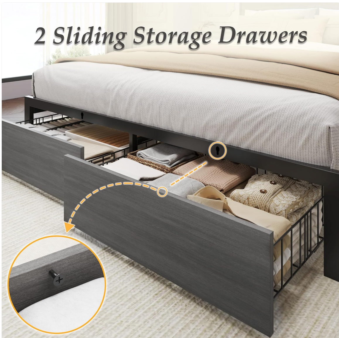
Image Description: A view of the Lifezone Bed Frame from the side, showing two sliding storage drawers pulled out from underneath the bed, filled with folded clothes and other items. The drawers feature a lockable closure design.

The bed frame includes four sliding drawers for additional storage. These drawers are designed to roll smoothly on wheels and can be used to store blankets, clothing, or other personal items, helping to keep your room organized and clutter-free.