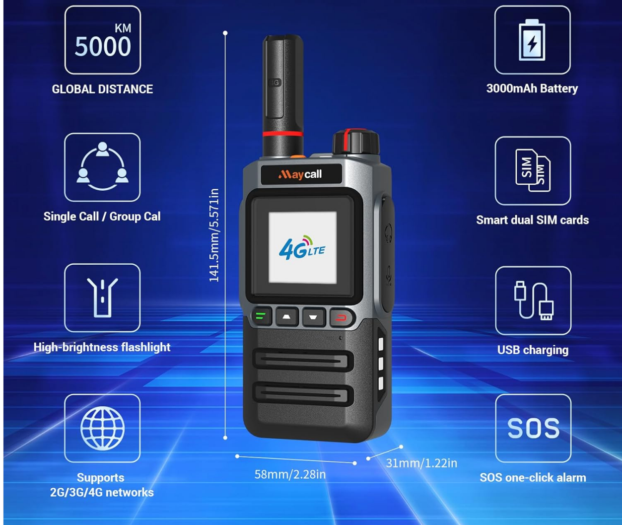
Image: Front view of the Maycall MC-720 walkie talkie, highlighting its dimensions (141.5mm height, 58mm width, 31mm thickness) and key features such as 5000km global distance, 3000mAh battery, single/group call, smart dual SIM cards, high-brightness flashlight, USB charging, 2G/3G/4G network support, and SOS one-click alarm.