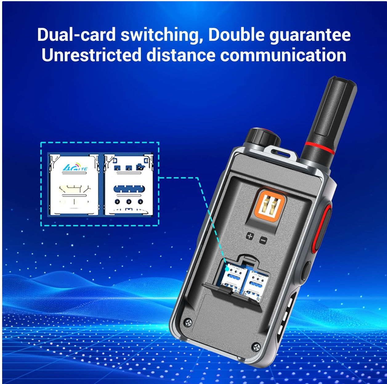
Image: Rear view of the Maycall MC-720 walkie talkie with the battery cover removed, illustrating the dual SIM card slots for network connectivity.