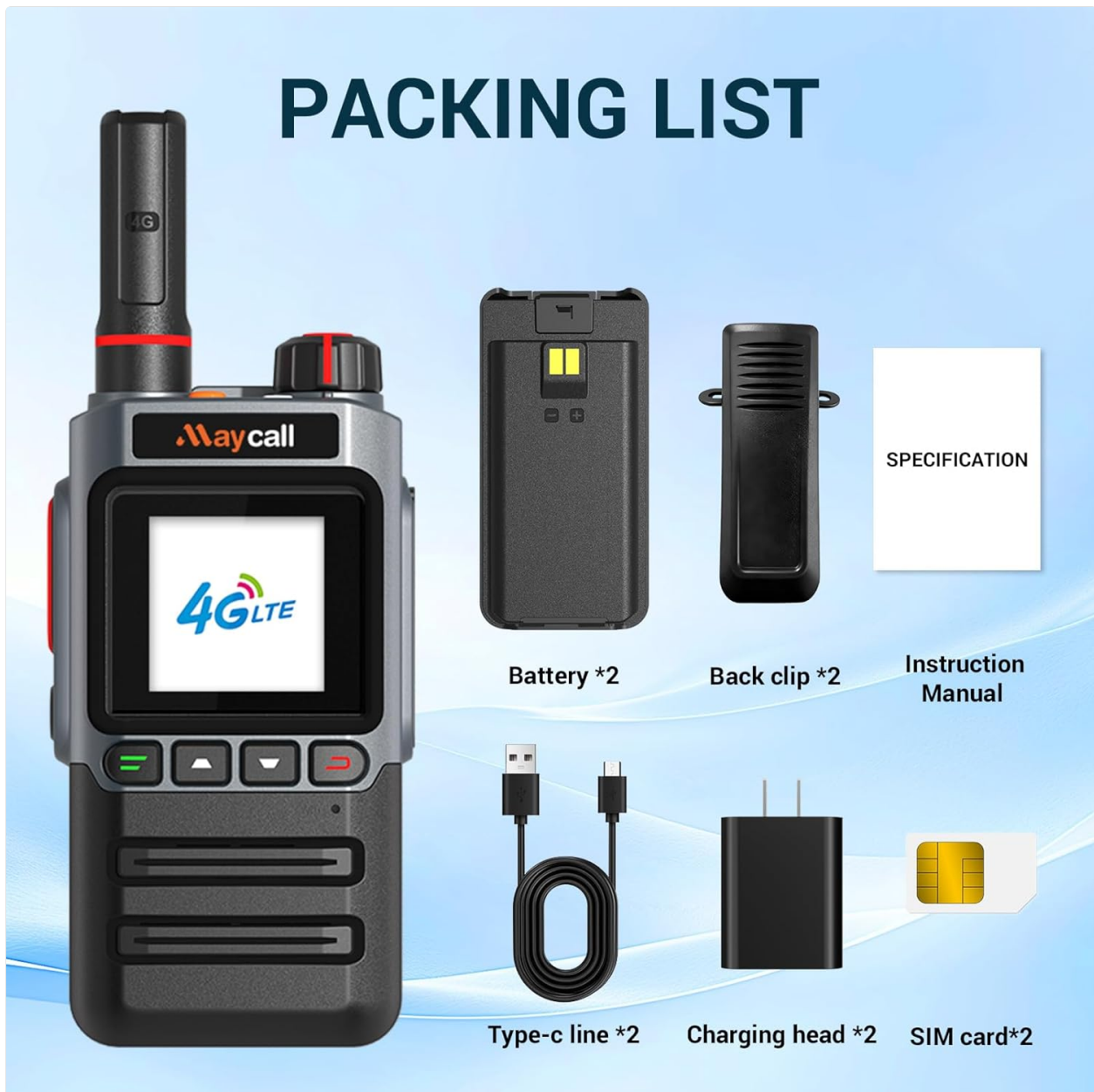
Image: The packing list for the Maycall MC-720 walkie talkie, showing the radio unit, two batteries, two back clips, an instruction manual, two Type-C lines, two charging heads, and two SIM cards.

Please check the package contents upon unboxing. If any items are missing or damaged, contact Maycall customer support.