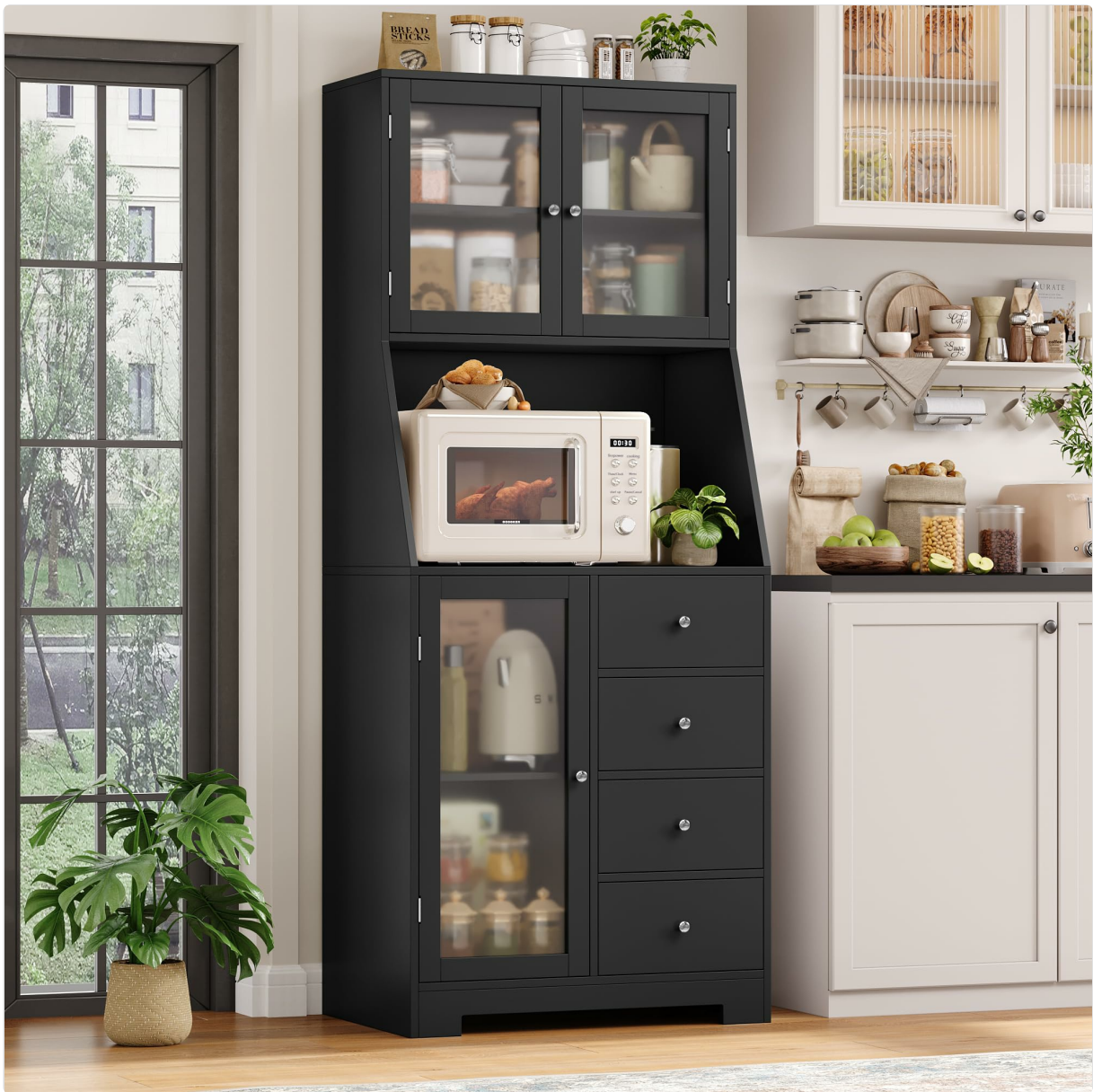
Image: This image shows the BOTLOG YSZ-PB035 64-inch Kitchen Pantry Storage Cabinet in its complete form, highlighting its black finish, frosted glass doors, and the open central compartment designed for appliances.