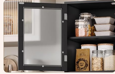
Frosted Glass Door

Image: This image displays the BOTLOG YSZ-PB035 Kitchen Pantry Storage Cabinet in a kitchen setting, showcasing its functionality with a microwave placed in the open central compartment. The upper cabinets with frosted glass doors are open, revealing stored items, and the lower drawers are visible, demonstrating its practical storage capabilities.