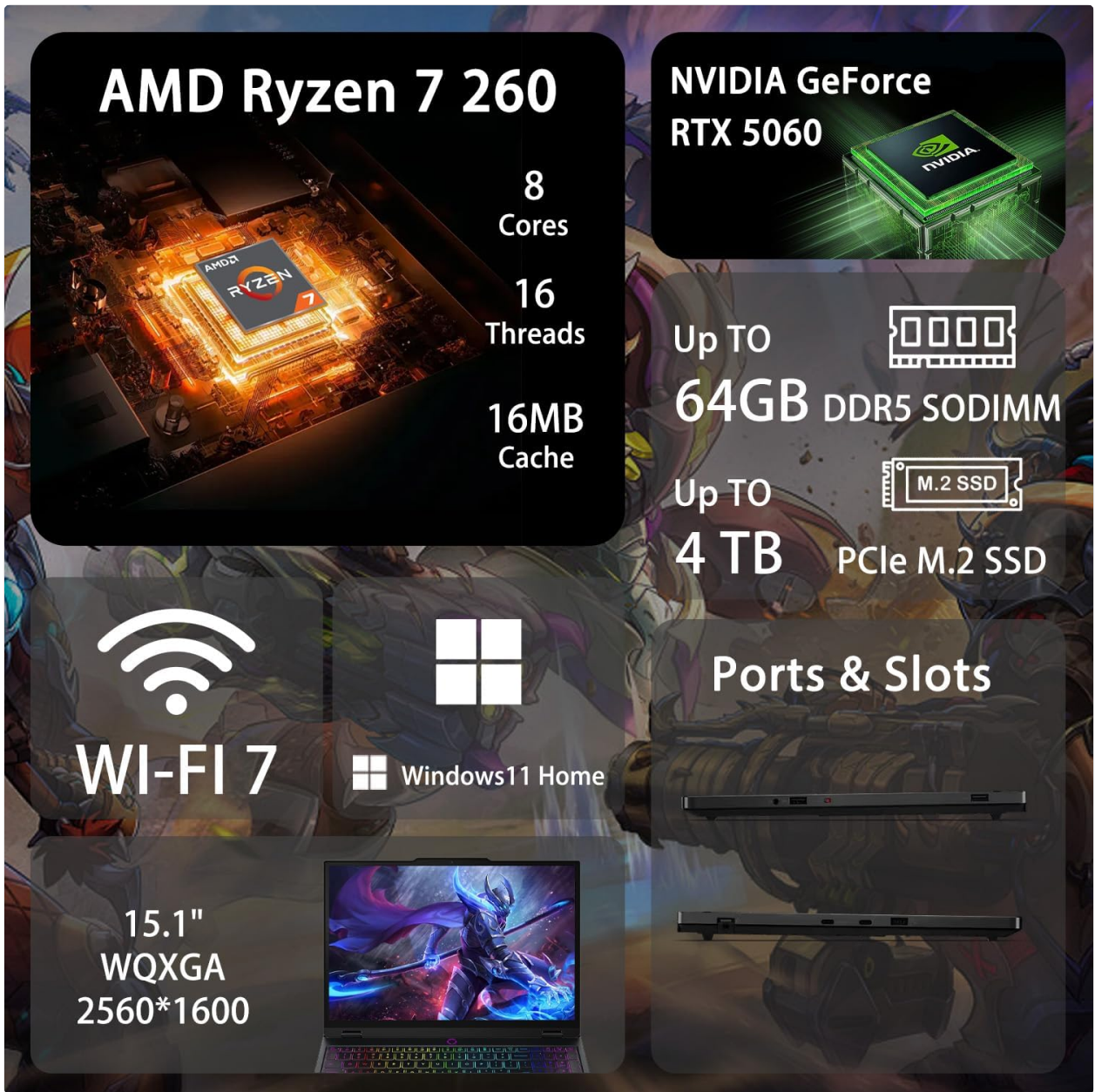
Image: An infographic summarizing key features including AMD Ryzen 7 260 CPU, NVIDIA GeForce RTX 5060 GPU, up to 64GB DDR5 RAM, up to 4TB PCIe M.2 SSD, Wi-Fi 7, Windows 11 Home, 15.1" WQXGA display, and port configurations.