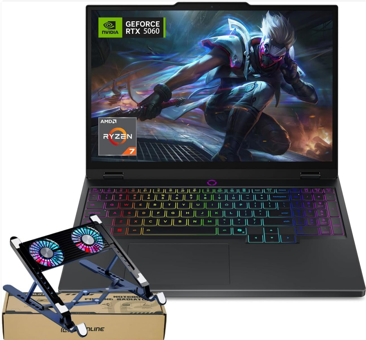
Image: The Lenovo Legion 5 15AHP10 laptop shown with the bundled PCO Notebook Folding Radiator laptop cooler, illustrating the complete package.

Utilize the available ports to connect external devices such as a mouse, keyboard, external monitor, or other accessories. Refer to the "Ports and Connectors" section for a detailed diagram.