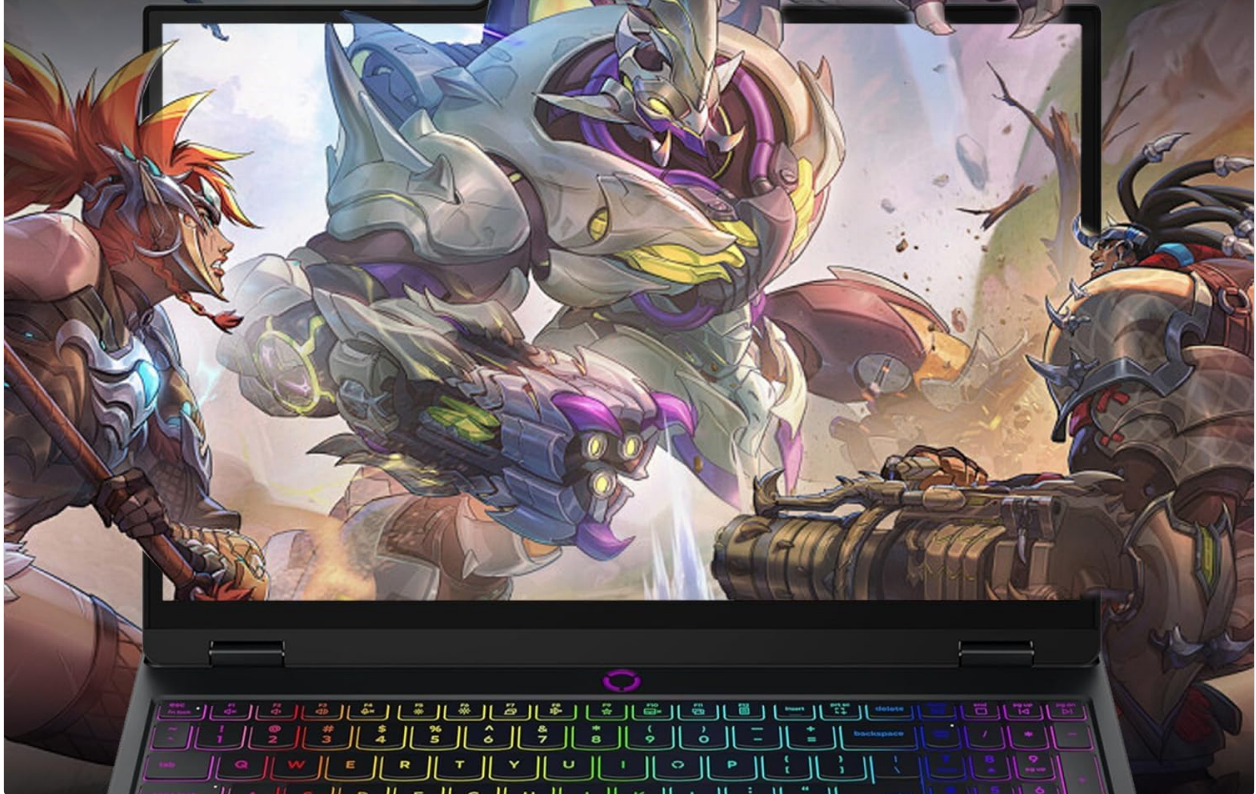
Image: Close-up of the laptop display highlighting its WQXGA resolution, 165Hz refresh rate, RGB backlit keyboard, 100% DCI-P3 color, OLED technology, and 500 nits peak brightness.