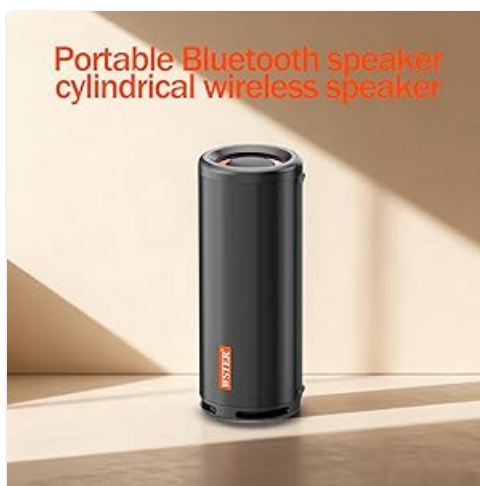
Figure 3: Speaker showcasing the LED ambient light feature.