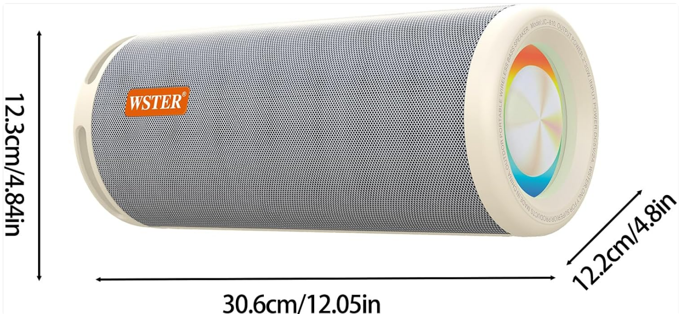
Figure 5: Product dimensions of the WSTER JC-810 speaker.