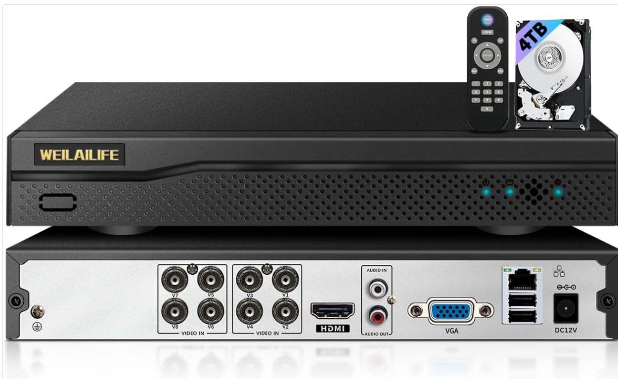
Image: Front and rear view of the WEILAILIFE AHD Recorder, illustrating the various connection ports for cameras, display, network, and power, along with the included remote control and 4TB hard drive.