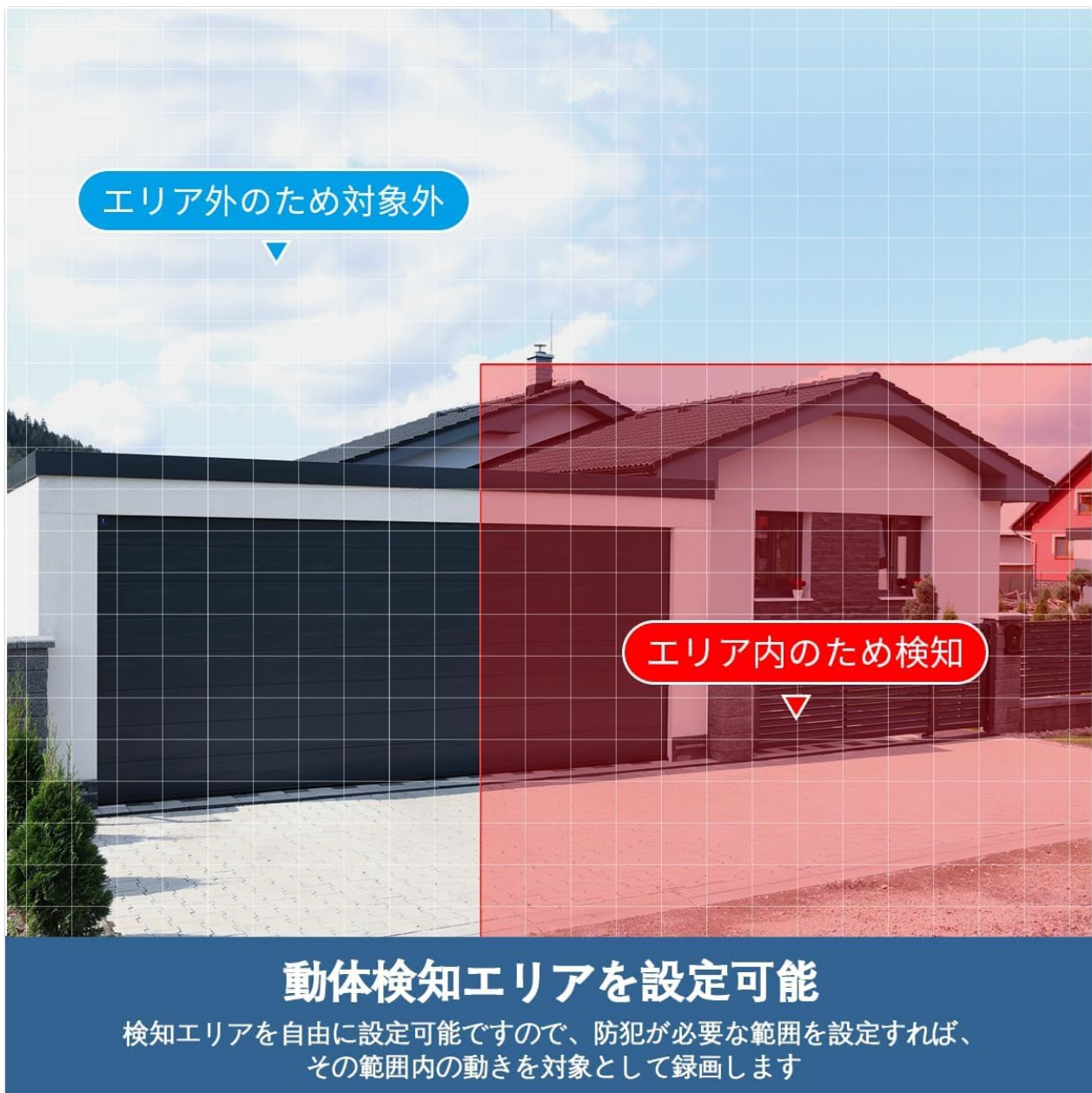
Image: An example of setting a motion detection area, highlighting how users can specify regions for active surveillance while ignoring others.