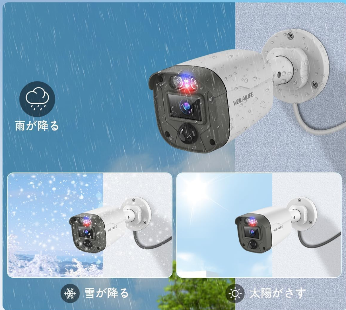
Image: The IP67 waterproof and dustproof rating of the camera, depicted functioning effectively under various weather conditions such as rain, snow, and direct sunlight, highlighting its robust design.