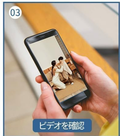
Image: Illustration of remote monitoring capabilities, showing the security camera feed accessible on various devices including smartphones, tablets, and computers via the dedicated mobile application.