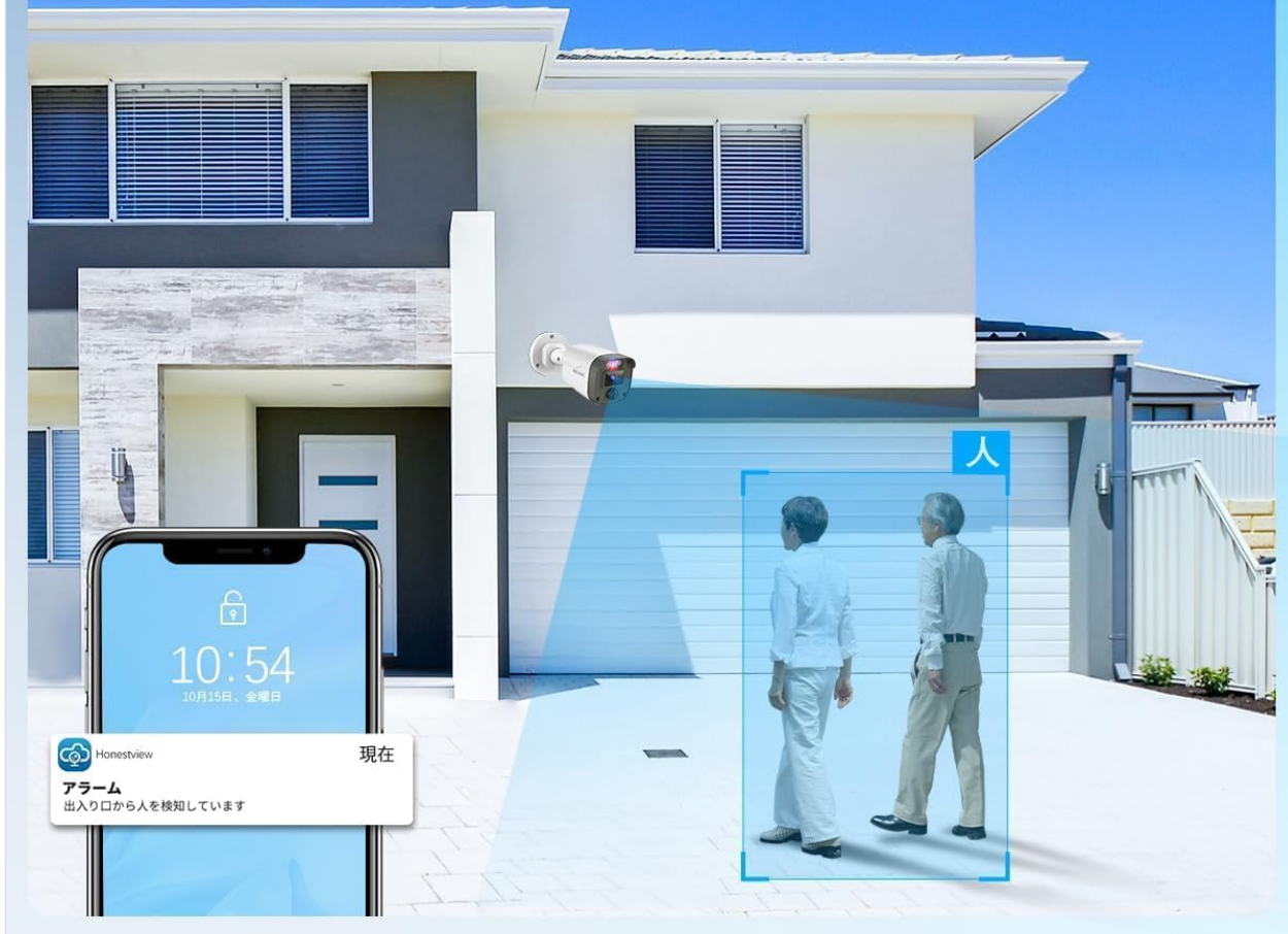
Image: A visual representation of the motion detection feature, showing a person being detected by a camera, triggering both an app notification and an email alert.