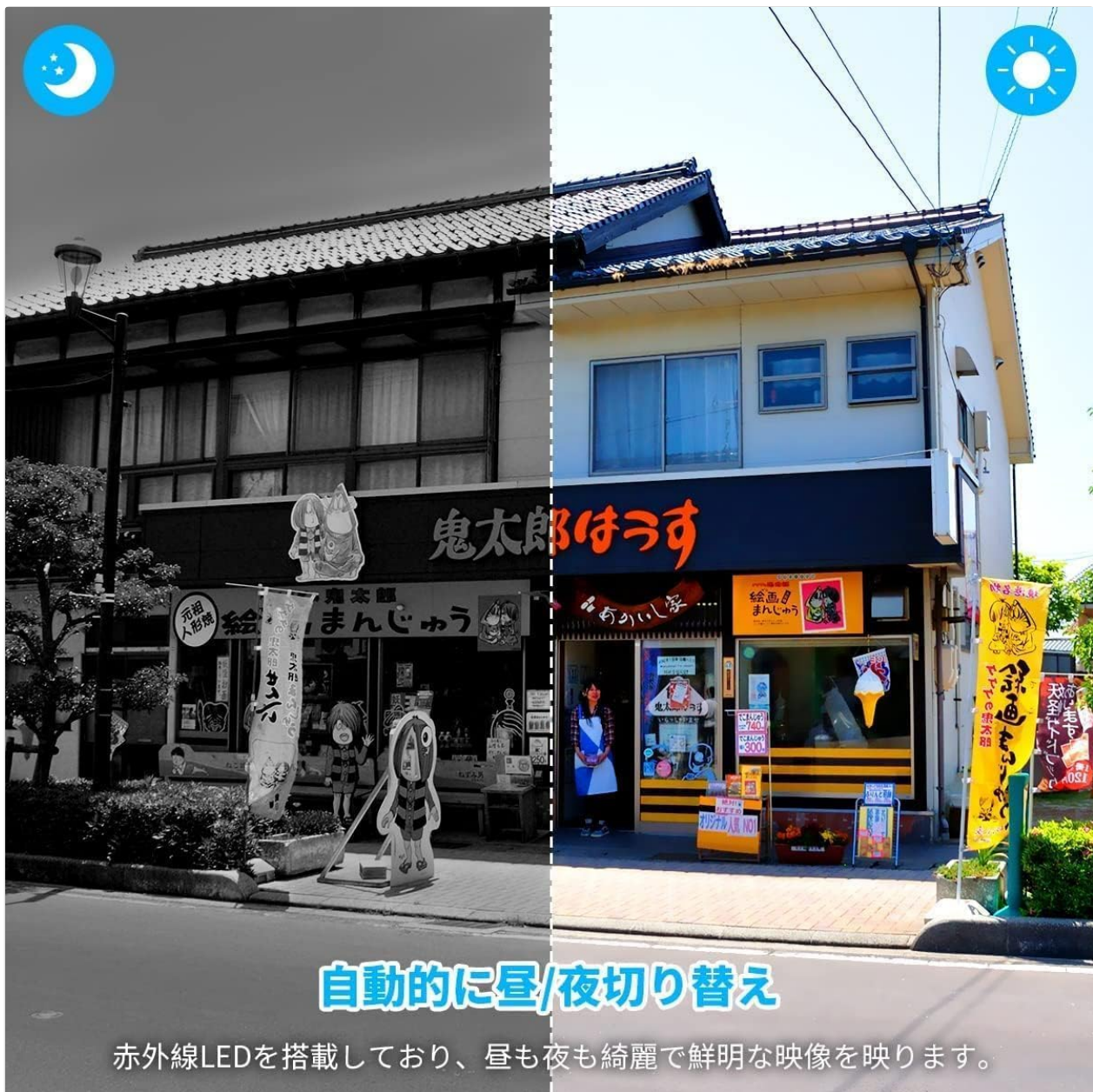
Image: A split image demonstrating the automatic day/night switching capability, with one side showing a clear color image during the day and the other showing a clear black-and-white infrared image at night.