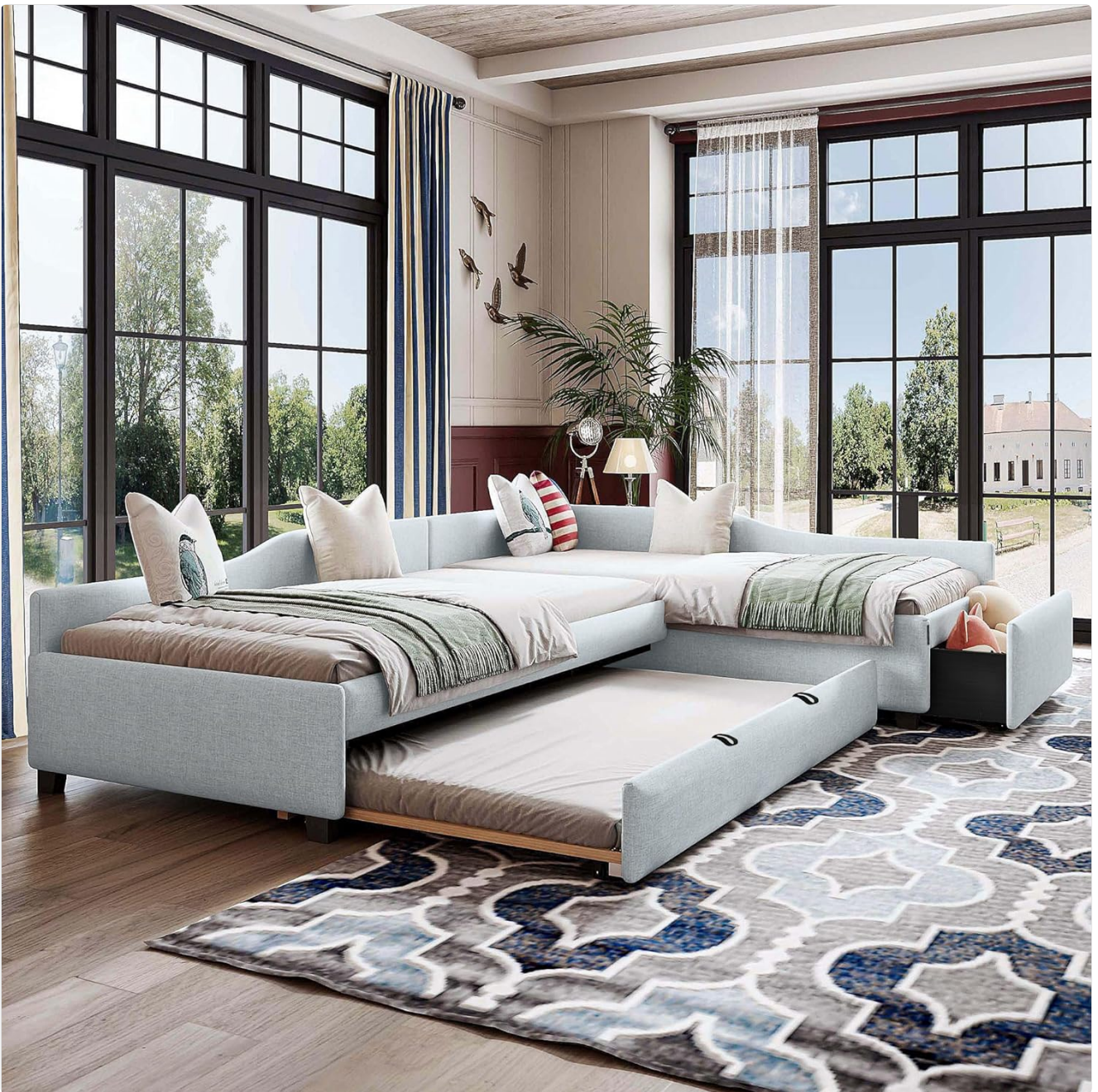
Image: The L-shaped daybed with the trundle bed fully pulled out and the storage drawers open, demonstrating the multi-functional design. This shows the trundle and drawers in use.