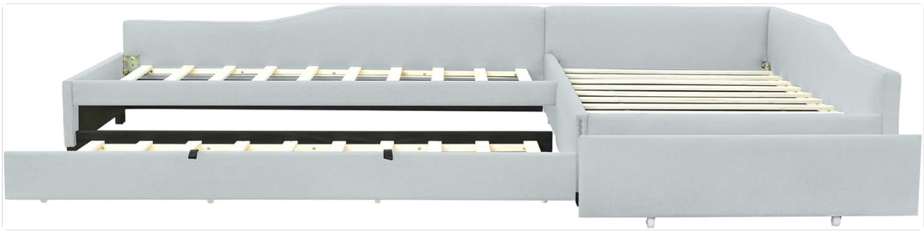
Image: A different angled view from below the daybed, providing another perspective of the retracted trundle bed and storage drawers, emphasizing their compact integration. This offers an alternative view of the retracted components.