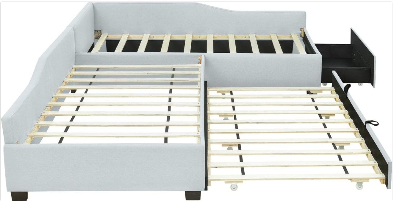
Image: An overhead view of the daybed frame with the trundle fully extended, revealing the complete wood slat foundation for both sleeping surfaces. This illustrates the full extension of the trundle.