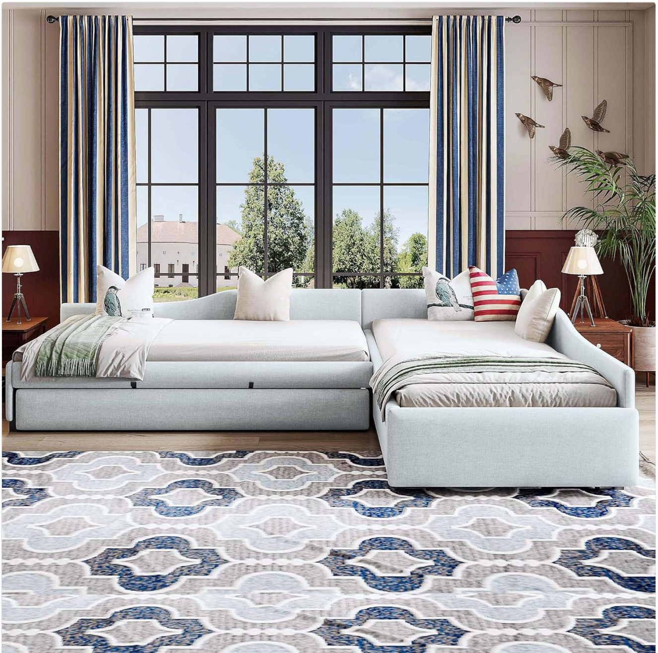
Image: Fully assembled L-shaped daybed with trundle and drawers, shown in a room. This image provides an overview of the final

Begin by connecting the L-shaped sections of the daybed. Ensure all bolts are securely tightened but do not overtighten.