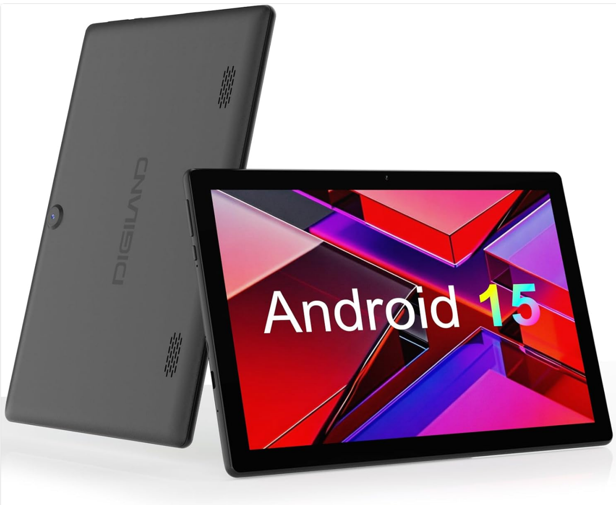
Figure 1: DigiLand 10.1 inch HD Tablet (Front and Back View)