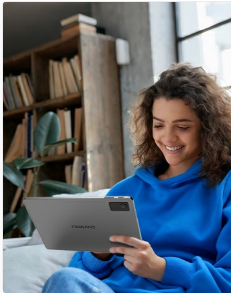
Figure 2: User interacting with the DigiLand Tablet