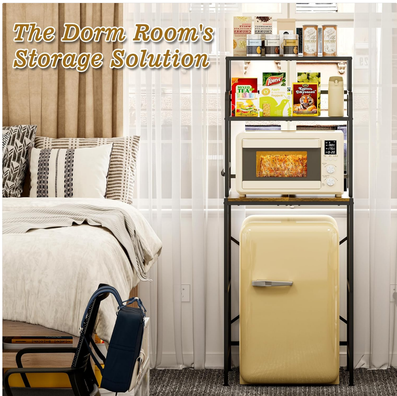
Image: Example of the stand in a dorm room setting.