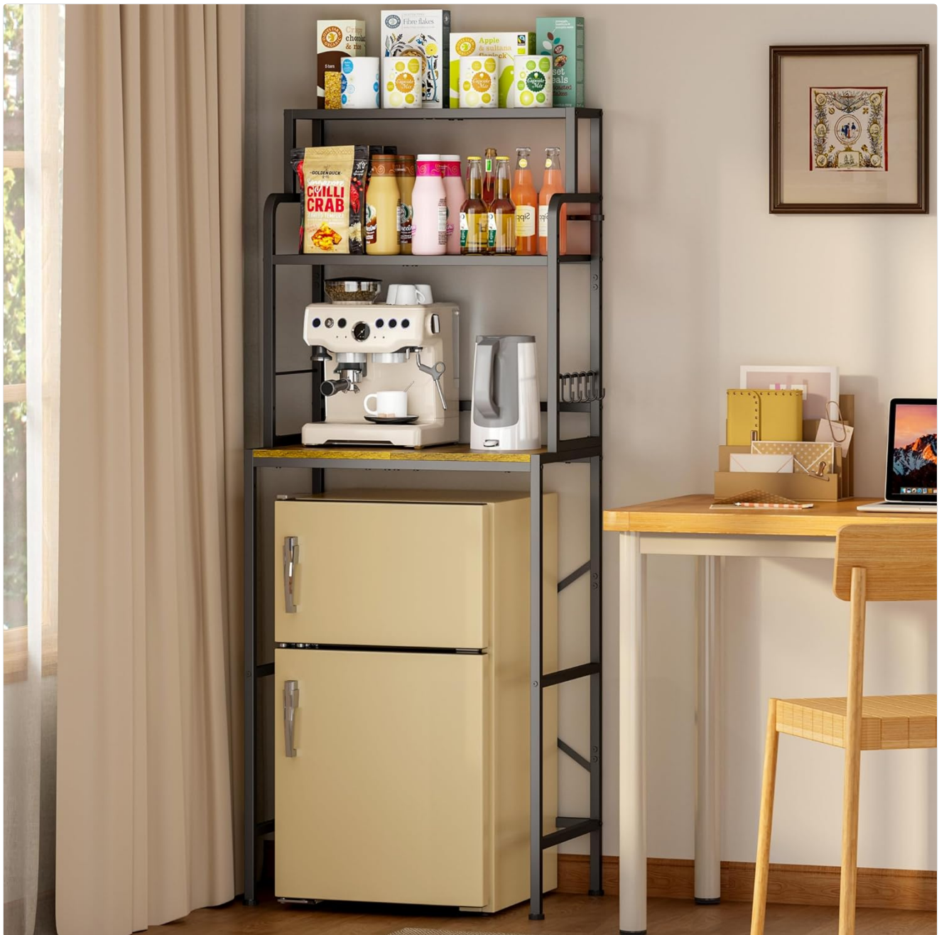
Image: Example of the stand set up as a coffee bar.