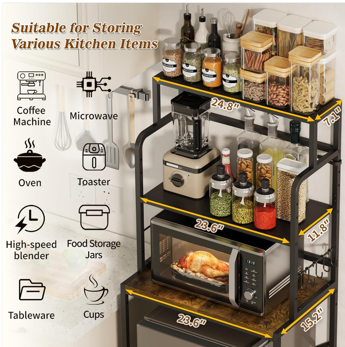
Image: The stand organized with various kitchen items and appliances.