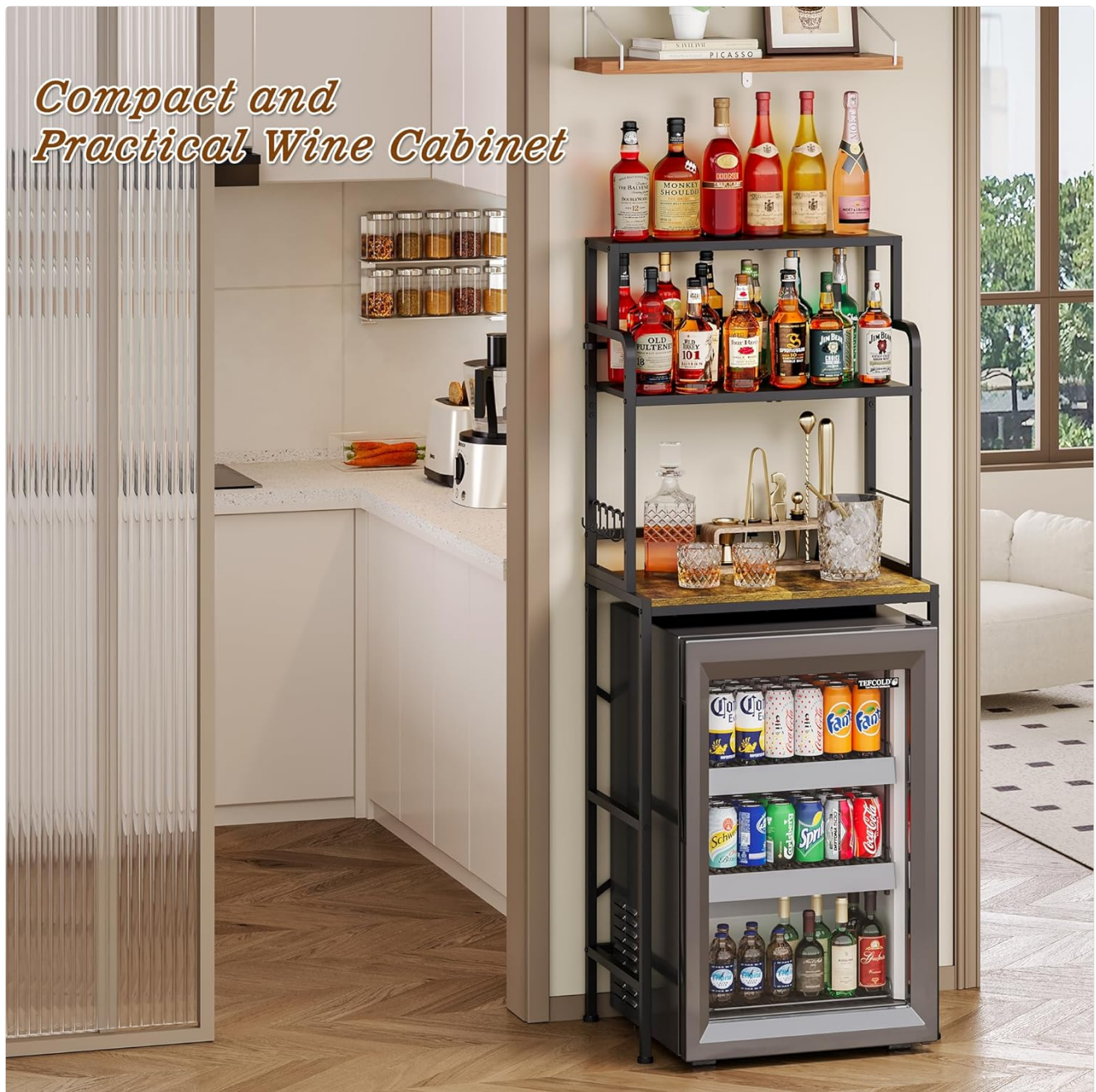
Image: Example of the stand configured as a compact wine cabinet.