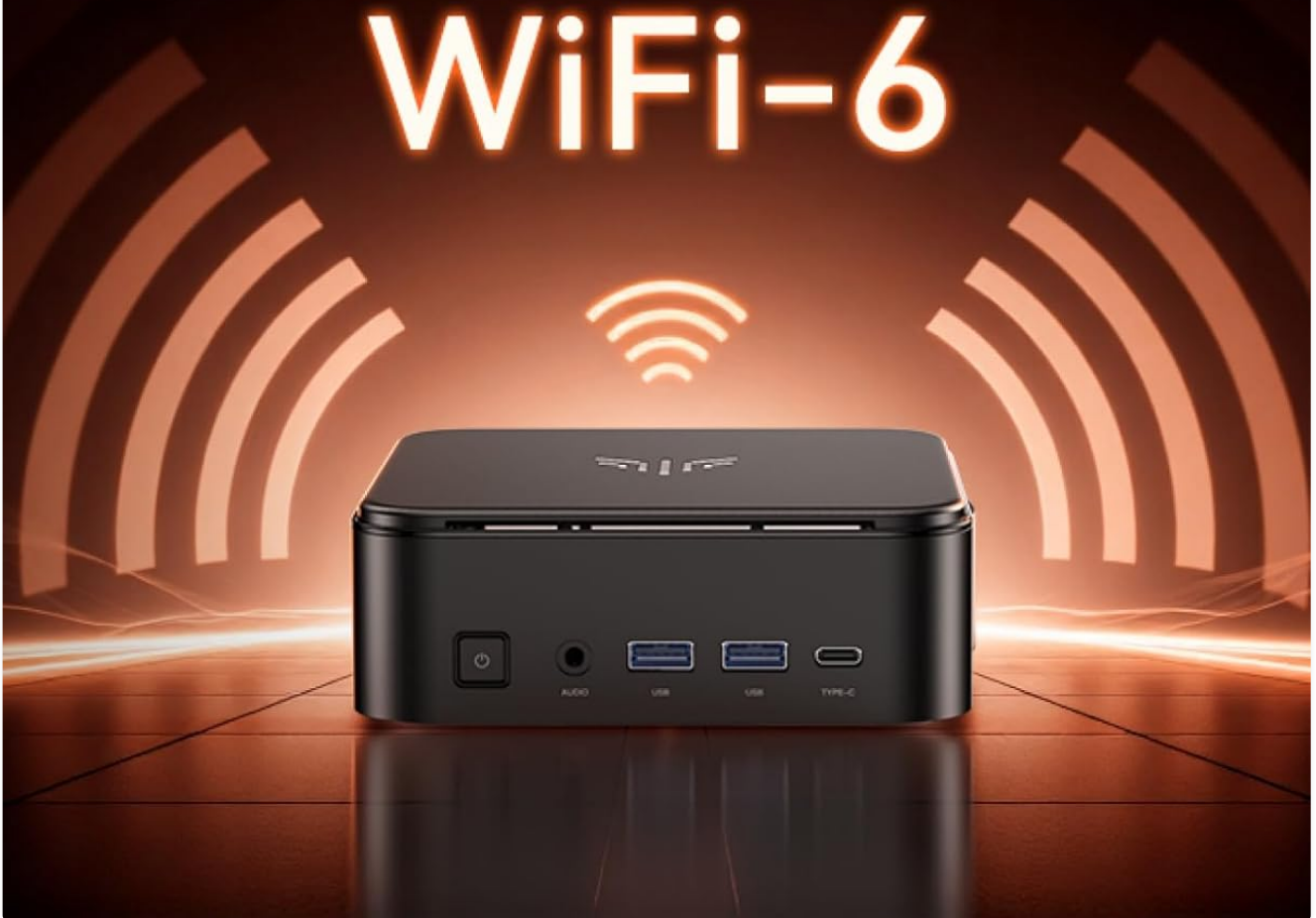
Image: The NiPoGi E3B Mini PC, illustrating its WiFi 6 capabilities and LAN port.