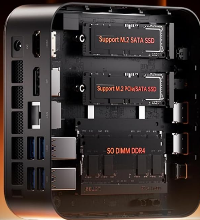
Image: Internal view of the NiPoGi E3B Mini PC, showing the M.2 SSD slots and SO-DIMM DDR4 memory slots.