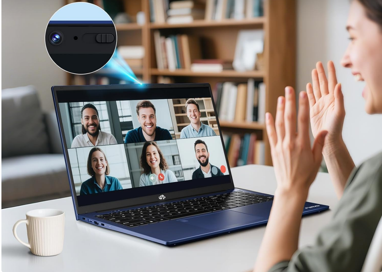
Image: A close-up of the laptop's webcam with a privacy switch, demonstrating the privacy-focused camera convenience.

Stay in control with a built-in privacy camera switch - easily disable your 2.0M webcam when not in use