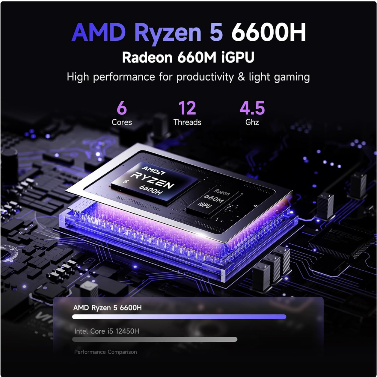
Image: Detailed view of the AMD Ryzen 5 6600H processor and Radeon 660M iGPU, highlighting its core count, thread count, and clock speed for productivity and light gaming.

Equipped with an AMD Ryzen 5 6600H CPU (6 cores, 12 threads, up to 4.5 GHz) and a Radeon 660M GPU (6 GPU cores, 1900 MHz clock speed), this laptop delivers reliable performance for multitasking, demanding applications, and smooth gameplay.