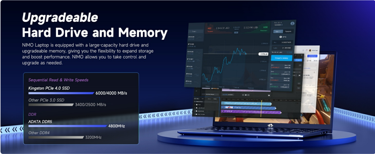
Image: An illustration highlighting the upgradeable hard drive and memory components of the NIMO laptop, showing sequential read/write speeds for Kingston PCIe 4.0 SSD and DDR5 RAM.

The NIMO N173 supports user-upgradable dual-channel DDR5 RAM and expandable PCIe 4.0 SSD storage. Refer to the detailed upgrade instructions available on the NIMO support website or consult a professional technician for assistance.