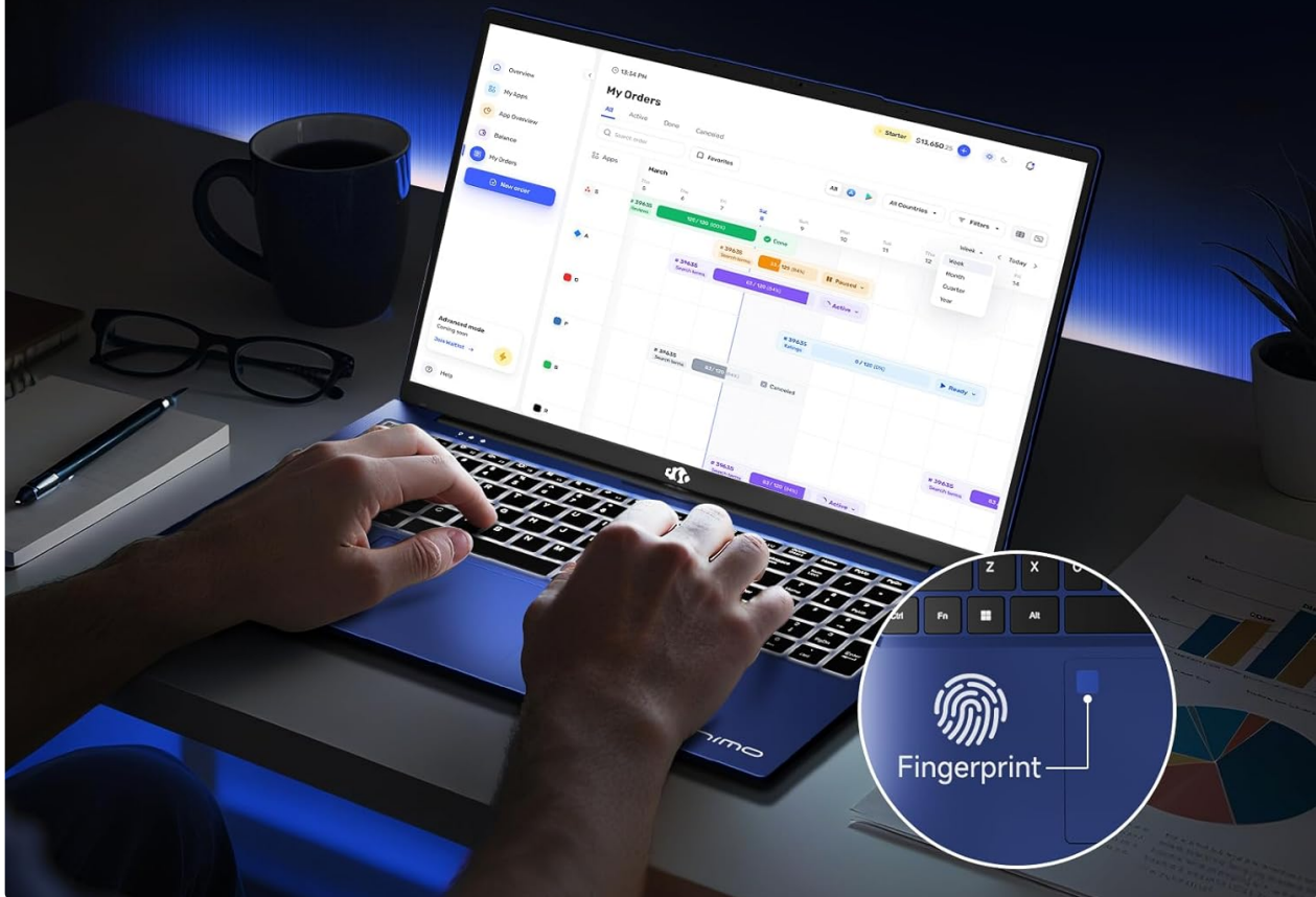
Image: A view of the laptop's backlit keyboard and integrated fingerprint reader, along with icons for webcam shield and numeric keypad, emphasizing smart design.