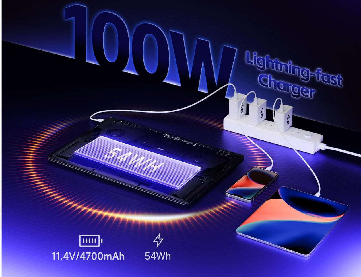
Image: An illustration showing the 100W USB-C PD fast charger connected to the laptop and other devices, highlighting its versatility and quick charging capabilities.