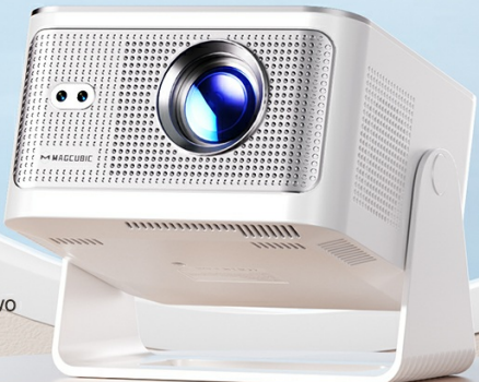
Figure 3: 1080P Native Resolution Clarity