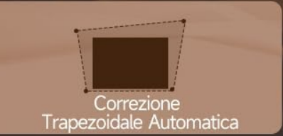
Figure 2: Key Features of the HY350MAX Projector