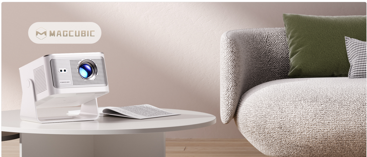
Figure 1: Magcubic HY350MAX Portable Projector Overview

Thank you for choosing the Magcubic HY350MAX Portable Projector. This manual provides essential information for setting up, operating, and maintaining your device. Please read it thoroughly before use to ensure optimal performance and safety.