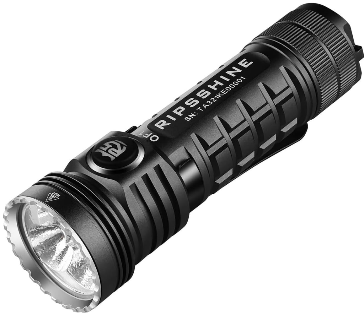
Image: The JETBeam RIPSSHINE OF1 flashlight, showcasing its compact design.