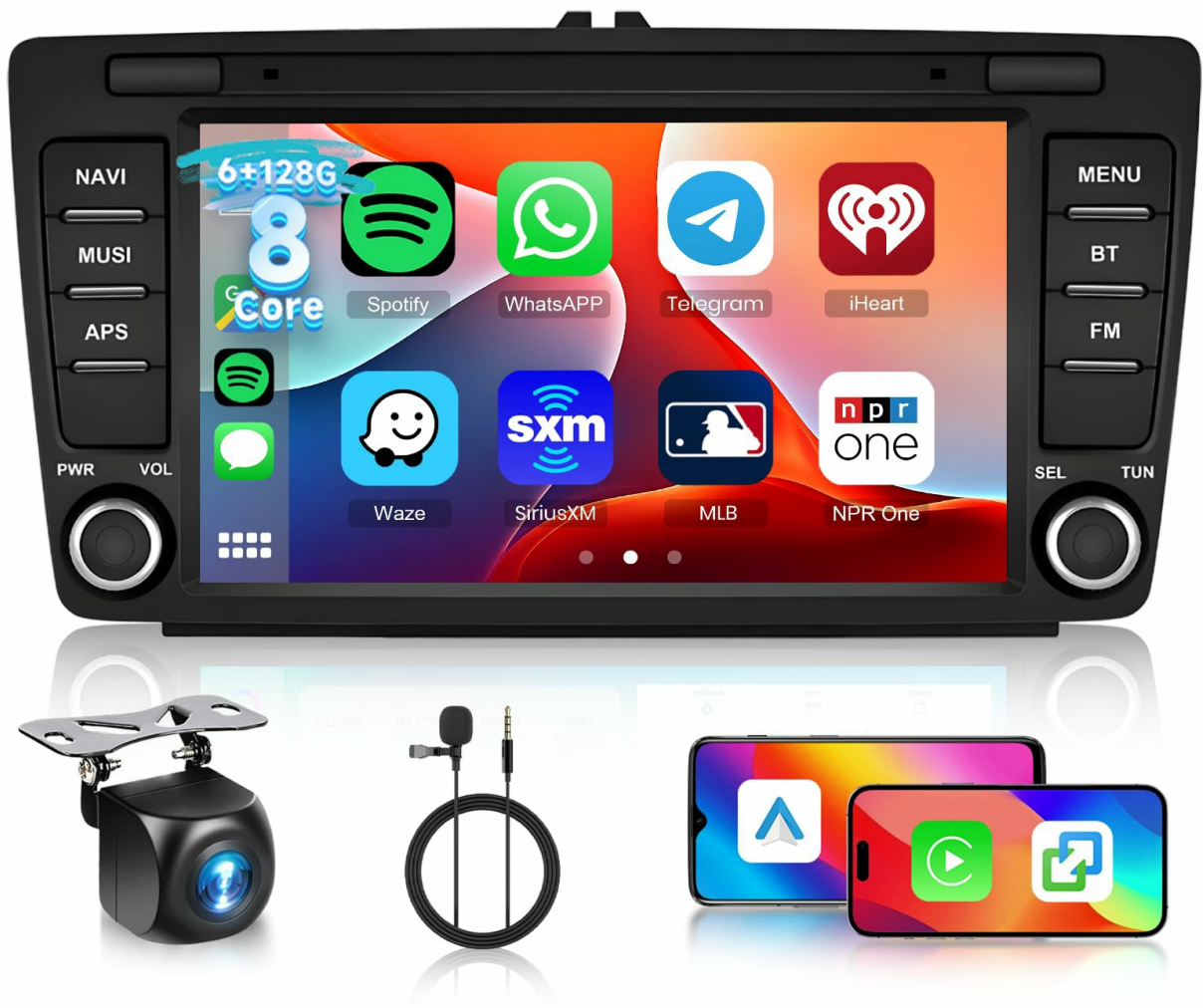
Figure 1: Hodozzy 8-inch Car Radio Main Unit