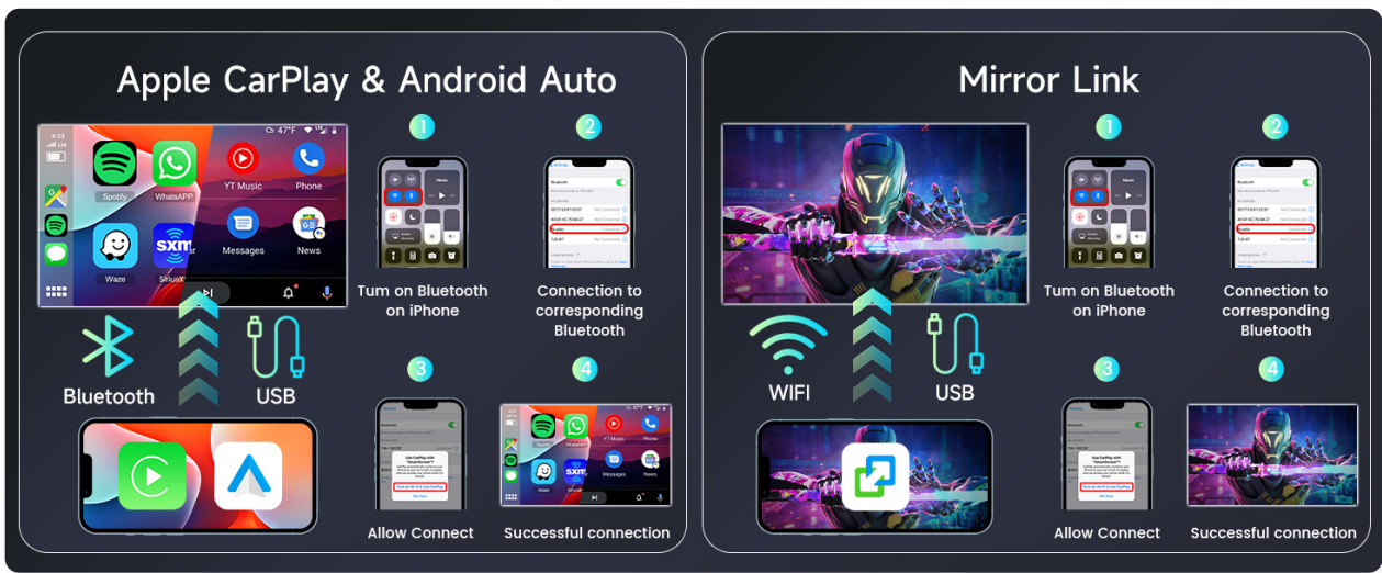
Figure 5: Smartphone Integration via CarPlay, Android Auto, and Mirror Link