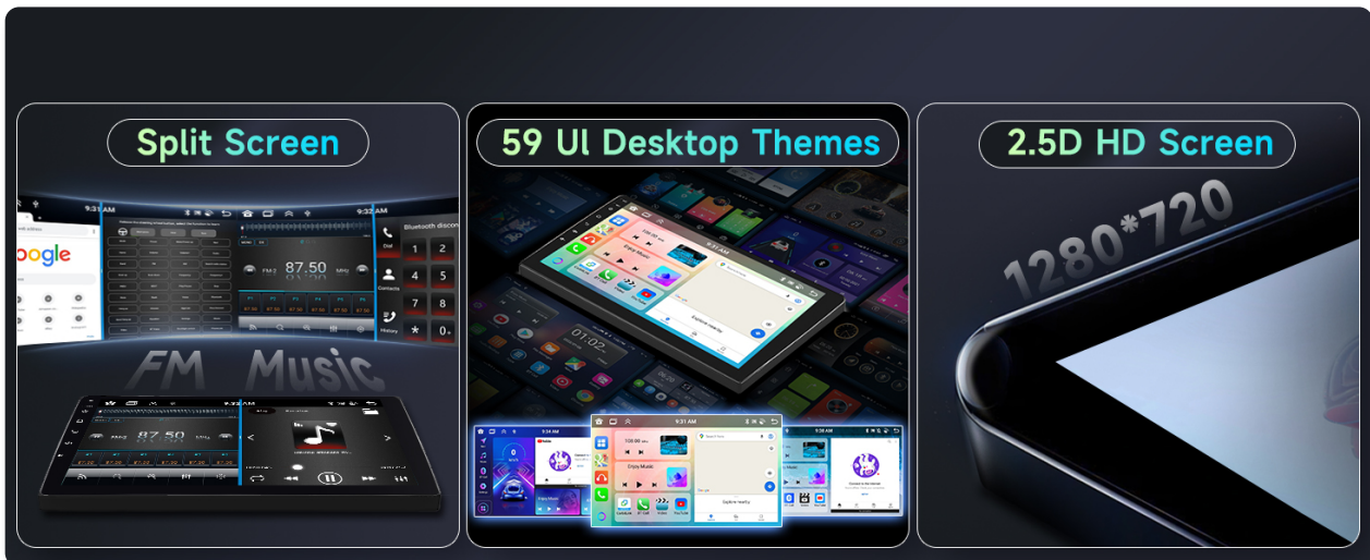
Figure 9: Customizable Interface and Split Screen Functionality