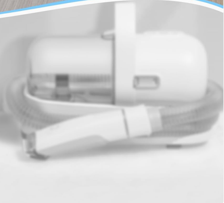
Image 4.1: Illustration of the 3L large capacity dust cup.