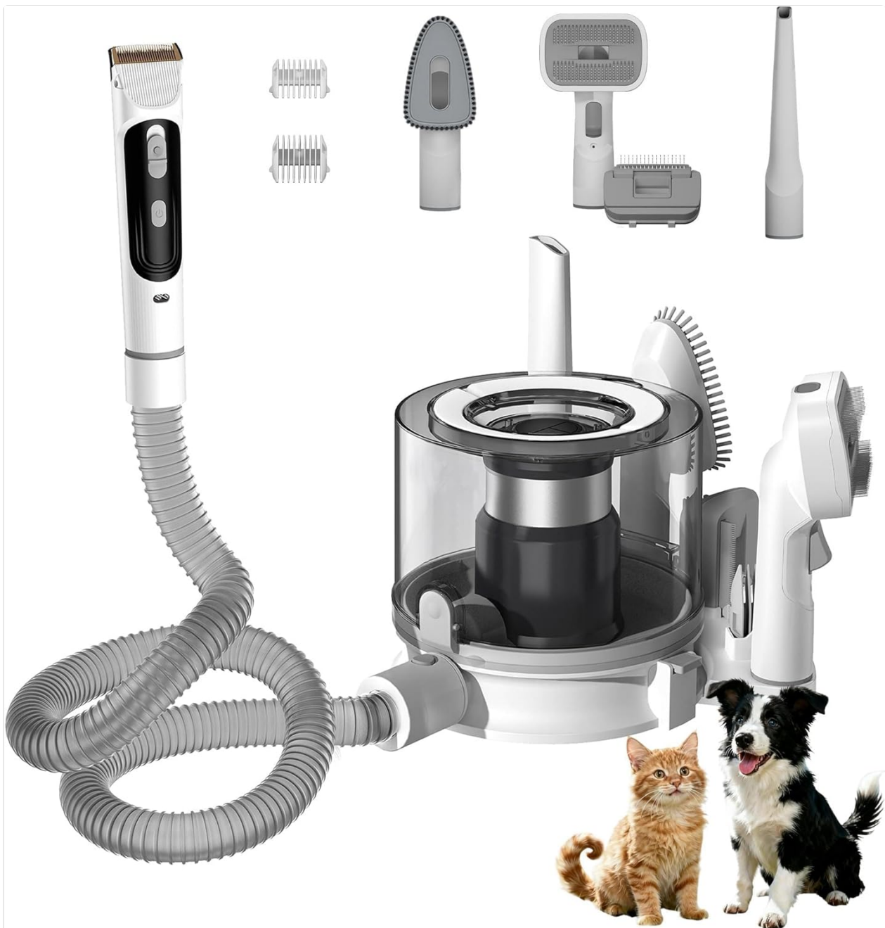
Image 1.1: Nicebay Pet Grooming Vacuum Cleaner with included accessories.

This image displays the complete Nicebay Pet Grooming Vacuum Cleaner system, including the main vacuum system, flexible hose, and all five interchangeable grooming tools: the electric trimmer, grooming comb, slicker comb, crevice tool, and cleaning brush. A small dog and cat are shown in the foreground, illustrating the product's intended use for various pets.