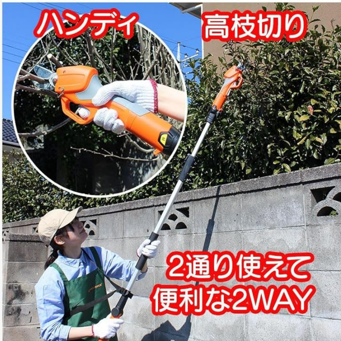
Figure 4: The YARDFORCE pruner in use, demonstrating its ability to reach and cut high branches with the integrated catch function.