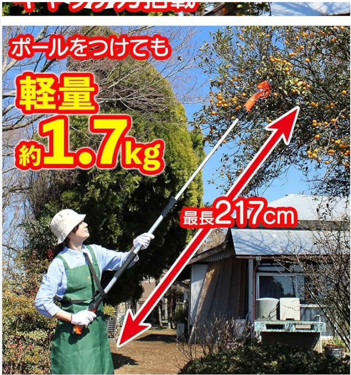
Figure 1: The pruner can be used as a handheld device or with the extension pole for reaching high branches.