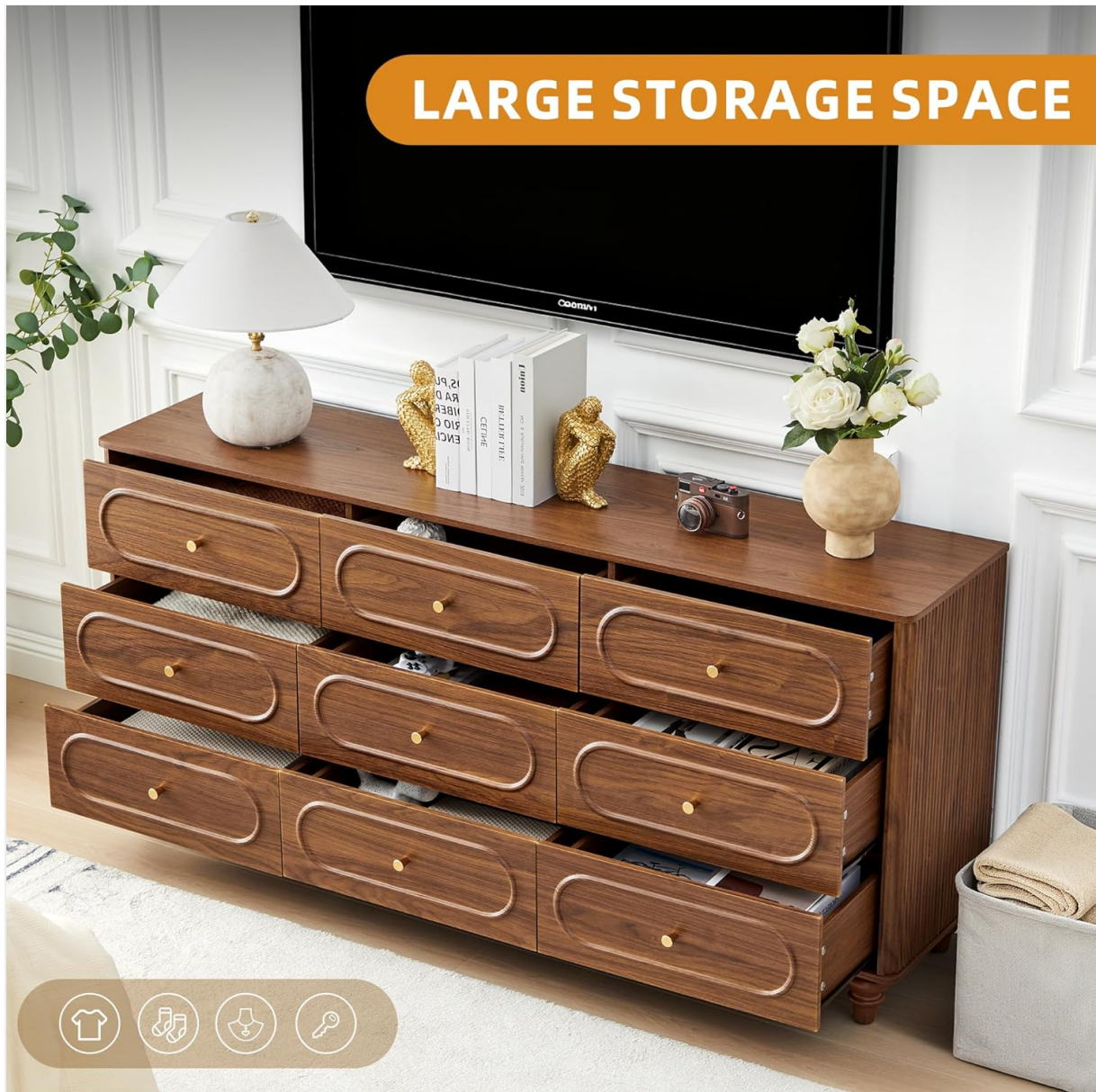
Image 5.1: The dresser with multiple drawers open, illustrating the storage capacity.