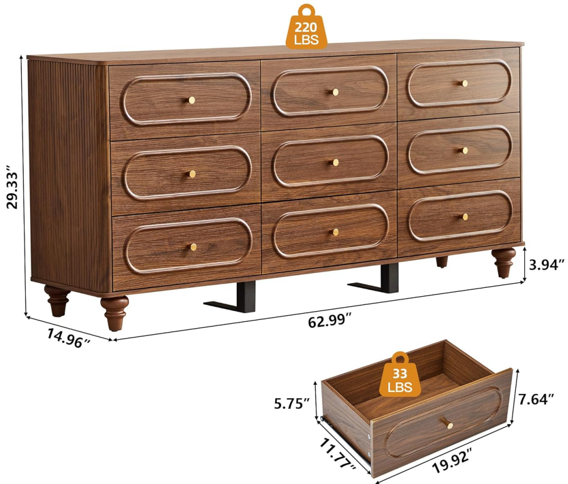
Image 3.1: Product dimensions and weight limits for the ORRD 9-Drawer Fluted Dresser.