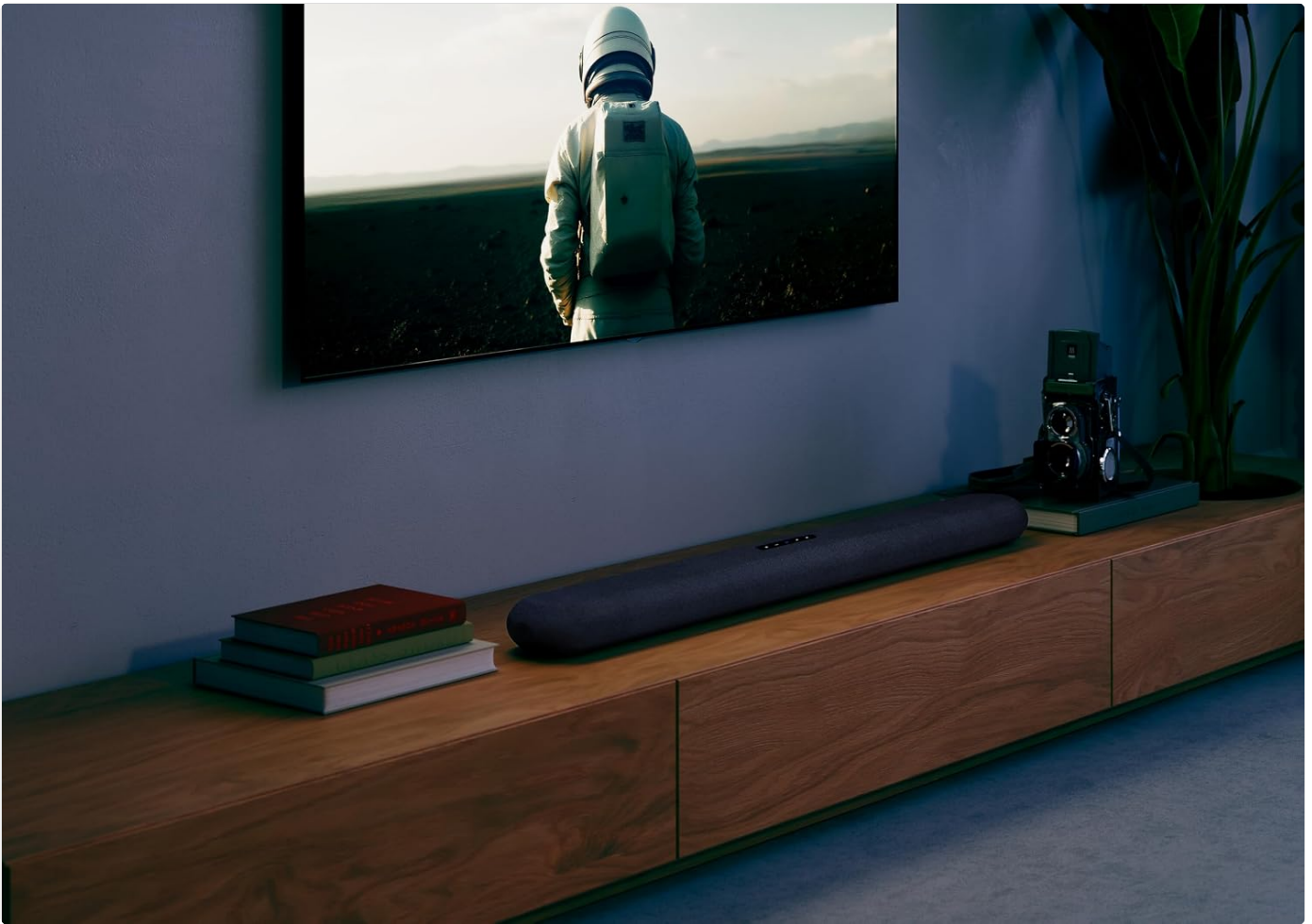
Image: The Bluesound Pulse Cinema Soundbar positioned on a media console, demonstrating a typical tabletop setup.