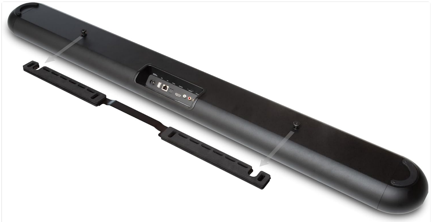
Image: A detailed view of the rear panel of the Bluesound Pulse Cinema Soundbar, highlighting the HDMI eARC, Optical, Analog, Ethernet, and Subwoofer output ports for connection.