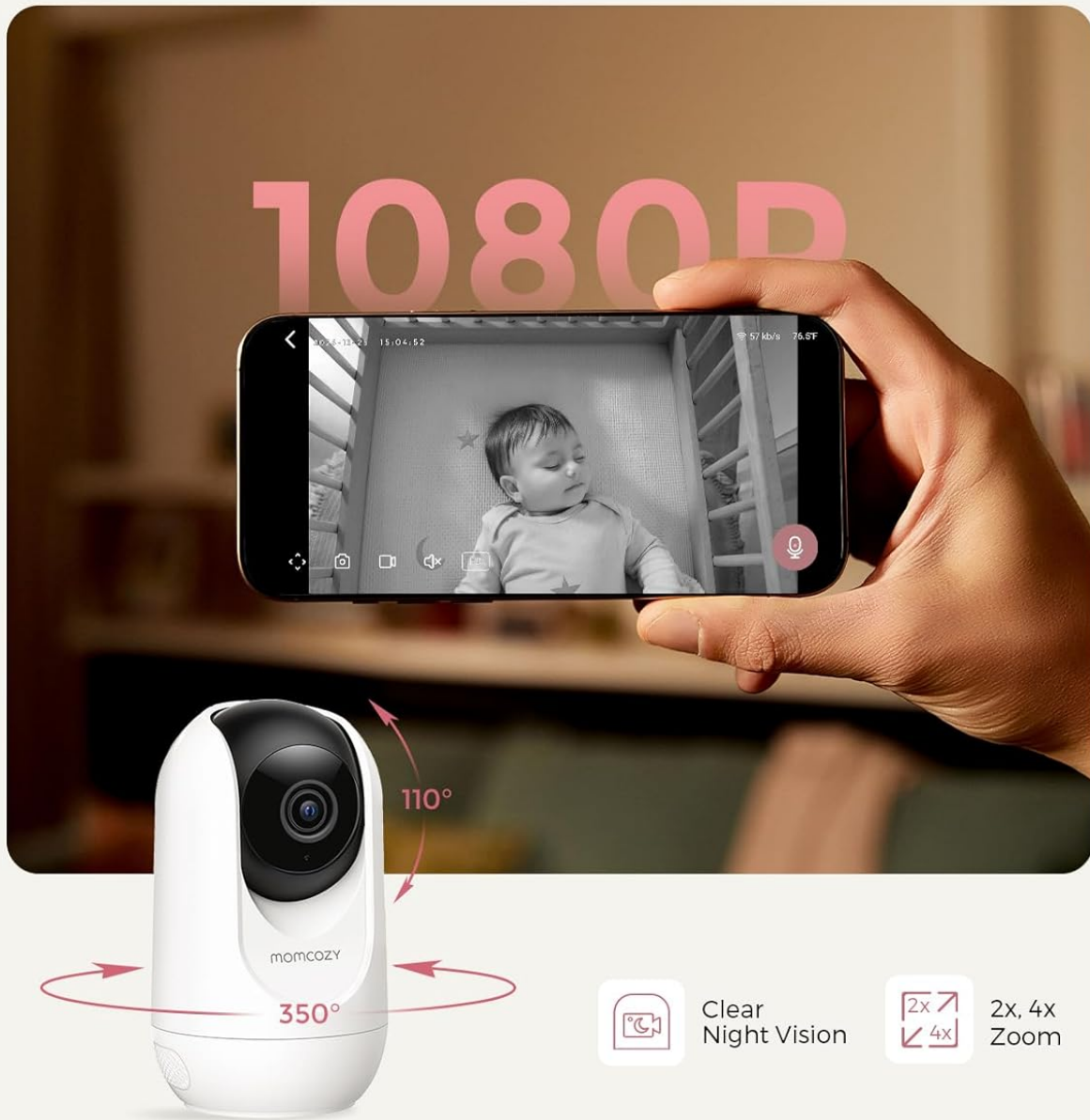
Image: Clear night vision view of a baby in a crib.