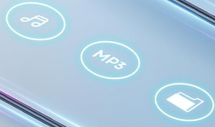
Image: Illustrating the multi-functional compatibility of the device with computers and phones.