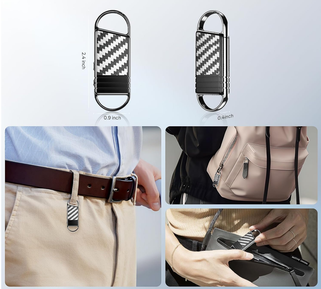
Image: Visual representation of the ultra-portable design and various ways to carry the recorder.