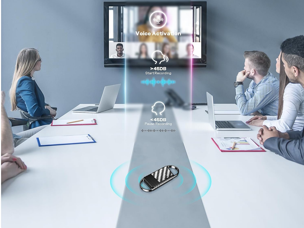
Image: Demonstrating the Voice Activated Recording feature in a meeting setting.

Automatically starts recording when sound is detected