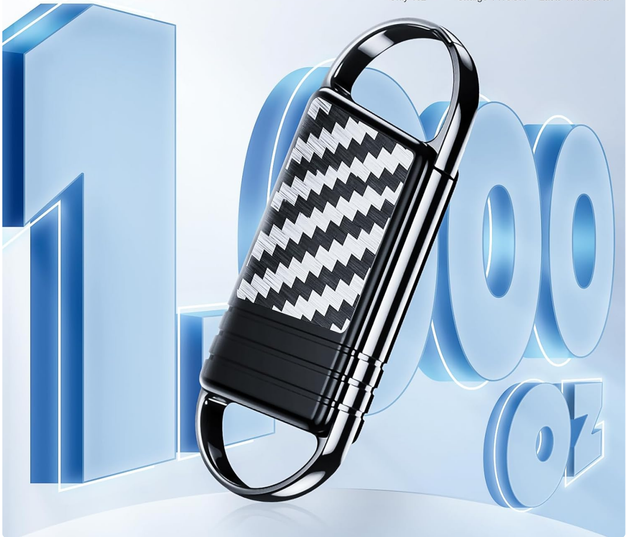
Image: Highlighting the powerful and portable nature of the device, weighing only 1 ounce and offering long battery life.