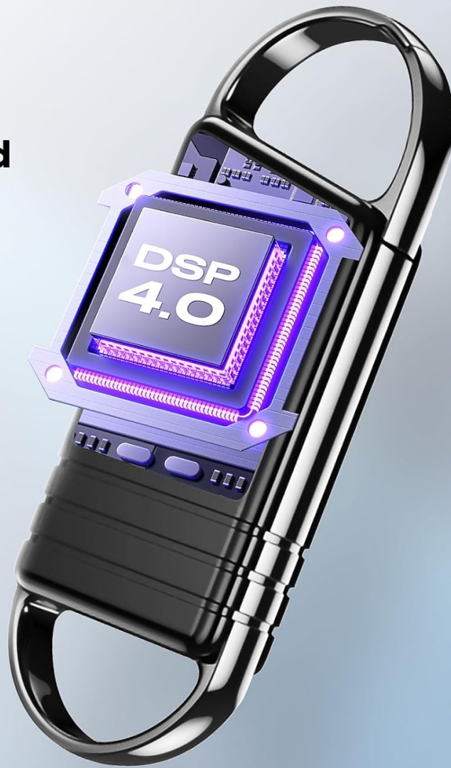
Image: Overview of the Xelarvex Digital Voice Recorder highlighting its core features.