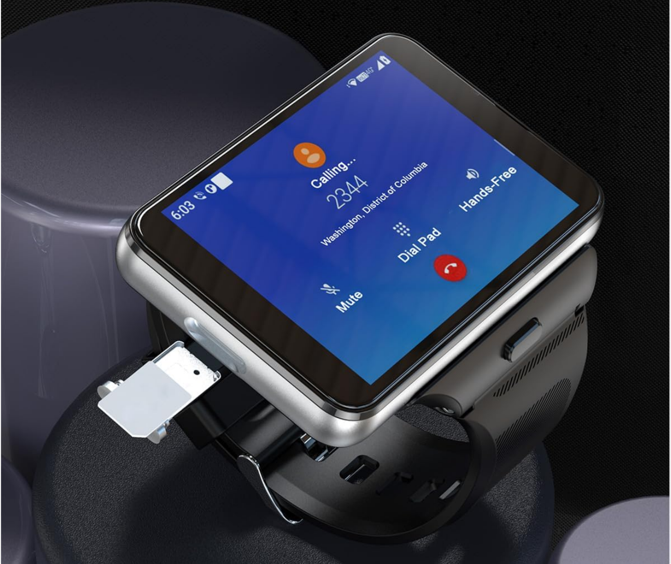
Image: The Rainbuvvy 4G Smartwatch featuring its HD dual cameras (200W+800W) for photography and video calls.