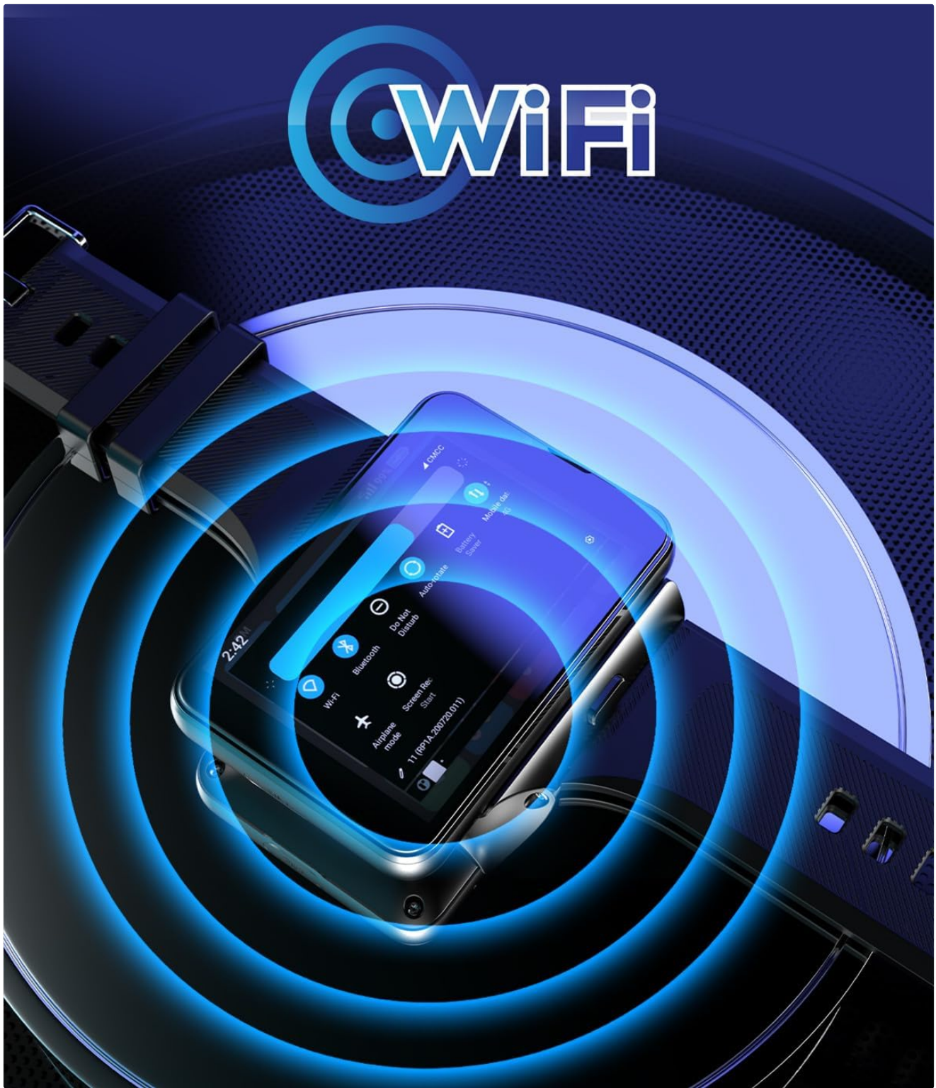
Image: Close-up view of the Rainbuvvy 4G Smartwatch highlighting the independent SIM card slot for network connectivity.