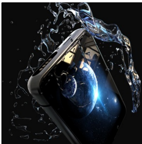
Image: The smartwatch being splashed with water, illustrating its water-resistant design.