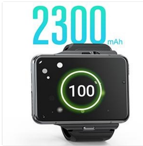
Image: The smartwatch display showing a 100% battery charge indicator, powered by its 2300mAh battery.