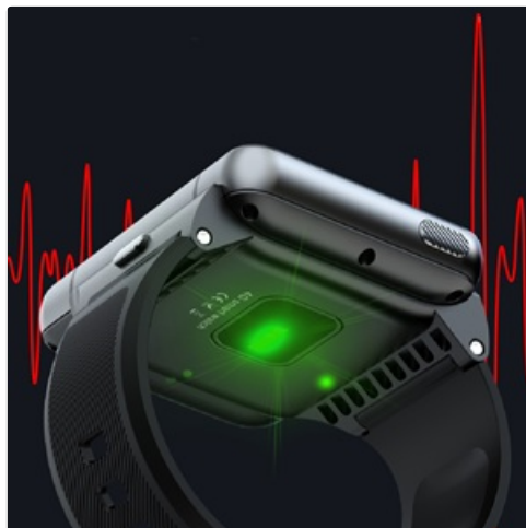
Image: The back of the smartwatch showing the heart rate sensor in operation, emitting a green light.

The device functions as an activity tracker, measuring various metrics. Access fitness features through dedicated applications on the watch.