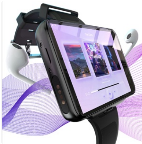
Image: The smartwatch displaying a music player interface, paired with wireless earbuds for audio playback.

The smartwatch can play music directly. Connect Bluetooth headphones for a wireless audio experience.