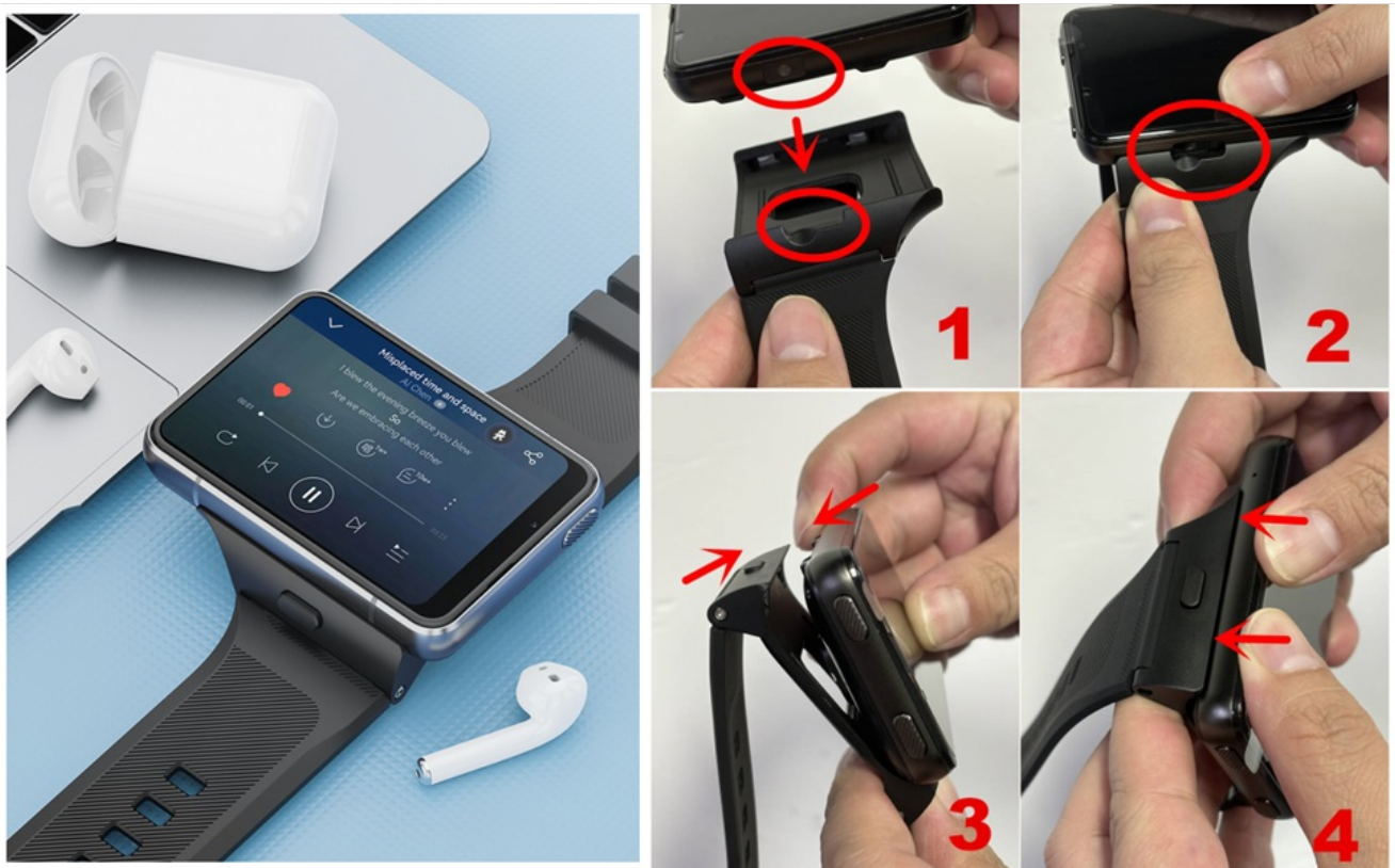
Image: Visual steps illustrating how to detach and attach the smartwatch body from its band for convenience.