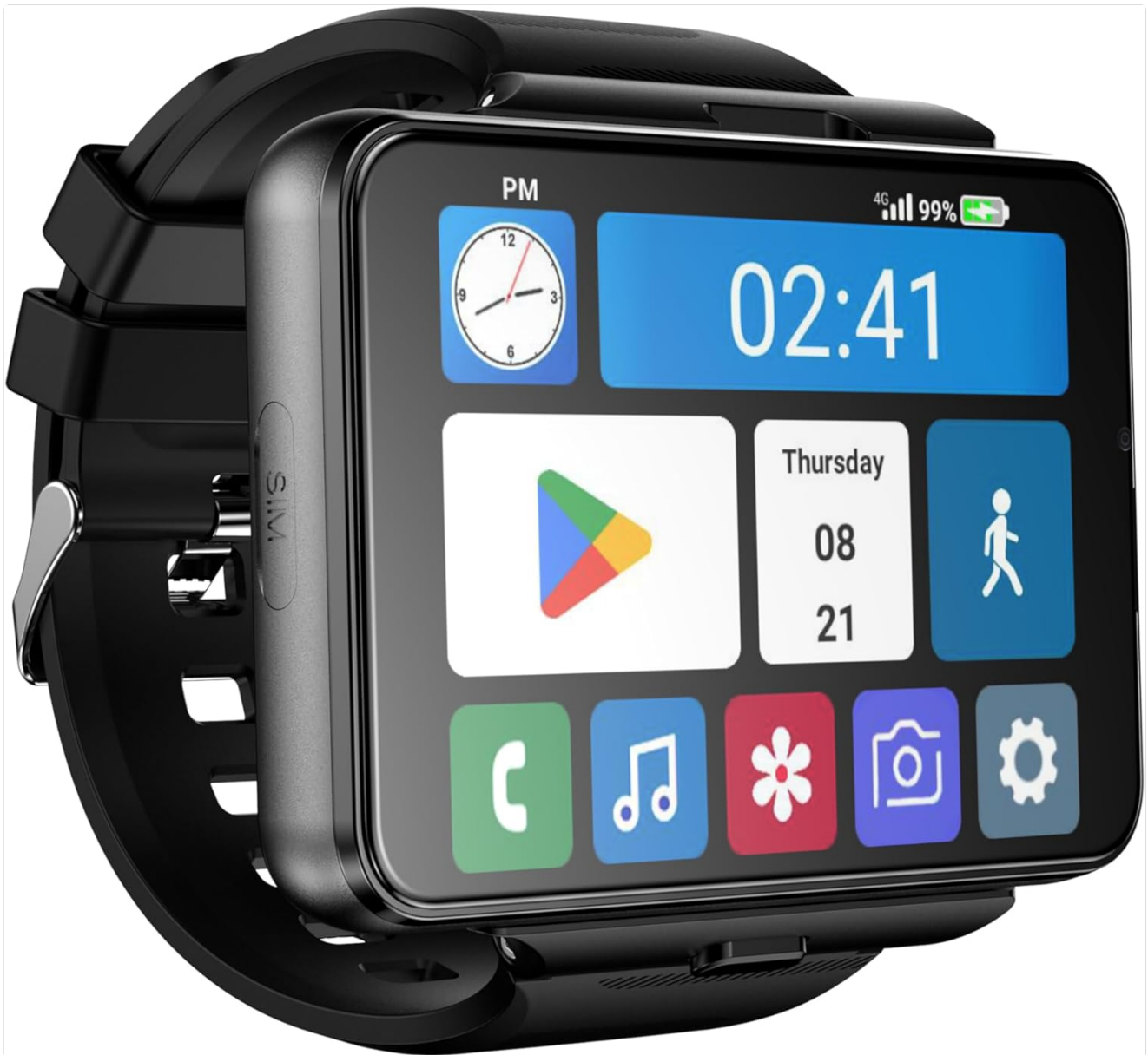
Image: The Rainbuvvy 4G Smartwatch with its detachable band and charging cable.