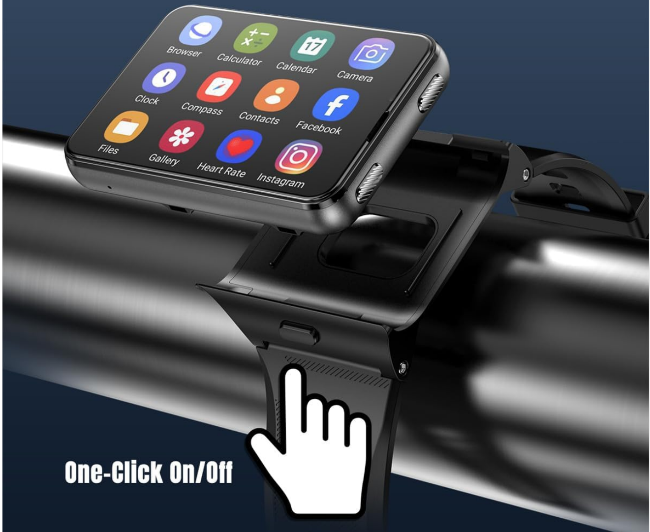
Image: The smartwatch screen displaying a grid of third-party applications available for download and use.