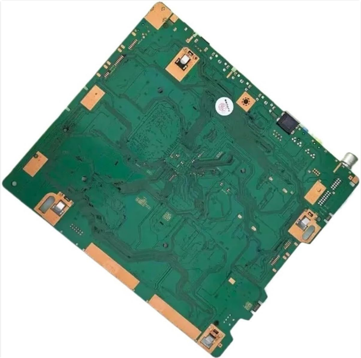
Figure 5.2: Rear view of the main board, displaying the circuit traces and solder points. This side typically faces the TV chassis.