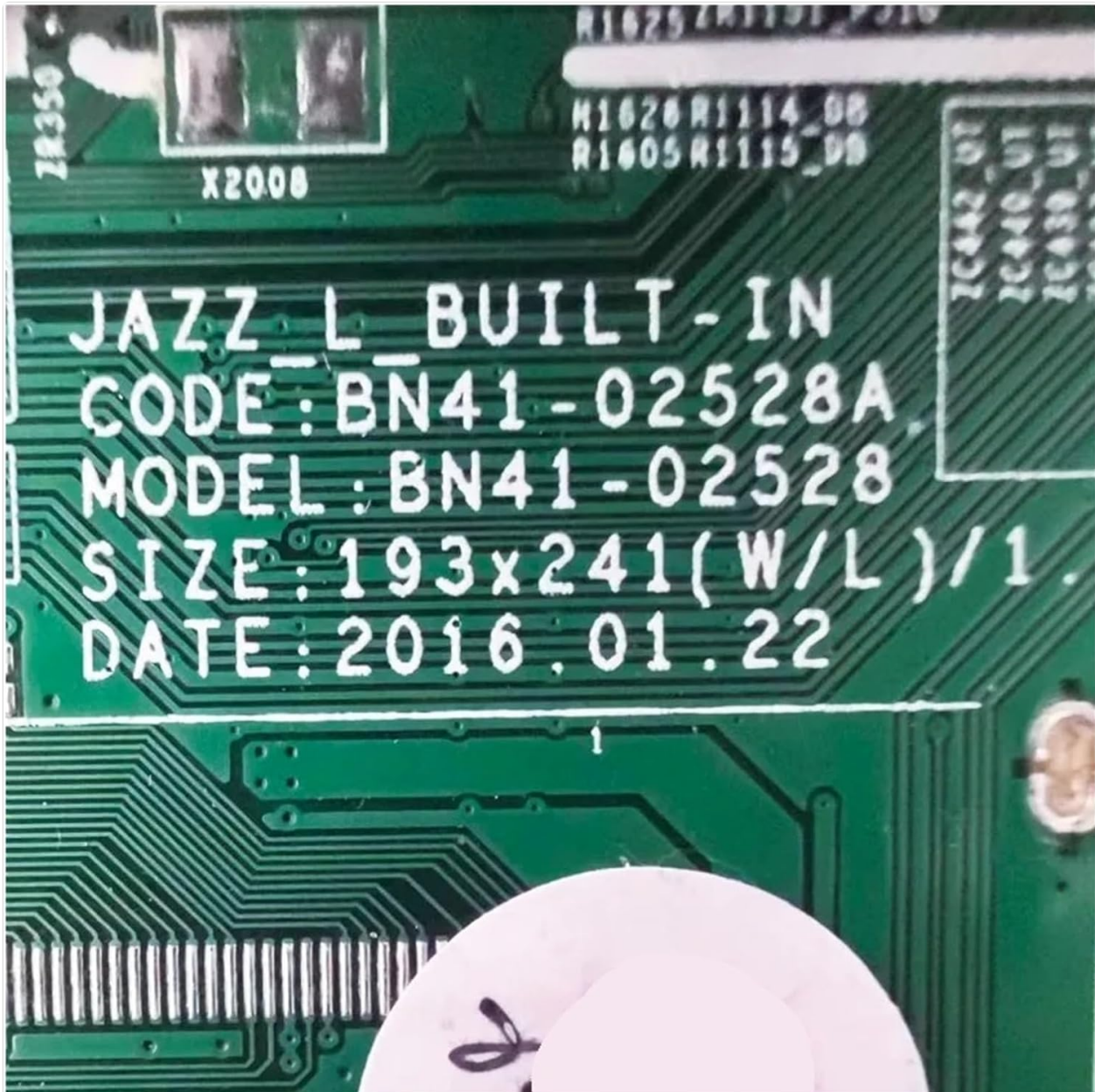
Figure 4.1: Close-up view of the main board, highlighting the printed model number "BN41-02528A" for verification.

Please verify the part number on your existing main board matches one of the compatible part models listed above before attempting replacement.