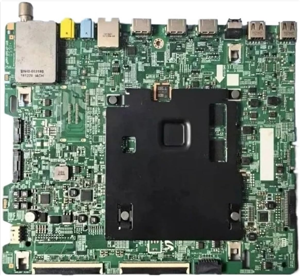
Figure 2.1: Top view of the LIKENDWB compatible Samsung TV main board, showing various integrated circuits, ports, and connectors.