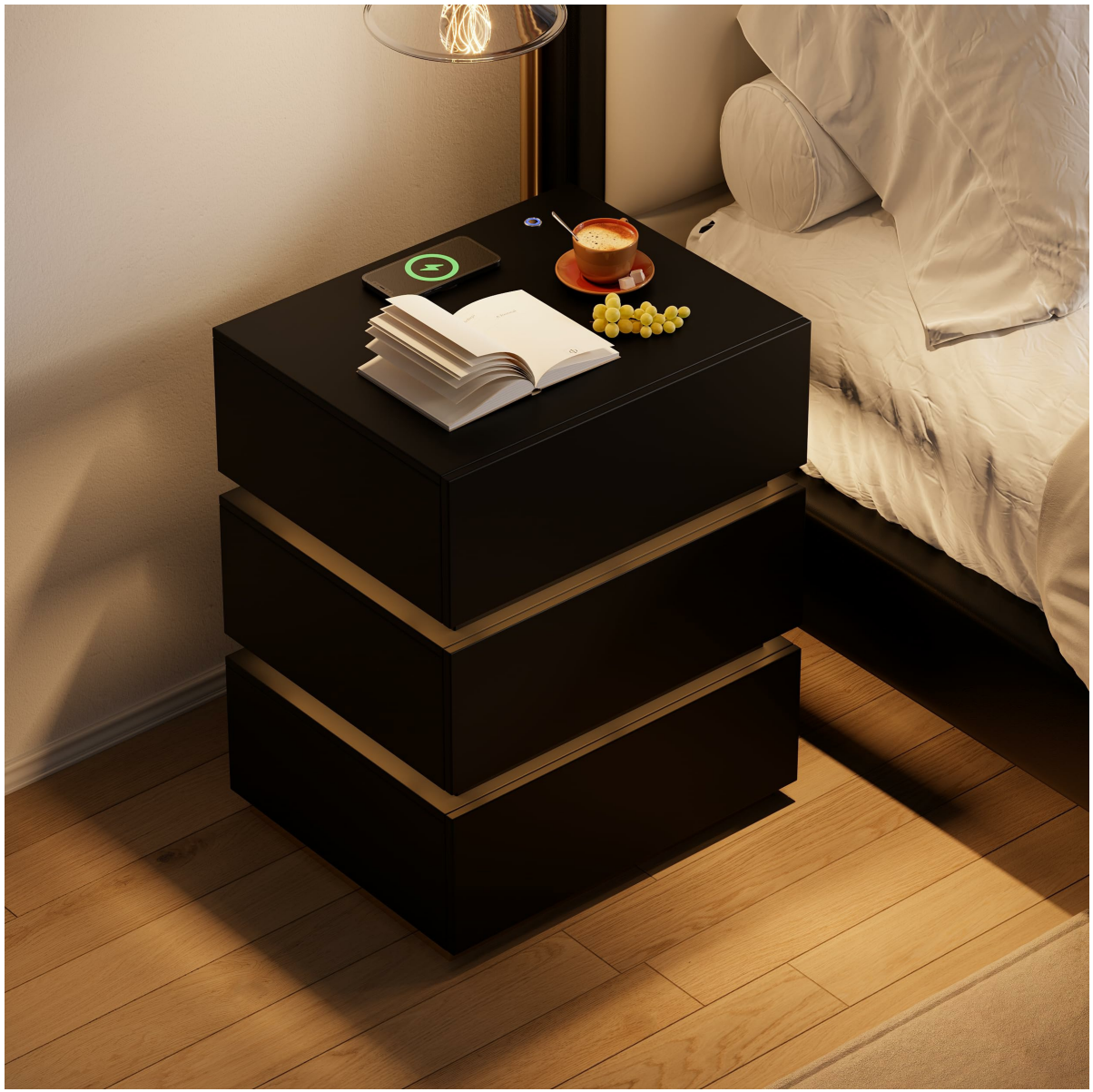
Image 1.1: The Homary 3-Drawer LED Smart Nightstand, showcasing its modern design and integrated features.