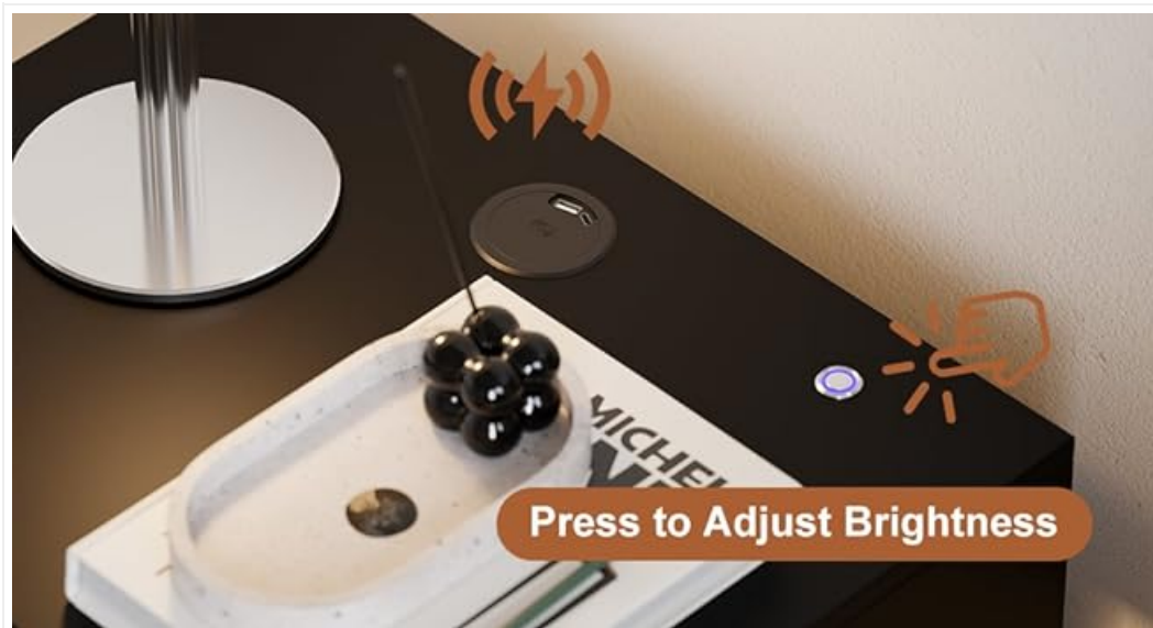
Image 5.1: Location of the LED control button and wireless charging pad.