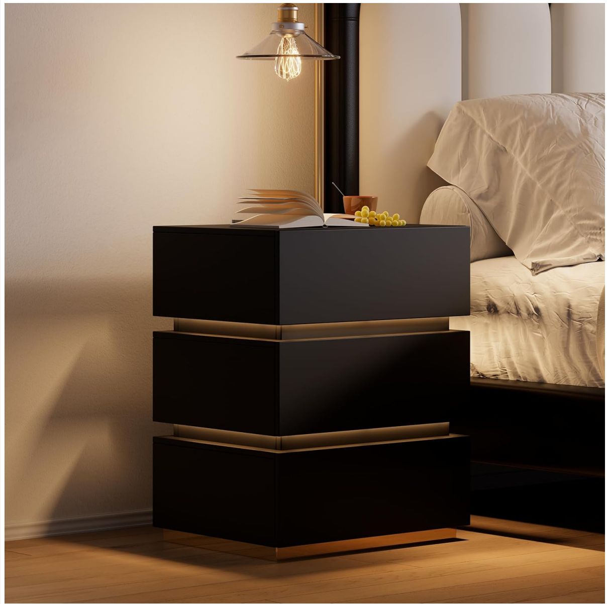
Image 5.2: Wireless charging in action and the illuminated LED button.