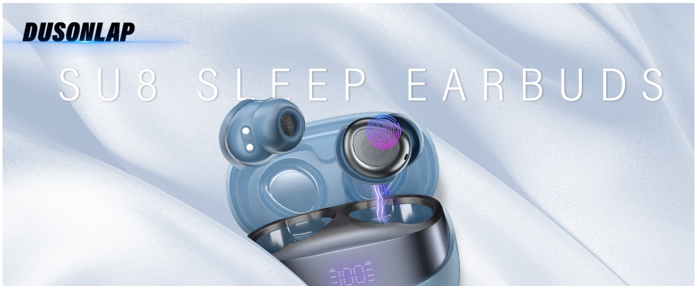
Image: DUSONLAP SU8 Sleep Earbuds and their charging case, highlighting the product name.

The DUSONLAP SU8 Sleep Earbuds are designed to provide a comfortable audio experience, particularly for users seeking to listen to audio while sleeping, focusing, or relaxing. These lightweight, in-ear headphones feature Bluetooth 5.4 technology for stable connectivity and intuitive touch controls.