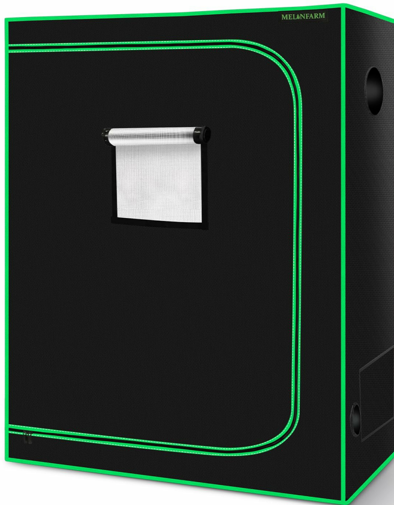
Figure 1: MELONFARM Grow Tent (34"x18"x55") - Model MFGTDD315. This image shows the exterior of the assembled grow tent, highlighting its compact design suitable for various indoor spaces.