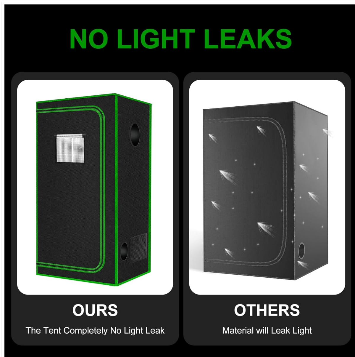
Figure 5: Comparison illustrating the light-proof design of the MELONFARM Grow Tent versus other tents. This highlights the tent's ability to prevent light leaks, crucial for controlled plant growth cycles.

opening the main door, thus maintaining the internal environment.