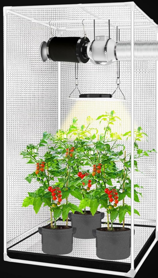
Figure 2: Internal view of the grow tent frame with lightproofing technology. This image illustrates the sturdy frame structure and the reflective interior, emphasizing the light-blocking design around zippers.