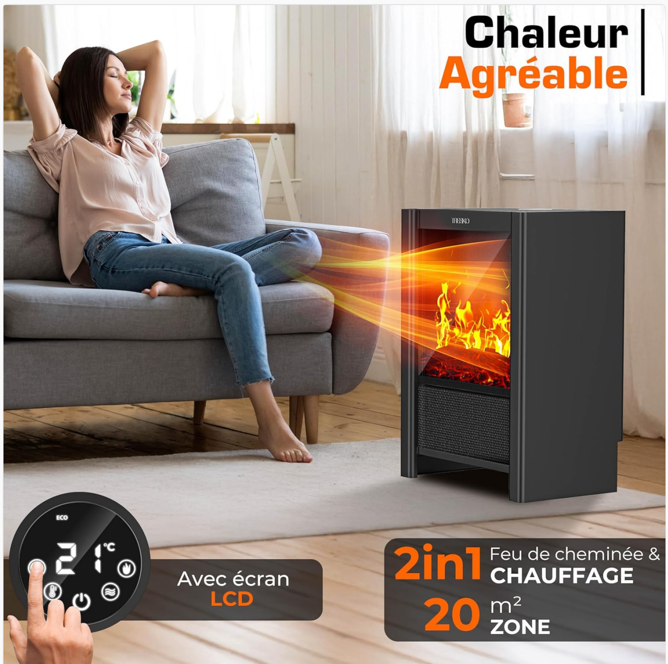
Image: A close-up of the TRESKO Electric Fireplace's LCD screen, displaying the current temperature (21°C) and various control icons for heating, flame effect, and timer settings.

The integrated LCD screen allows direct control of all functions.