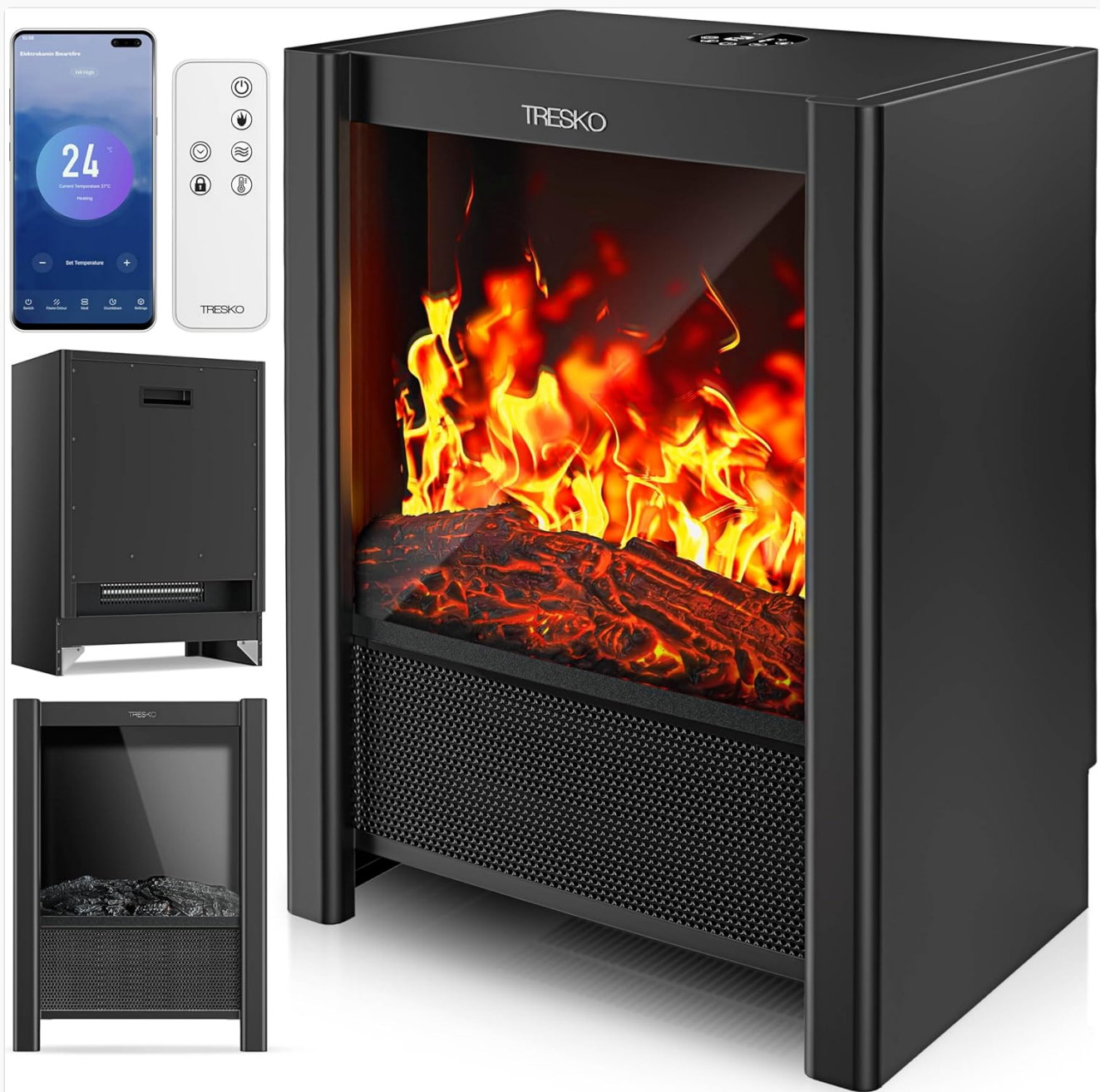
Image: The TRESKO Electric Fireplace, showcasing its main unit, remote control, and a smartphone screen displaying the SmartLife app interface. The fireplace features a realistic LED flame effect.

Familiarize yourself with the main parts of your electric fireplace.