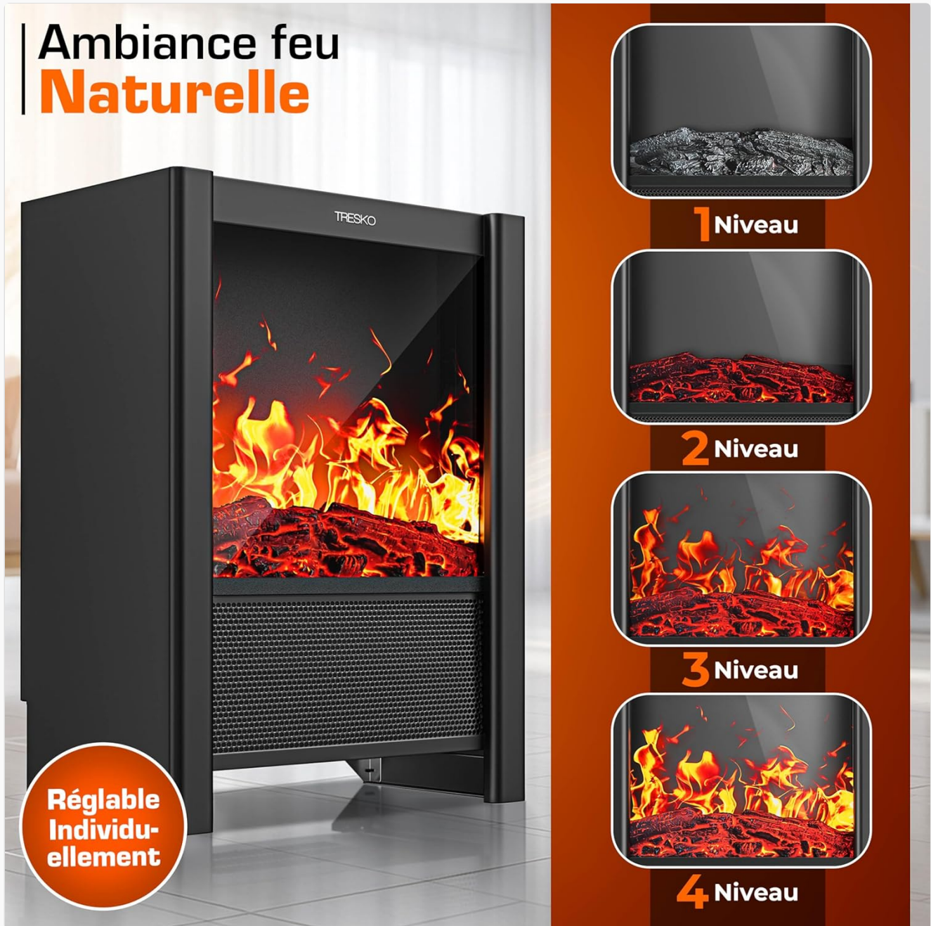
Image: A visual representation of the TRESKO Electric Fireplace's LED flame effect, demonstrating four distinct levels of intensity, from a subtle glow to a vibrant, full flame.

The realistic LED flame effect can be operated independently of the heating function.