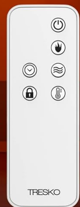
Image: Technical dimensions of the TRESKO Electric Fireplace, showing a height of 56cm, width of 38cm, and depth of 26cm. It also indicates 2000 Watts power, 240 Volts tension, and 11.5 Kilograms weight, along with the included remote control.