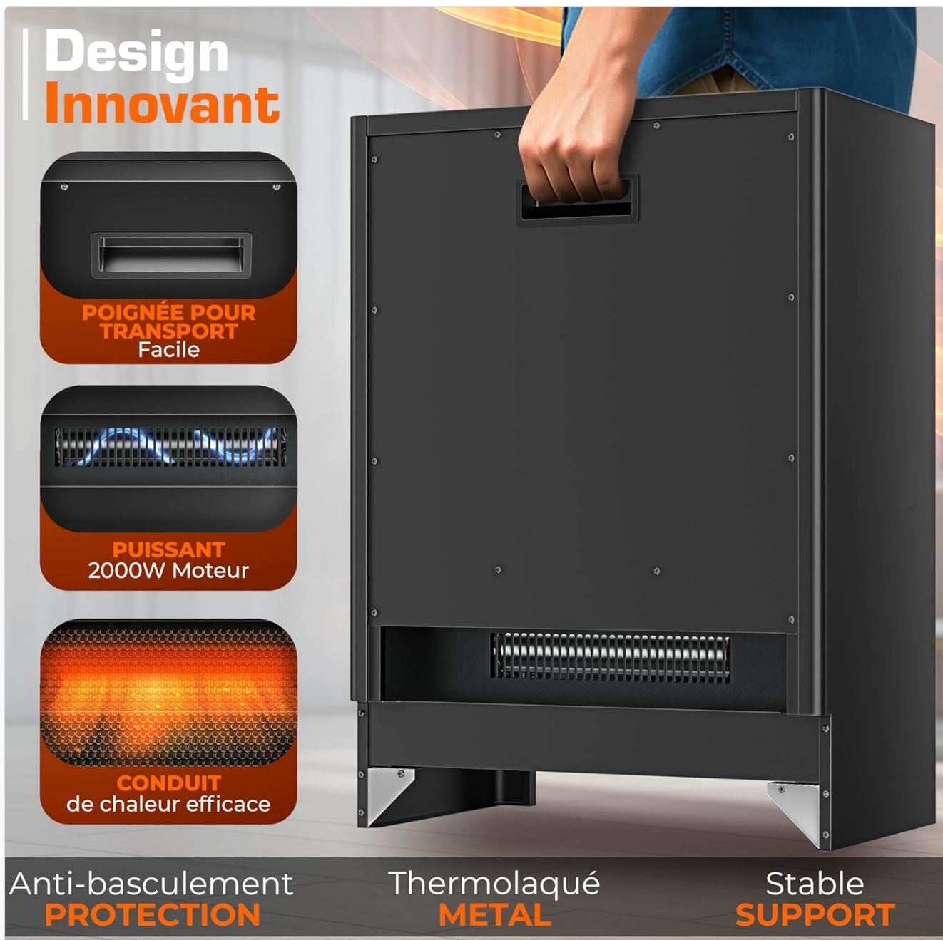
Image: An illustration of the TRESKO Electric Fireplace's innovative design, highlighting its easy transport handle, powerful 2000W motor, efficient heat duct, anti-tip protection, durable metal construction, and stable support base.