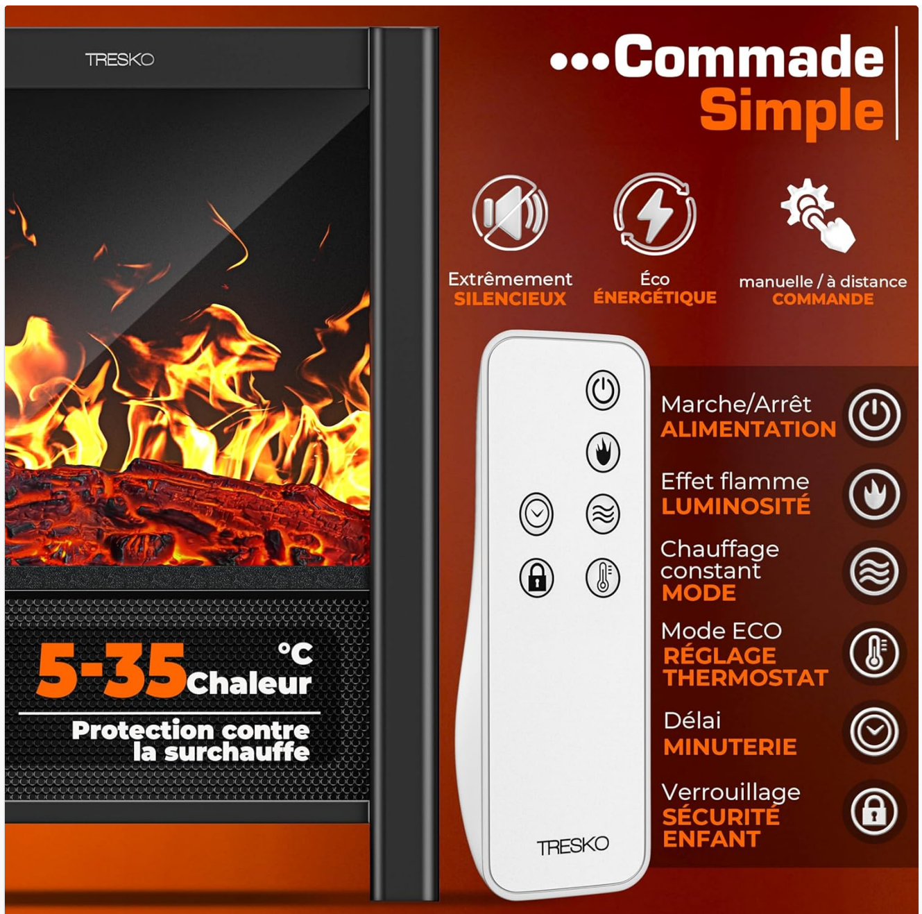
Image: A detailed view of the remote control for the TRESKO Electric Fireplace, highlighting buttons for power, flame effect luminosity, constant heating mode, ECO mode, thermostat adjustment, timer delay, and child safety lock.