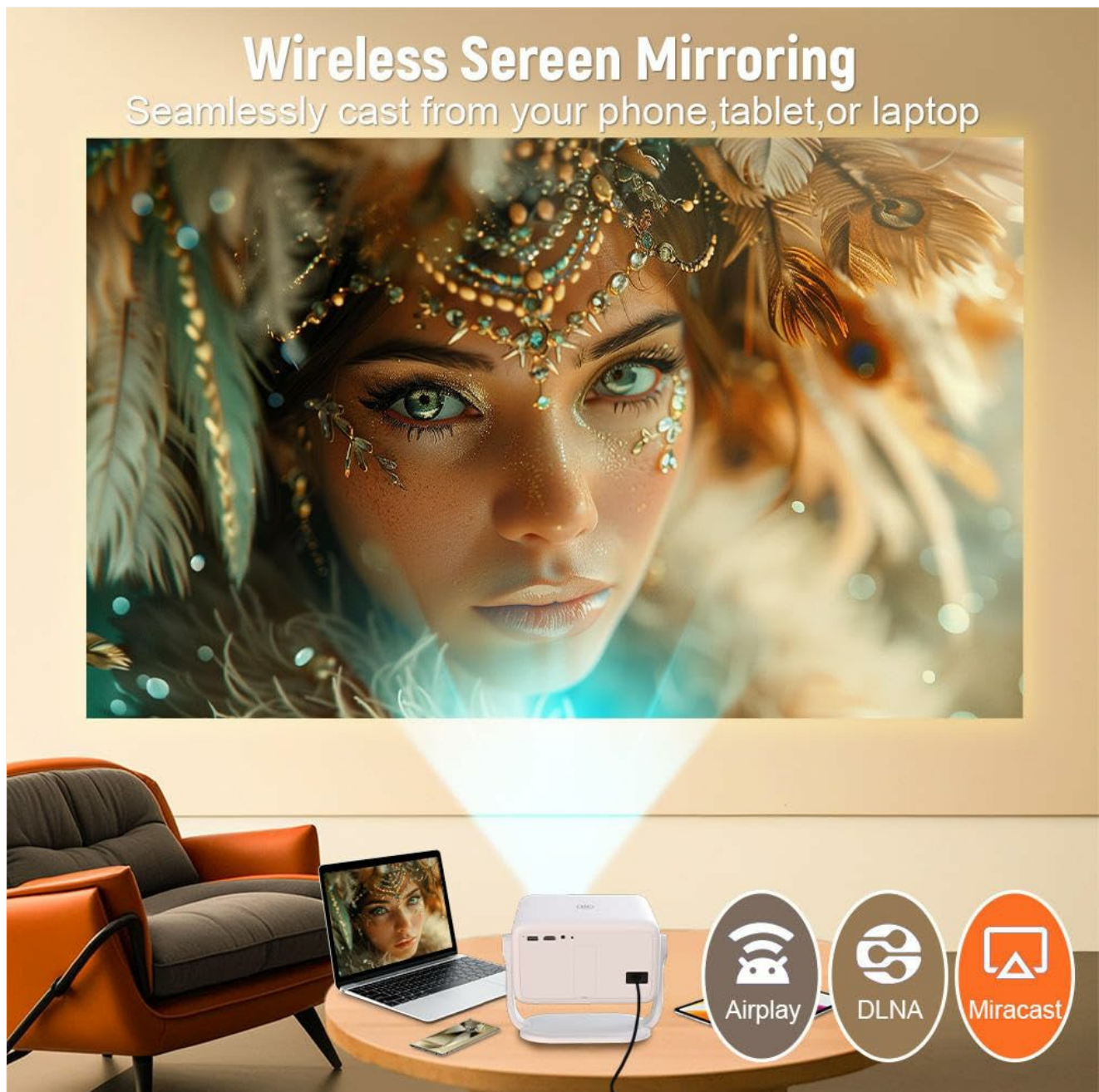
Image 4: The Wireless Screen Mirroring function, illustrating how to seamlessly cast content from phones, tablets, or laptops using

The projector includes HDMI and USB ports for connecting external devices such as laptops, gaming consoles, media players, or USB drives. Simply plug in your device and select the corresponding input source from the projector's input menu.