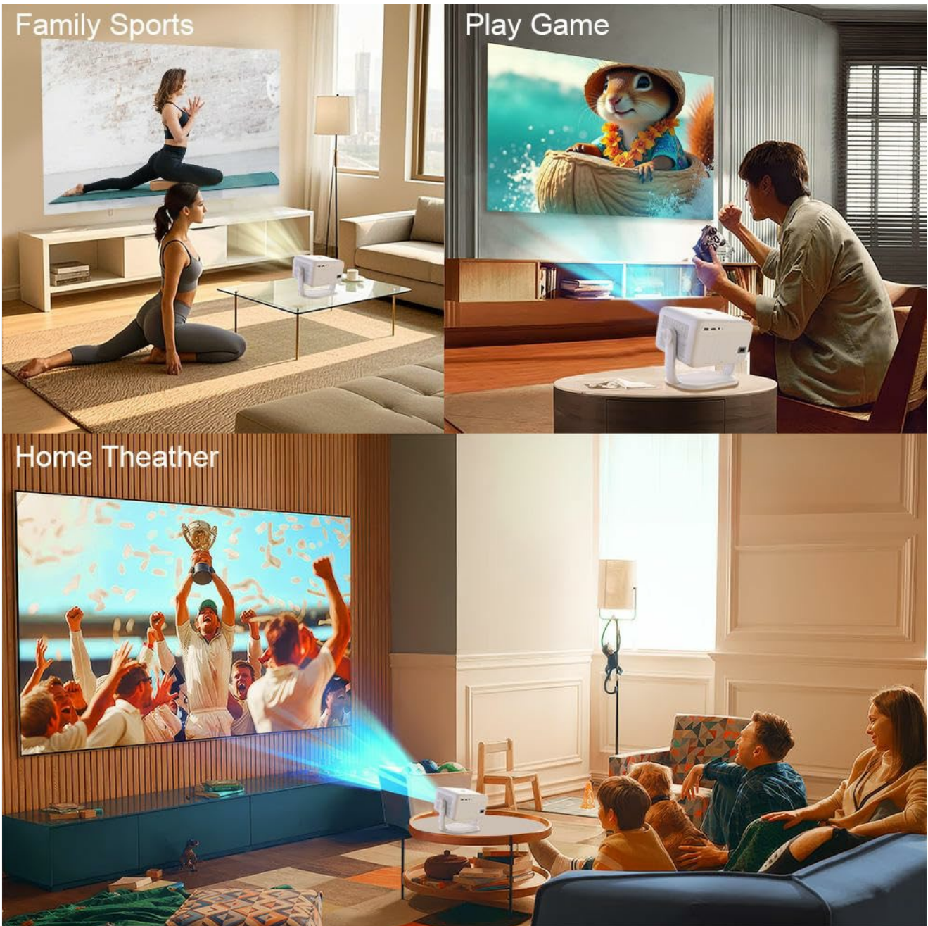
Image 3: Examples of the TP350 NTV Smart Projector in different settings, such as for family sports, gaming, and creating a home theater experience.