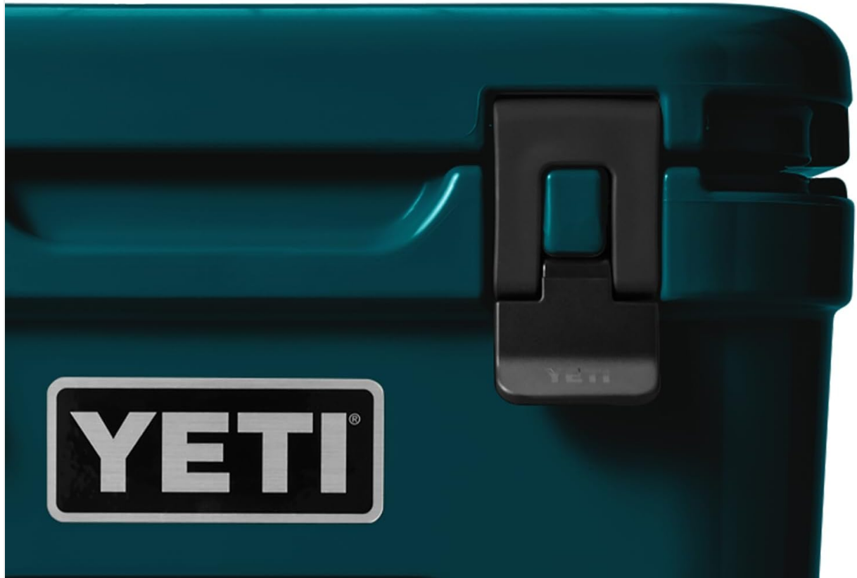
Image: A close-up view of the HeftyHauler Handle, designed for comfortable and secure carrying.

Flexible, simple, and built for quick, one-handed cooler access.