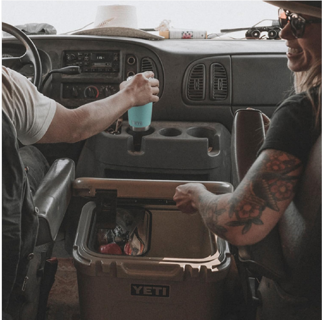
Image: The YETI Roadie 24 Cooler positioned neatly behind a car seat, highlighting its space-saving design for travel.

Utilize the HeftyHauler Handle for comfortable and balanced transport. The handle is designed to support the cooler's weight, even when full. For vehicle transport, the slim design allows it to fit behind most driver's or passenger's seats.