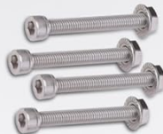
Stainless Steel Bolts