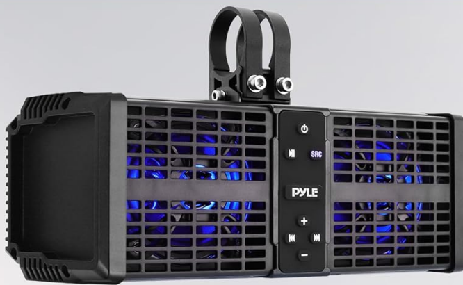
11" Powered Soundbar