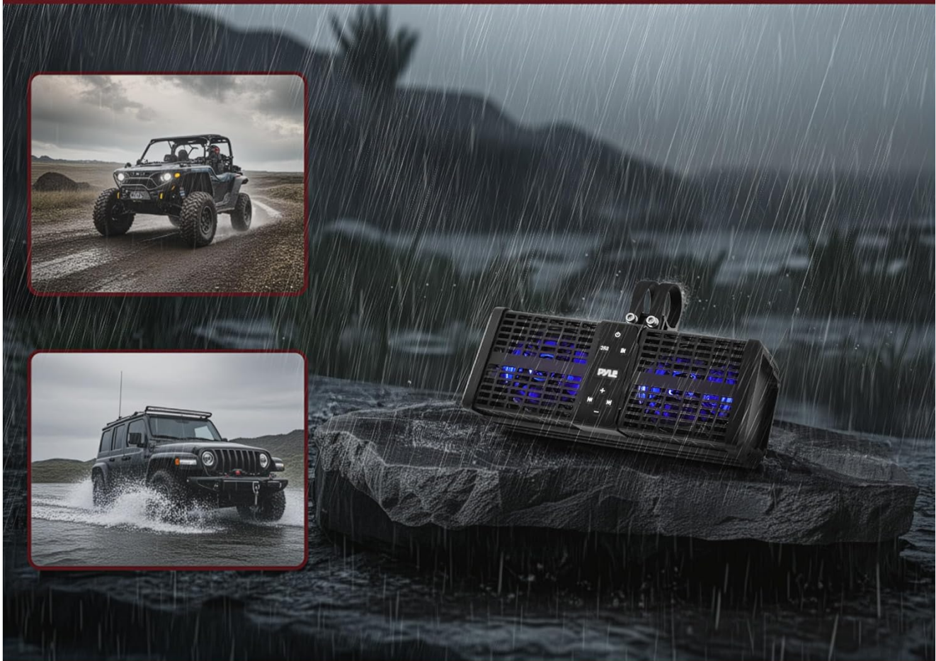
Image: The Pyle ATV/UTV Sound Bar shown in a rainy environment, illustrating its IPX6 waterproofing and suitability for all-weather conditions, ideal for ATV, UTV, 4x4, Jeep, and marine watercraft use.

Ideal for ATV, UTV, 4x4, jeep, marine watercraft