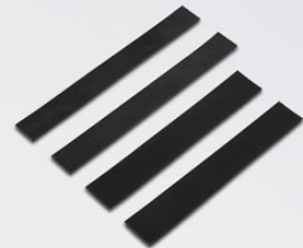
Non-slip Rubber Pad