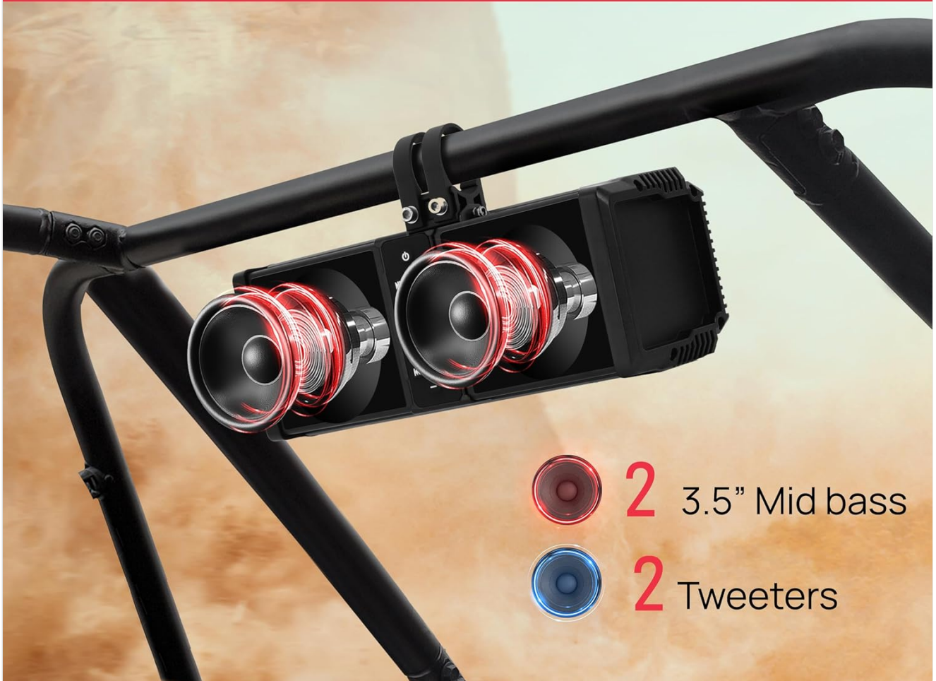
Image: The Pyle 11-inch ATV/UTV Sound Bar highlighting its 80 Watts Max Power, featuring two 3.5-inch mid-bass drivers and two tweeters for a 2-way speaker system.