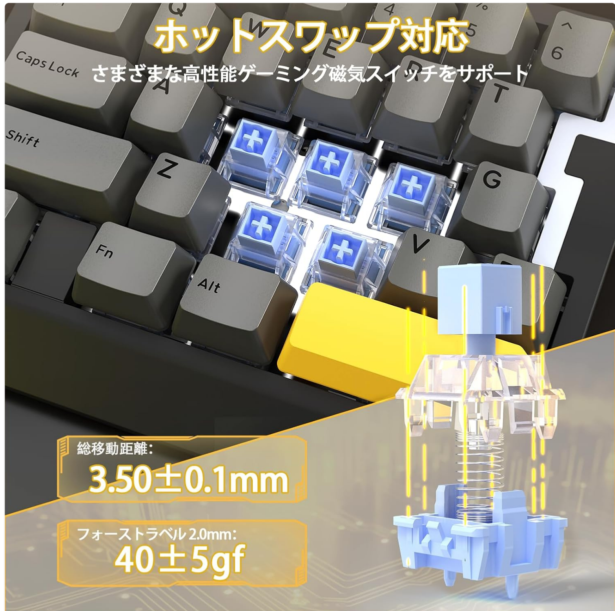
Image: Close-up view of the hot-swappable magnetic switches, showing the mechanism and keycap removal tool.

The AK029 supports hot-swappable magnetic switches, allowing for easy replacement and customization.