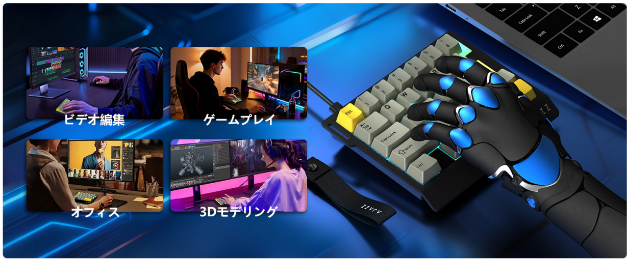
Image: The AK029 keyboard being used in various scenarios, including gaming, video editing, and 3D modeling, demonstrating its versatility.