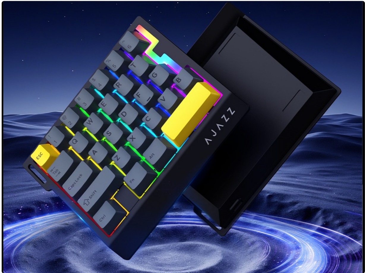
Image: Illustration of the ergonomic design of the AK029, featuring stepped keycaps and a wrist rest for comfortable long-term use.