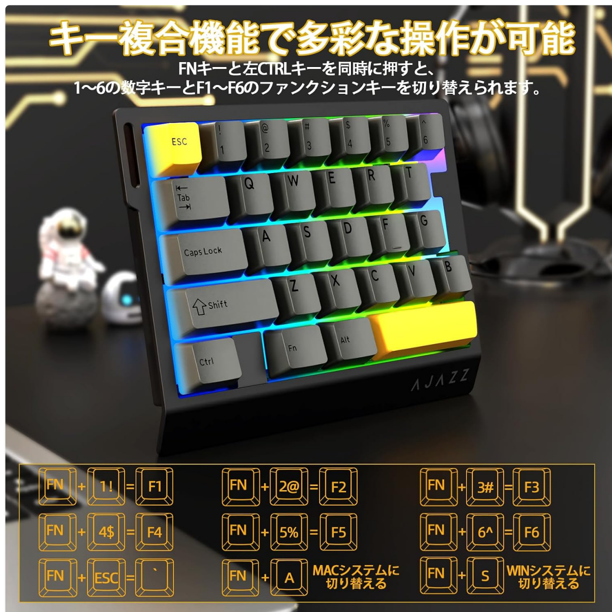
Image: Diagram illustrating the various FN key combinations for accessing secondary functions, such as F1-F6, tilde, and system switching.

The AK029 features a 29-key layout optimized for gaming and productivity. Many keys have secondary functions accessible via the Fn key.