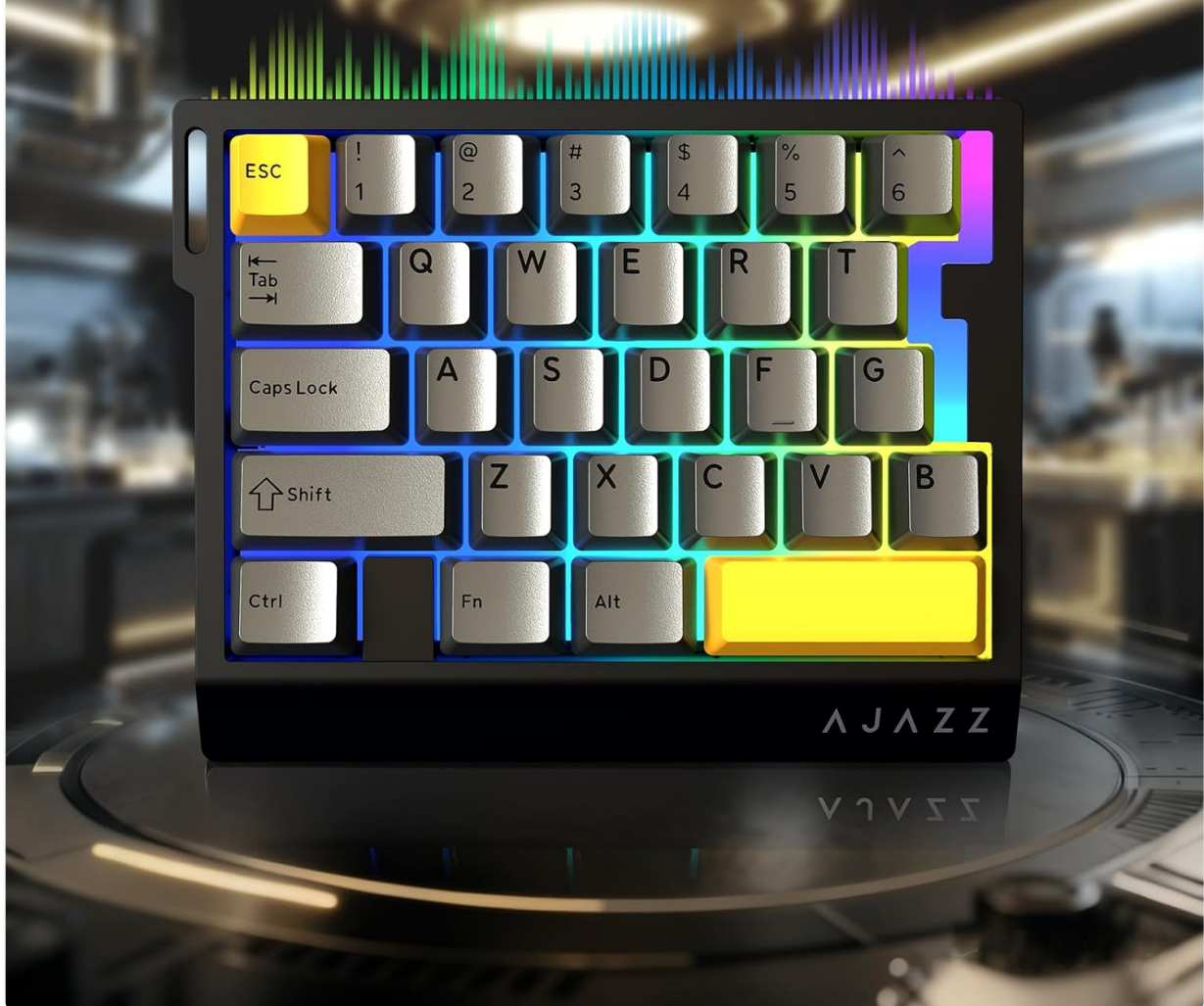
Image: The keyboard displaying its colorful RGB backlight, which can be customized with various effects.