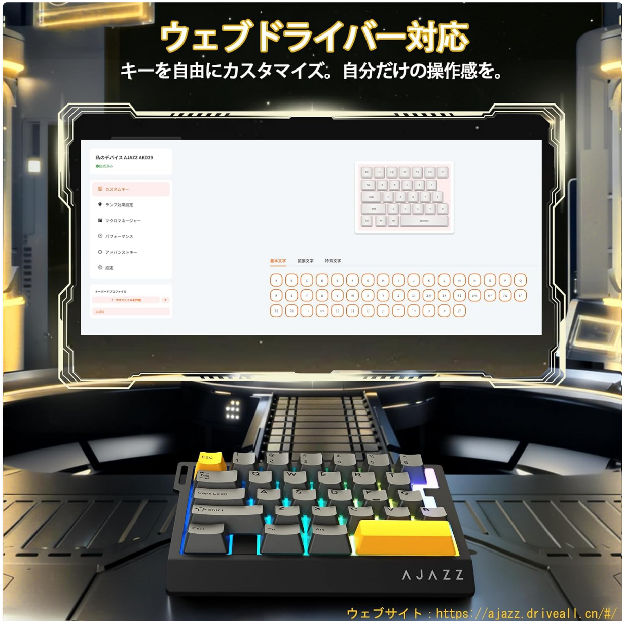
Image: Screenshot of the web driver interface, showing options for custom keys, lighting effects, macro management, and performance settings.

The dedicated driver software allows for extensive customization of key functions, macros, and RGB lighting effects. This enables true personalization to match individual playstyles and preferences.