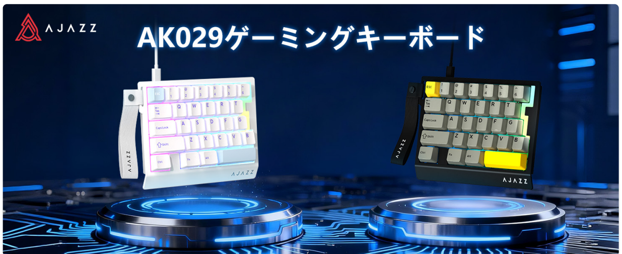
Image: An overview of the AK029 gaming keyboard, highlighting its sleek design and gaming features.