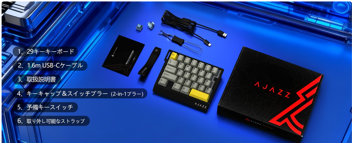
Image: The complete package contents of the AJAZZ AK029, including the keyboard, USB-C cable, keycap puller, spare switches, and user manual.