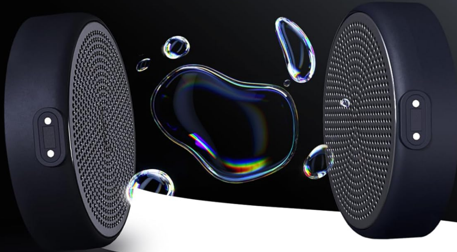
Image: Close-up of Origem Ski Helmet Speakers highlighting HDR Audio and 40mm drivers.

Optimises for the nature audio while brings you accurate sound