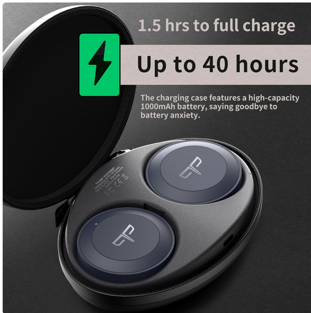
Image: The charging case with speakers inside, indicating 1.5 hours to full charge and up to 40 hours total battery life.