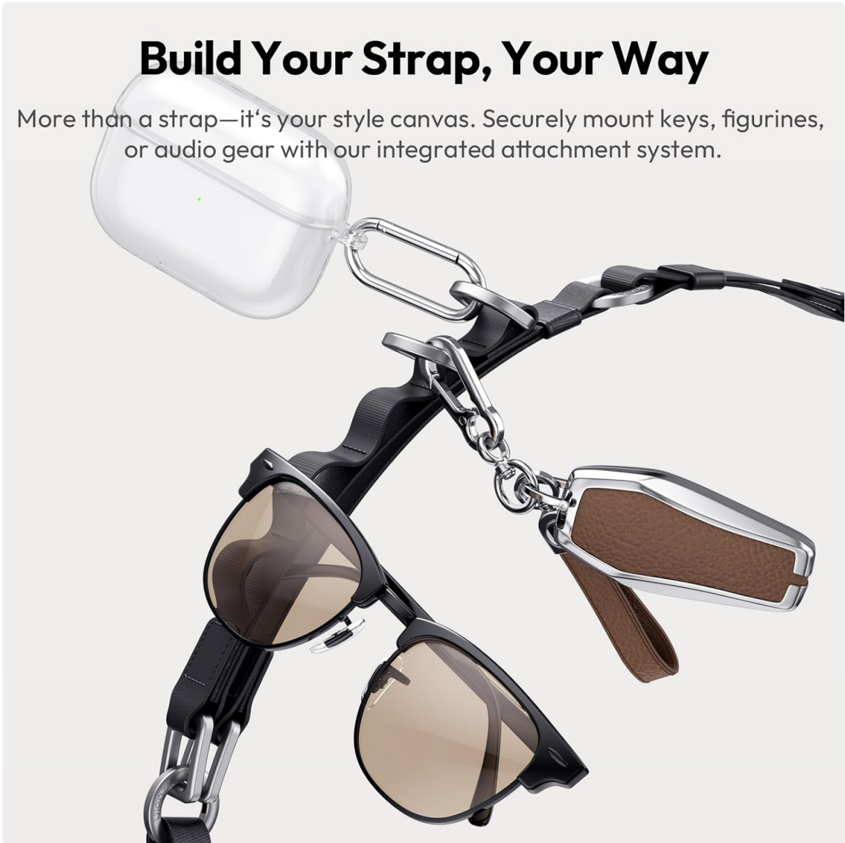
Figure 7: The integrated attachment system allows for securely mounting small accessories like keys, figurines, or audio gear.

More than a strap—it's your style canvas. Securely mount keys, figurines, or audio gear with our integrated attachment system.