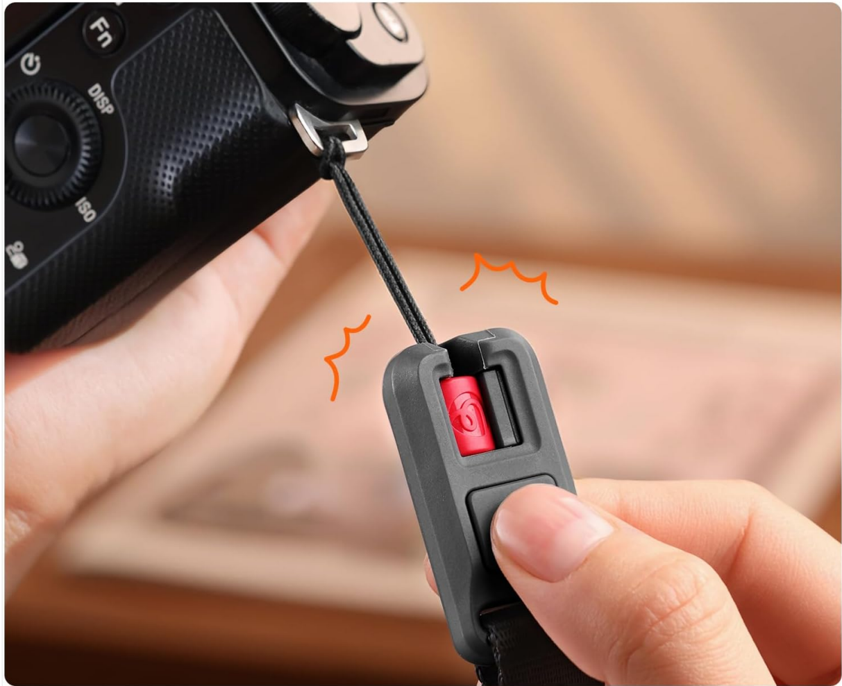
Figure 3: The quick-release connectors allow for instant attachment and detachment of the strap.

Features quick-release connectors that securely detach in one second—no fumbling, no hassle.