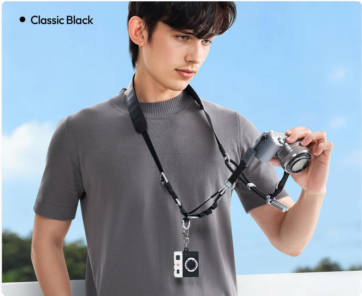
Figure 1: The ULANZI YF01 strap in Classic Black, worn as a shoulder strap with a camera.