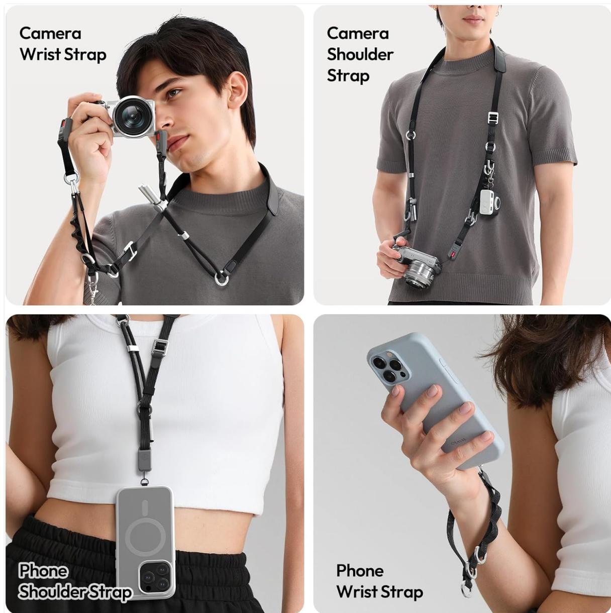
Figure 4: Various ways to use the YF01 strap: as a camera wrist strap, camera shoulder strap, phone shoulder strap, and phone wrist strap.