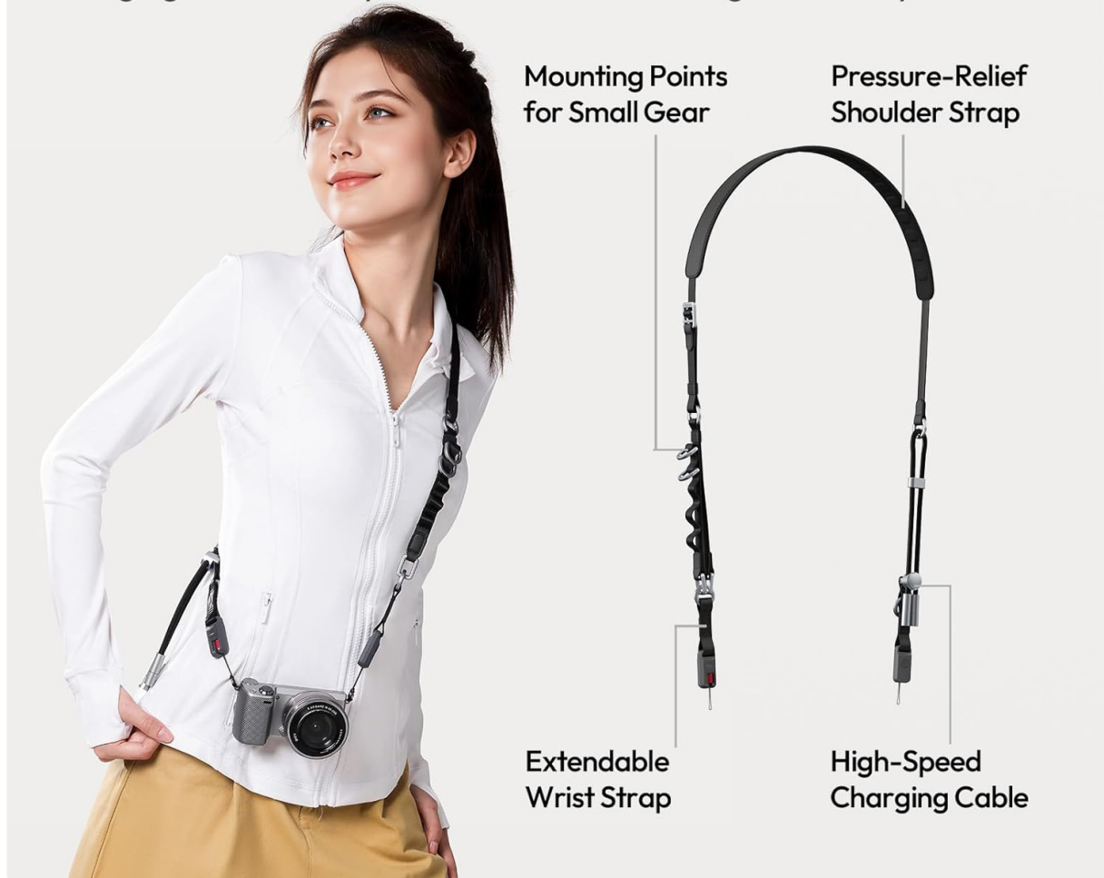
Figure 2: Modular design components of the YF01 strap, including the pressure-relief shoulder strap, extendable wrist strap, high-speed charging cable, and mounting points for small gear.

A modular 3-in-1 system combining shoulder strap, wrist strap, and charging cable – freely detachable and reconfigurable for your needs.