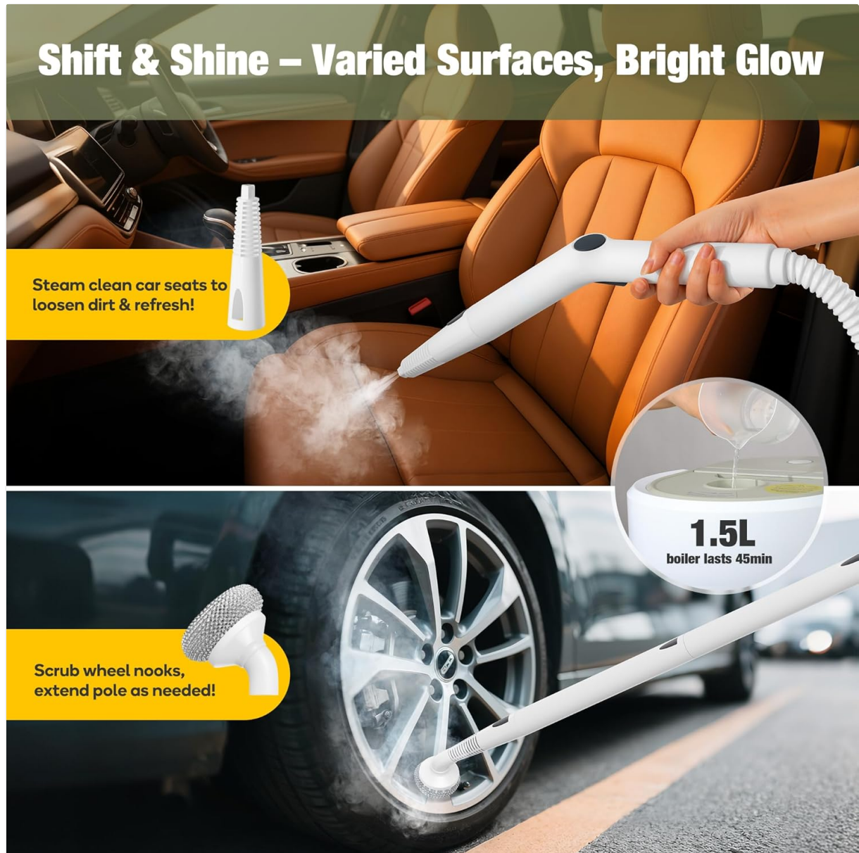
Image: The steam cleaner can be used to clean car seats to loosen dirt and refresh, and to scrub wheel nooks with an extended pole.