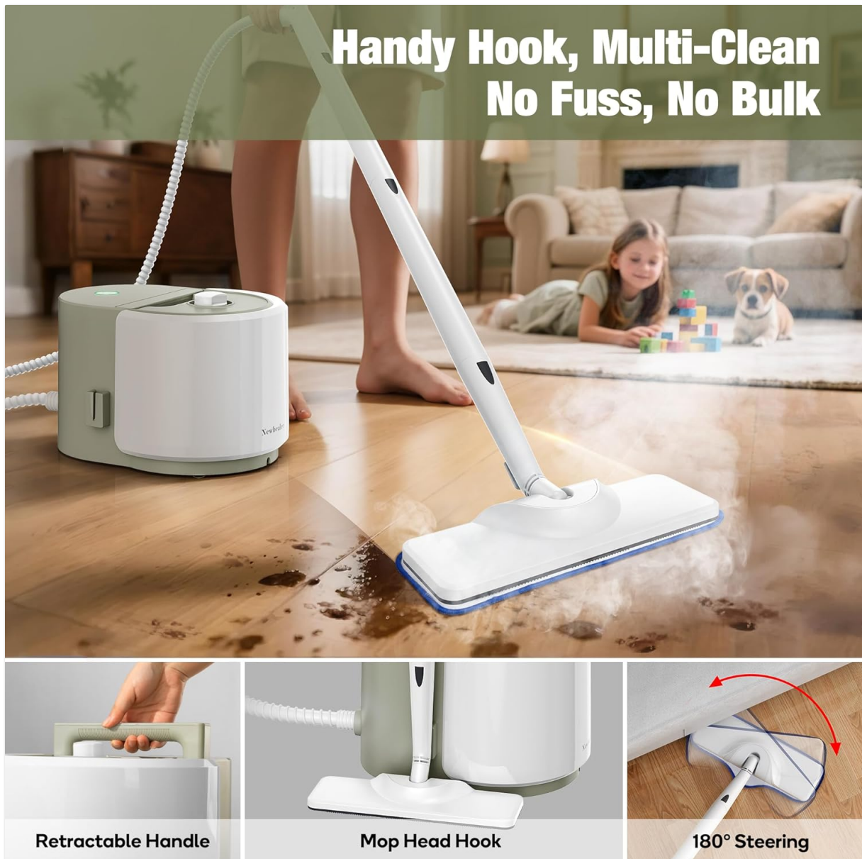
Image: The steam cleaner features a retractable handle and a mop head hook for convenient storage and multi-surface