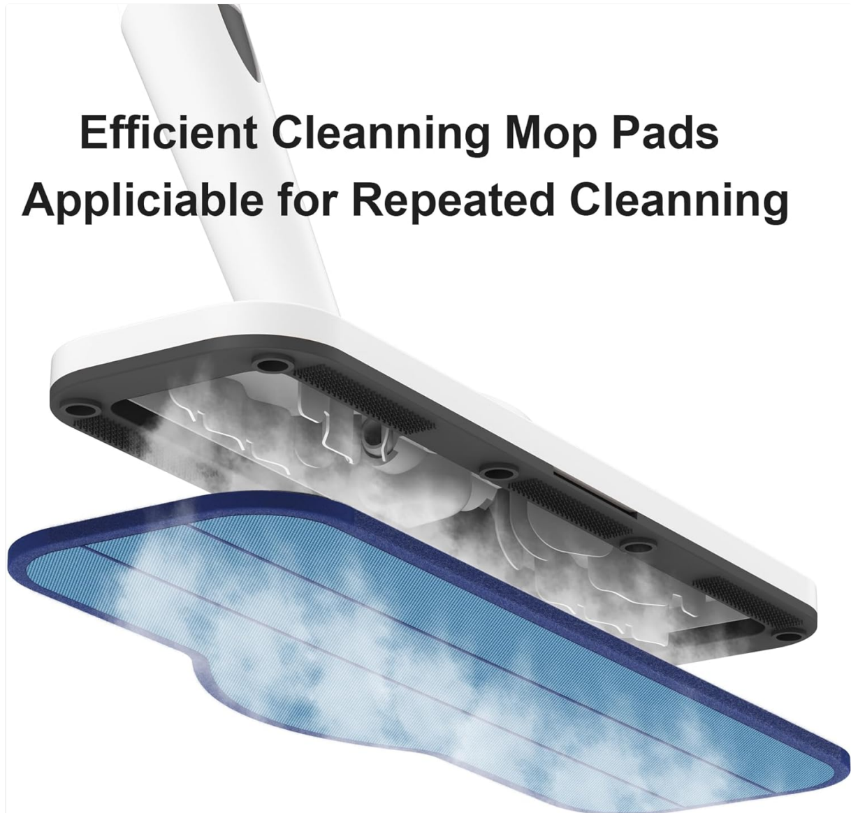
Image: The efficient cleaning mop pads feature a sandwich mesh lining that allows steam to release easily for effective cleaning.