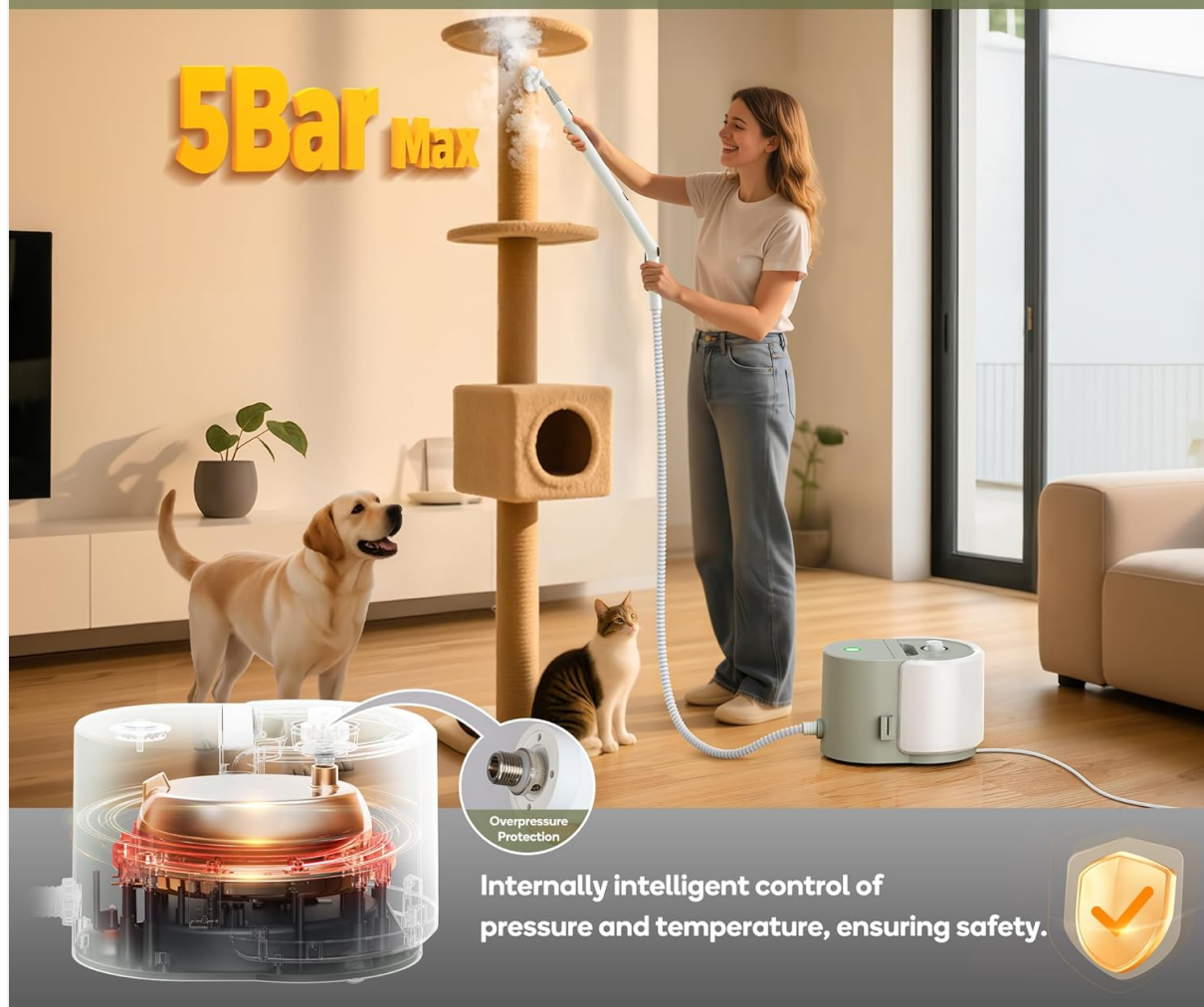
Image: The Newbealer Steam Cleaner is designed with internal intelligent control of pressure and temperature, ensuring safety for use around children and pets.