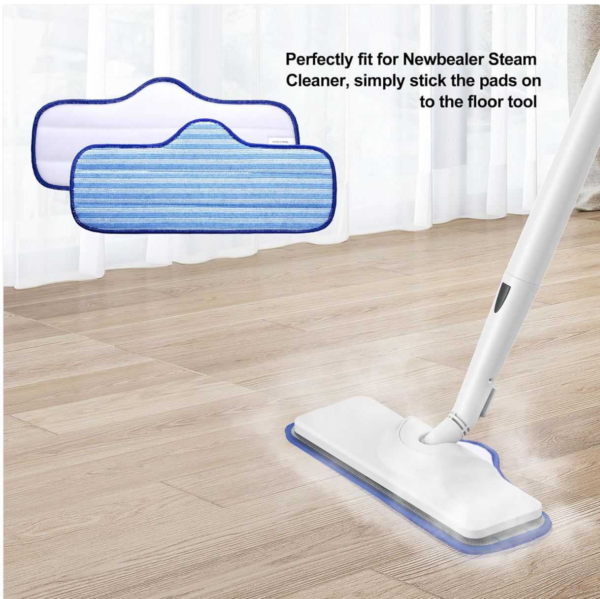
Image: The microfiber pads are designed to perfectly fit the Newbealer Steam Cleaner's floor tool for easy attachment.