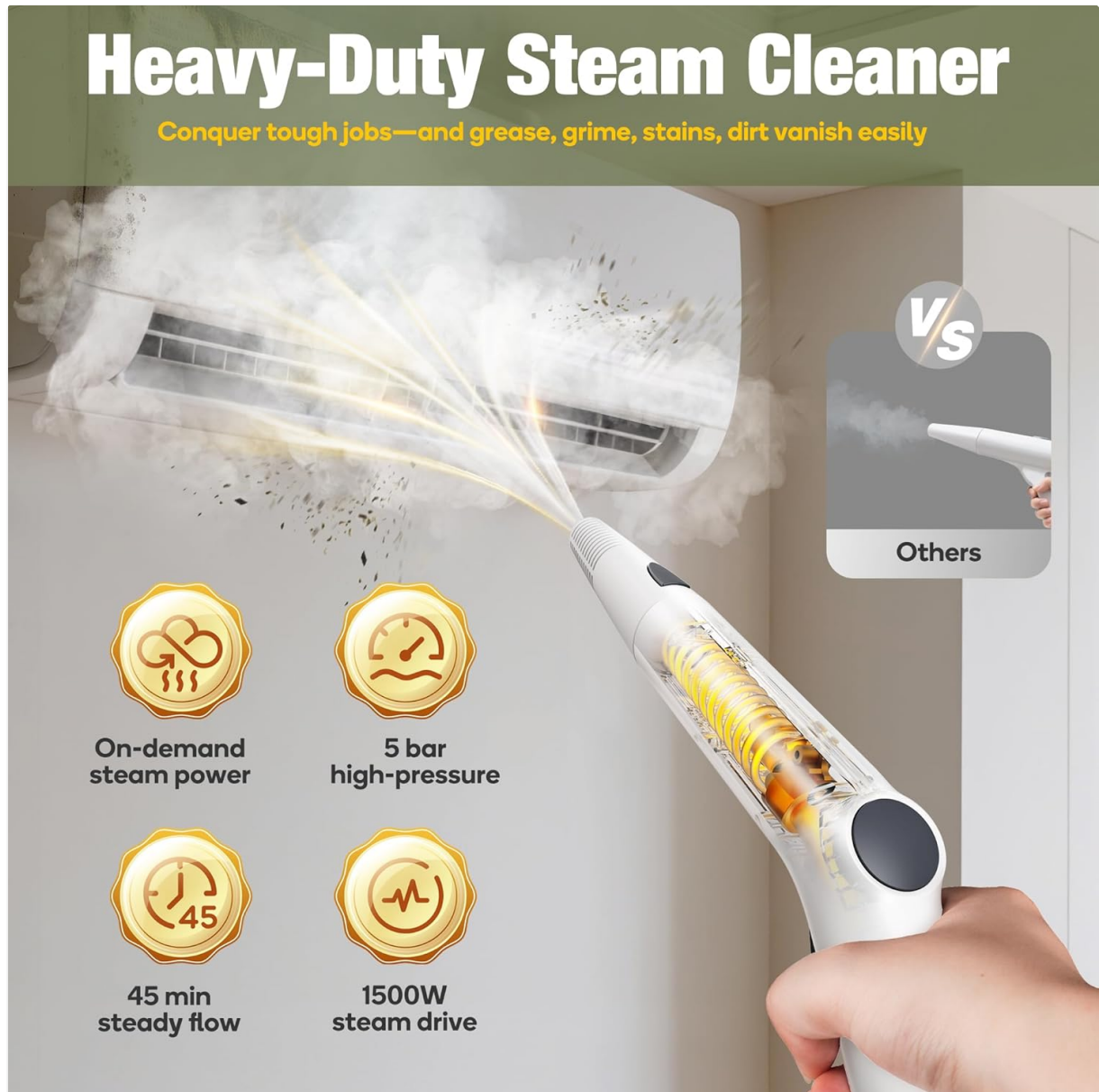
Image: Key features of the Newbealer Heavy-Duty Steam Cleaner include on-demand steam power, 5 bar high-pressure, 45 minutes of steady flow, and a 1500W steam drive.