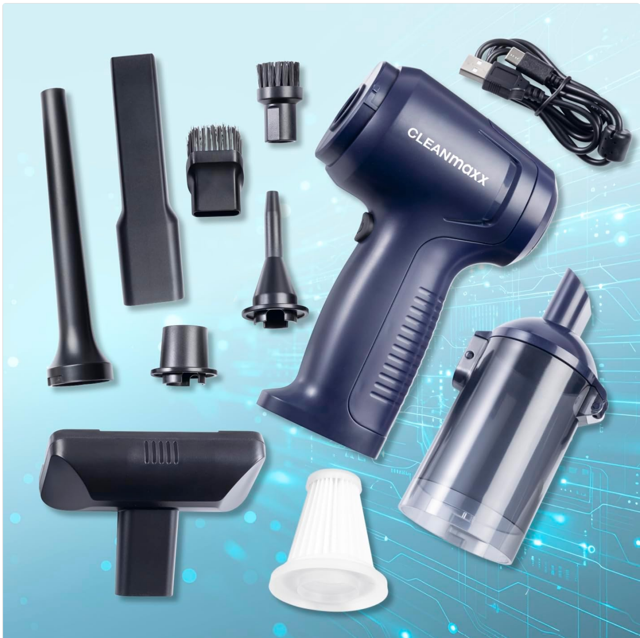
Image 3.1: All components included with the CLEANmaxx 2-in-1 Cordless Handheld Vacuum.