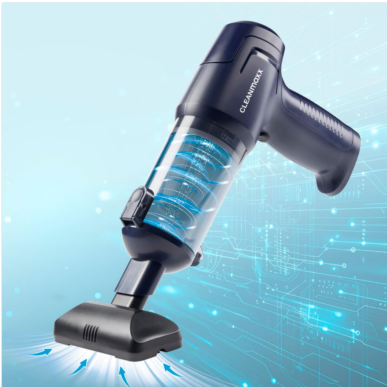
Image 6.1: Using the vacuum function with a floor brush attachment.