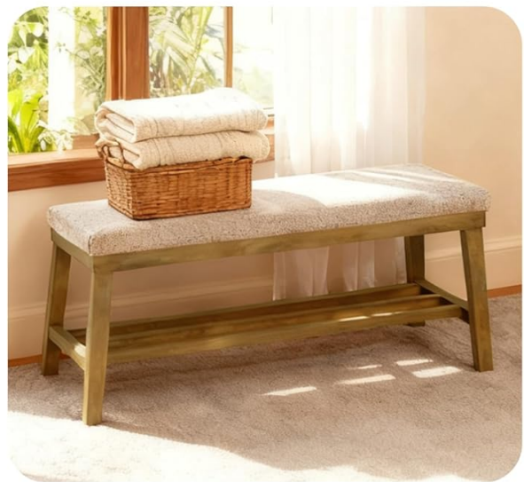
Under the Window

Image: The bench shown in various applications: entryway, living room, end of bed, and under a window, illustrating its versatility.