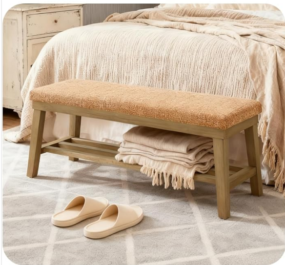
End of Bed