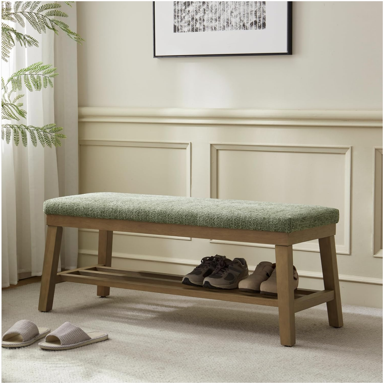
Image: The VKNOW 44.4 inch Upholstered Entryway Bench in green, showcasing its design and comfortable seating.