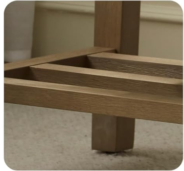
Wide Shoe Rack

Image: Detailed view of the upholstered bench top, rubberwood legs, and wide shoe rack, highlighting key product features.