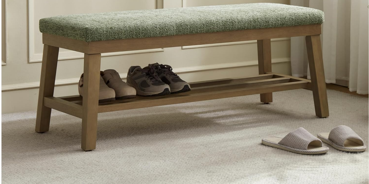
Image: The bench in an entryway setting, demonstrating its comfortable seating with thick foam padding and practical design.