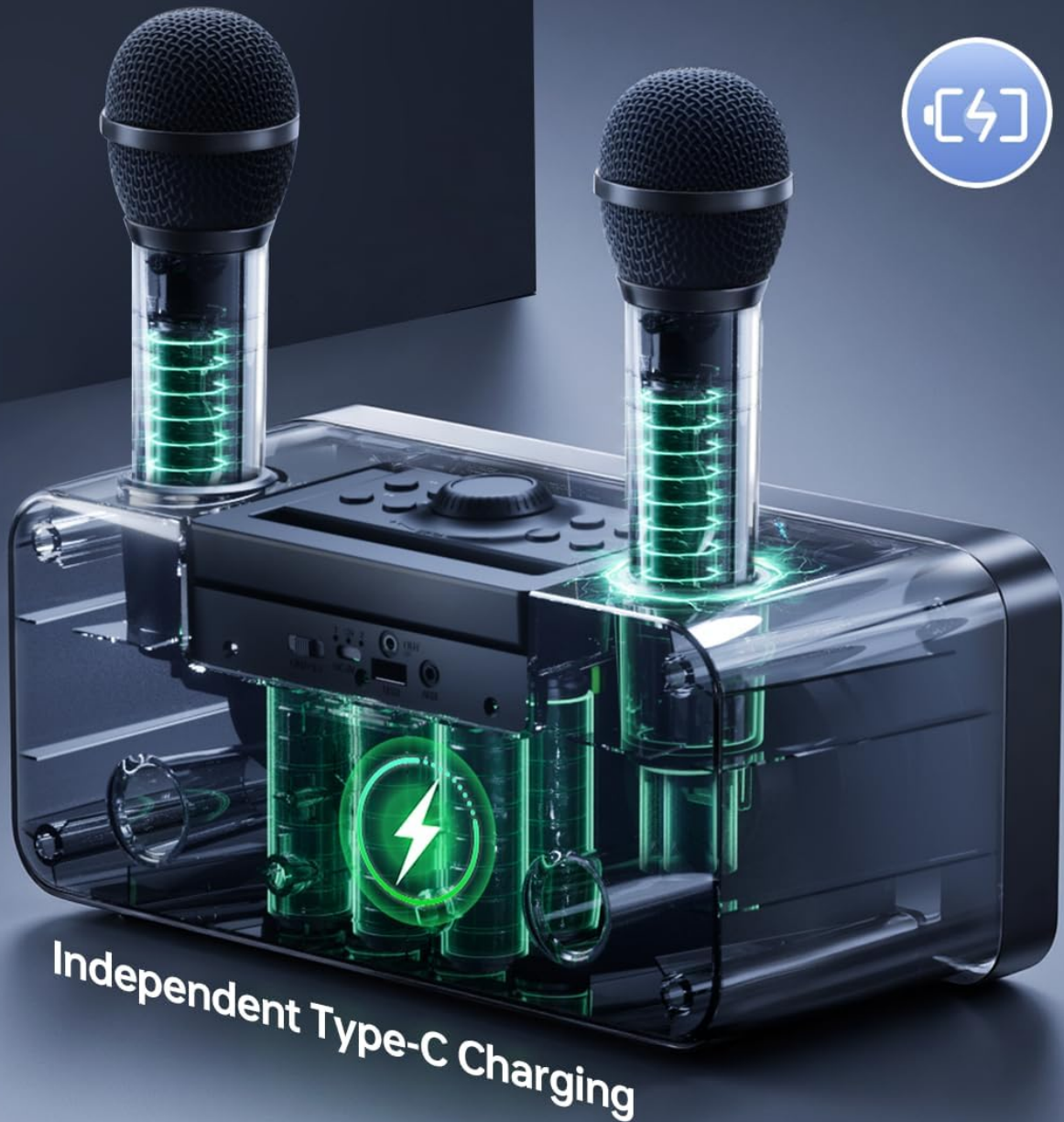
Image: Front view of the SDRD 217 Karaoke Machine, showing the speakers and control panel.