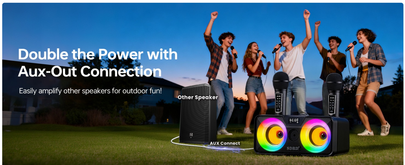
Image: The SDRD 217 Karaoke Machine in an outdoor setting, demonstrating its portability and use for entertainment.

Thank you for purchasing the SDRD 217 Bluetooth Karaoke Machine. This manual provides detailed instructions for safe operation, setup, and maintenance of your device. Please read this manual thoroughly before use and retain it for future reference.