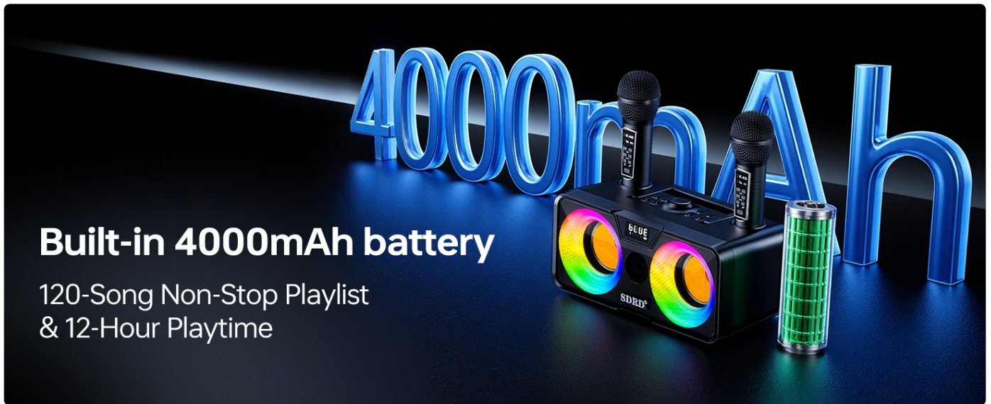
Image: The SDRD 217 Karaoke Machine, two wireless microphones, and included cables, illustrating the complete package contents.