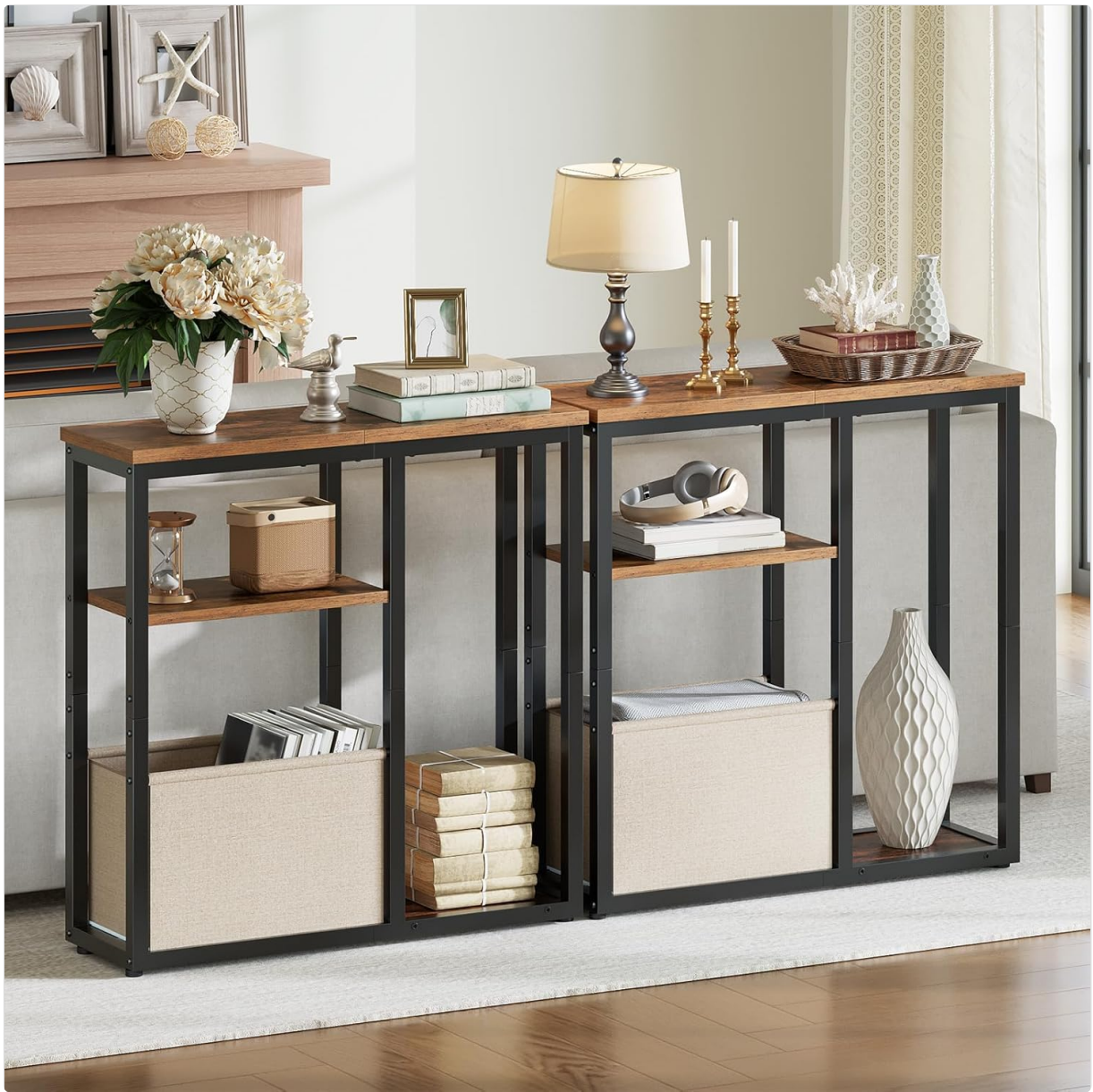
Image: Two console tables used together as a longer sofa table, showcasing their modular potential and rustic industrial style.