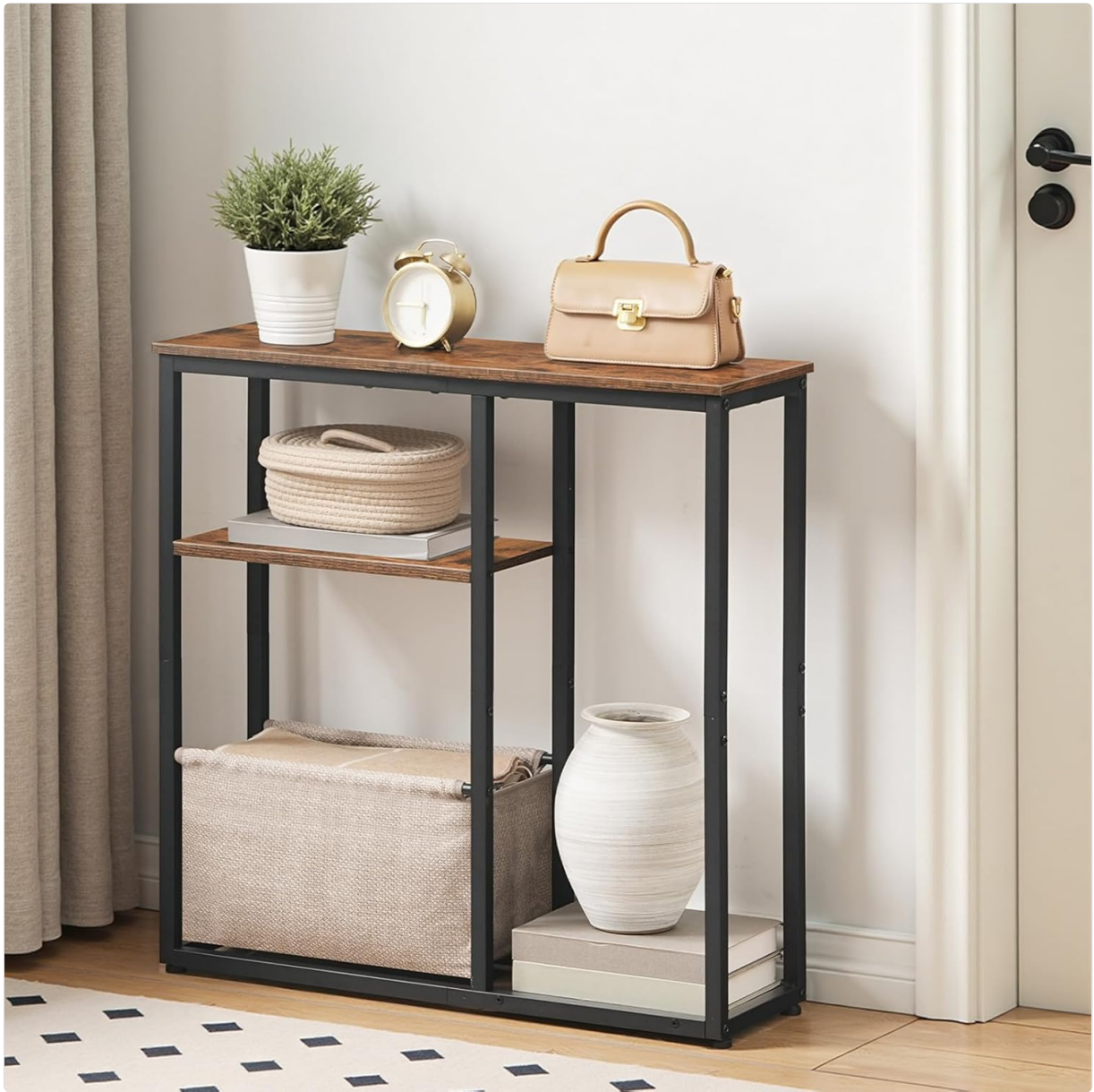
Image: The HOOBRO BF60XG01 Narrow Console Table, showcasing its rustic brown top, black metal frame, and three-tier storage with a beige storage basket.