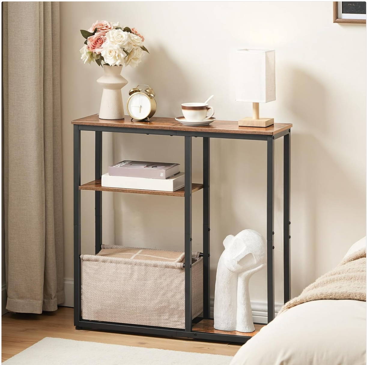
Image: The console table serving as a bedside table, demonstrating its adaptability to different room types.