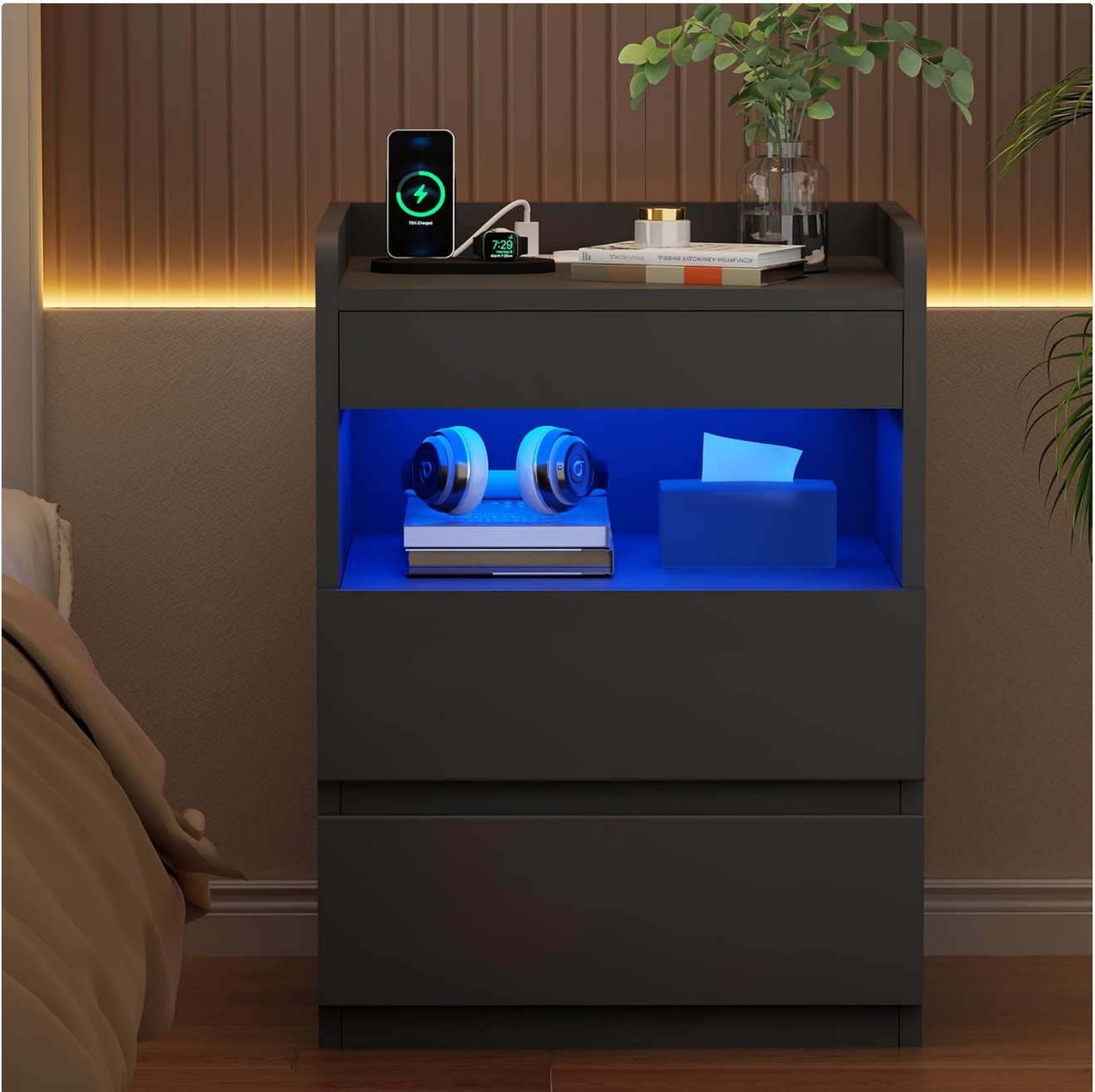
Image 5.1: Integrated charging panel with AC outlets and USB ports.