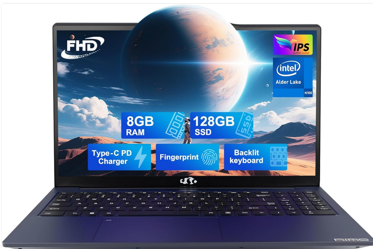
Figure 1: NIMO 15.6" FHD Laptop Overview

Welcome to the NIMO 15.6" FHD Laptop user manual. This document provides essential information for setting up, operating, and maintaining your new device. Your NIMO laptop (Model N151) is designed for everyday computing tasks, offering a blend of performance and convenience for students, home users, and professionals. Key features include a vibrant 15.6" Full HD IPS anti-glare display, an Intel Pentium Quad Core N100 processor, 8GB of DDR4 RAM (upgradable), a fast 128GB PCIe SSD (upgradable), a backlit keyboard with fingerprint reader, and comprehensive connectivity options including Wi-Fi 6 and Bluetooth 5.2. It comes pre-installed with Windows 11 Home.