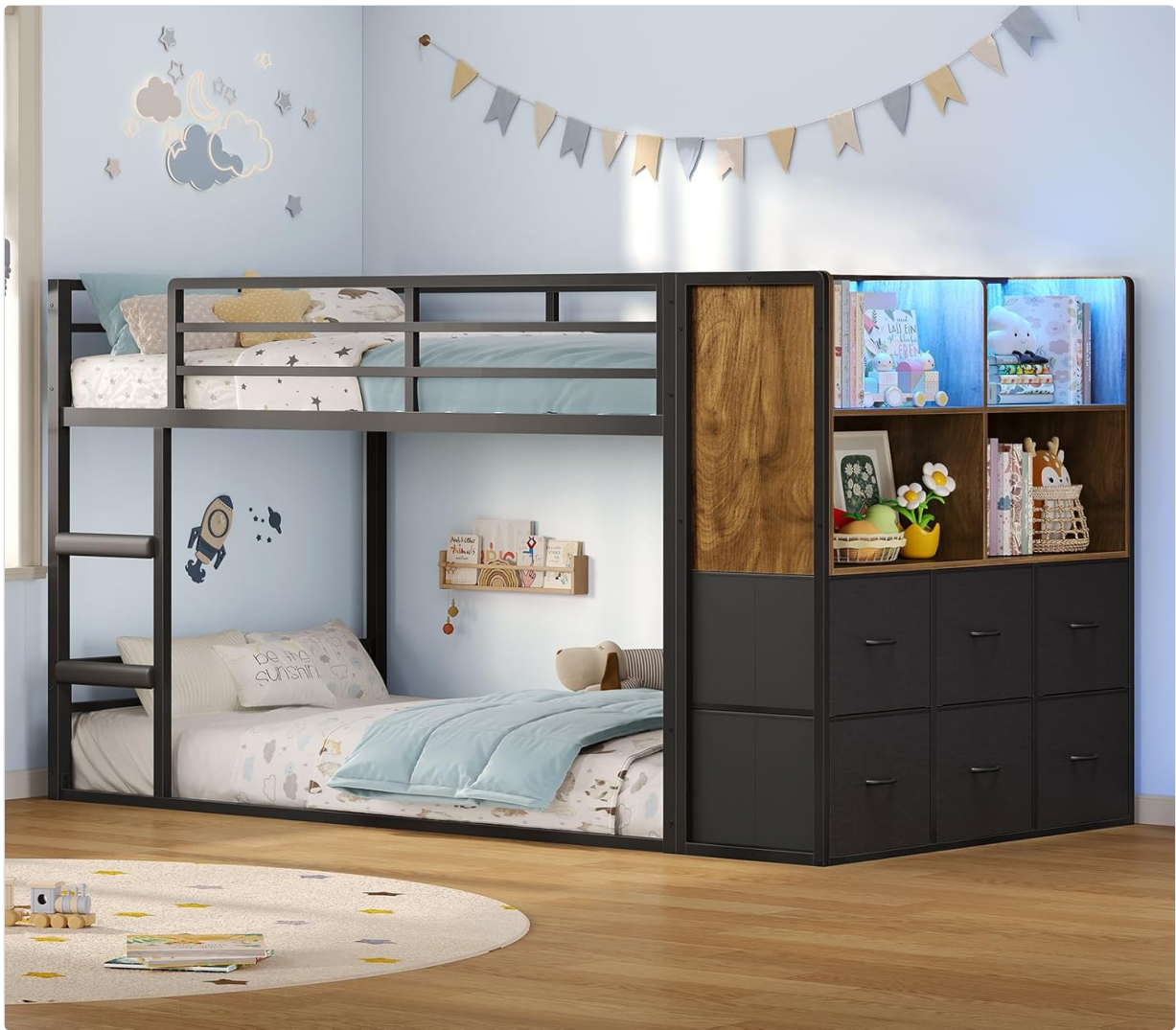
A complete view of the BTHFST Twin Over Twin Bunk Bed, highlighting its space-saving design with integrated storage and LED lighting.