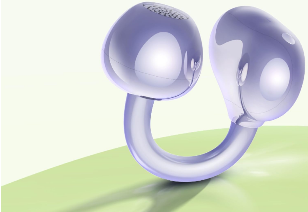
Image: Diagram highlighting the Titanium Alloy Arch Design of the earbuds, emphasizing comfort and aesthetics.

Combining Aesthetics & Comfortable Wear in One