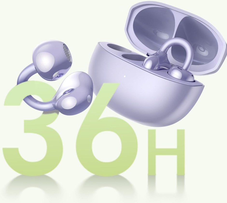
Image: Graphic illustrating the 36-hour extended battery life of the earbuds with their charging case.