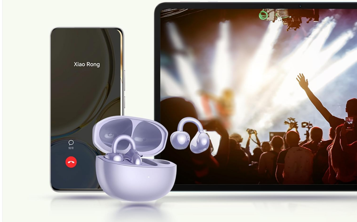
Image: Illustration showing the earbuds connected to both a smartphone and a tablet, demonstrating the dual device connection feature with automatic switching.