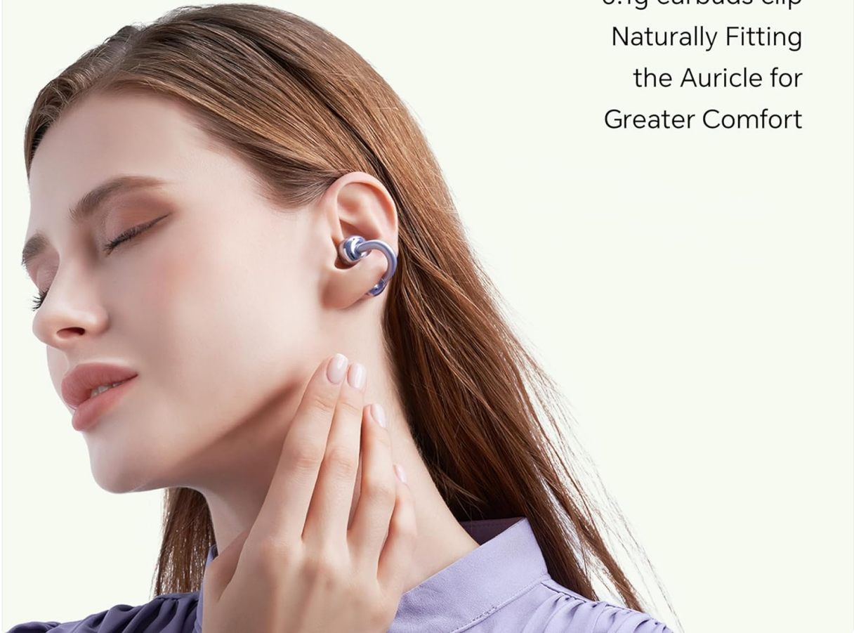
Image: A woman demonstrating the proper way to wear the HONOR Choice Earbuds Clip, highlighting its open clip design and natural fit.

5.1g earbuds clip Naturally Fitting the Auricle for Greater Comfort