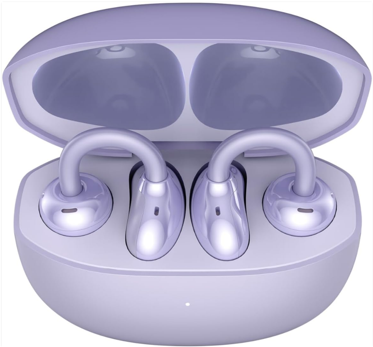
Image: The HONOR Choice Earbuds Clip, showing both earbuds inside their open charging case.