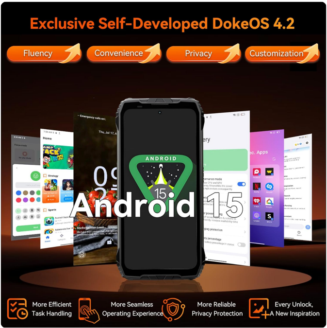
Text Description: The Blackview XPLORE 2 phone screen showing the DokeOS 4.2 user interface with various app icons and widgets, indicating it runs on Android 15.

Capture stunning photos and videos with the versatile camera system: