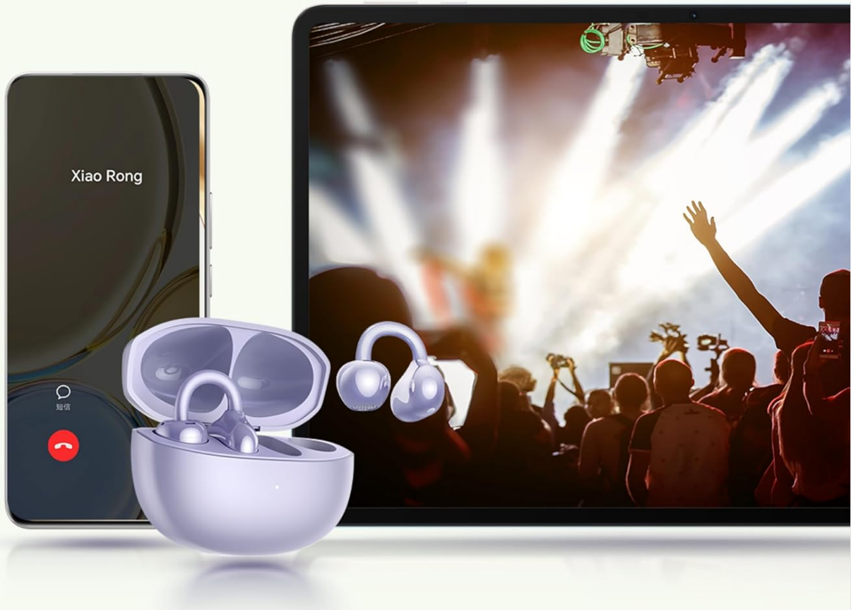
Figure 4.1: Dual Device Connection Capability