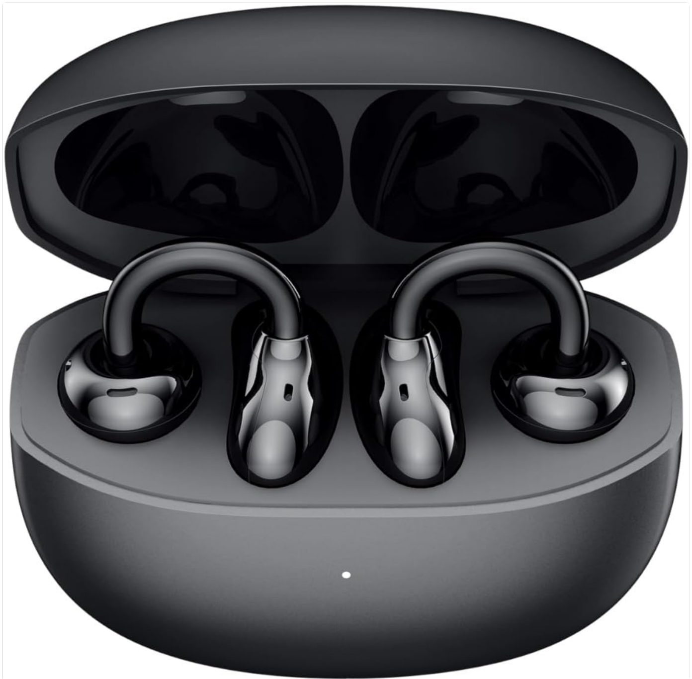
Figure 1.1: HONOR Choice Earbuds Clip and Charging Case (Front View)