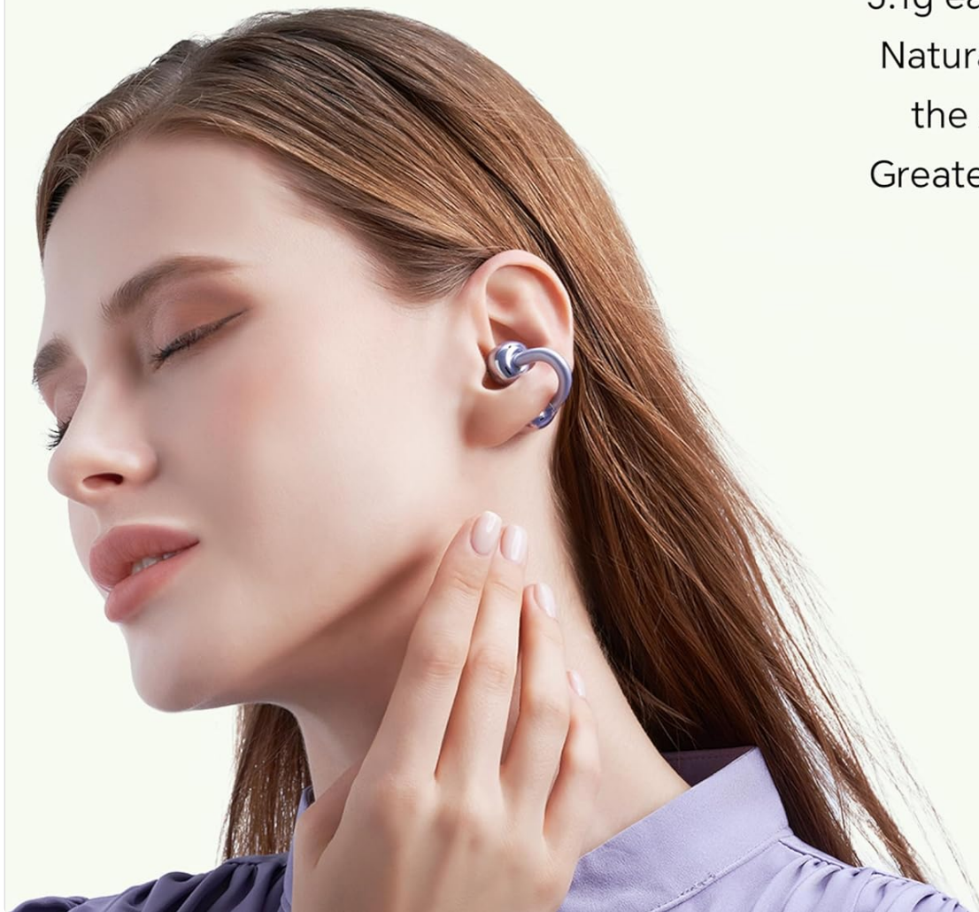
Figure 3.2: Open Clip Design for Comfortable Fit

5.1g earbuds clip Naturally Fitting the Auricle for Greater Comfort