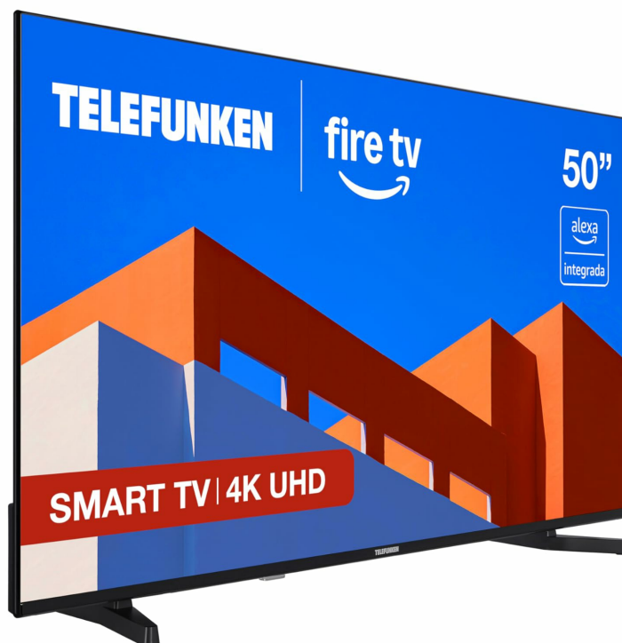
Image: Front view of the Telefunken 50FTV825 50-inch 4K UHD Smart Fire TV.

This manual provides essential information for the safe and efficient operation of your Telefunken 50FTV825 50-inch 4K UHD Smart Fire TV. Please read these instructions thoroughly before using the television and retain them for future reference.