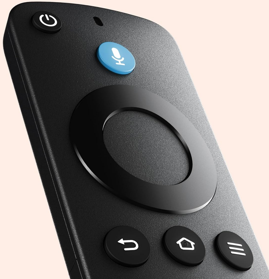
Image: Close-up of the remote control highlighting the Alexa voice button.

Pulsa y pídele a Alexa que busque, inicie y controle tu contenido.