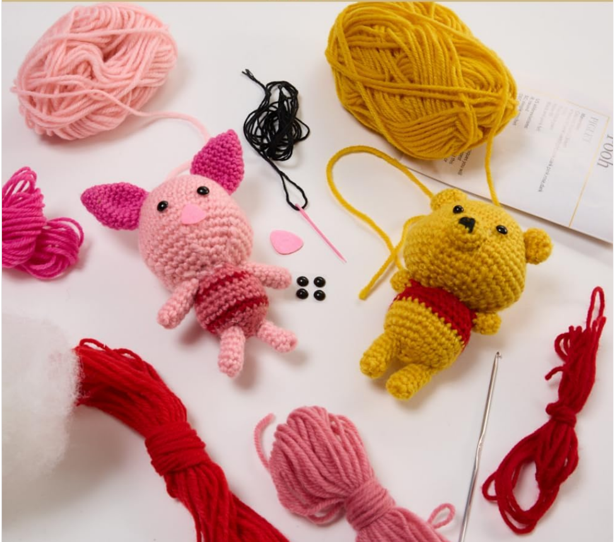
Image: Completed Winnie the Pooh and Piglet figures alongside kit components.

Video: An overview of the Winnie the Pooh Crochet Kit, demonstrating the creative process and the finished products. This video highlights the joy of making the characters yourself.