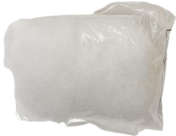
Image: Crochet hook, plastic needle, felt stickers, adhesive gems, and stuffing.