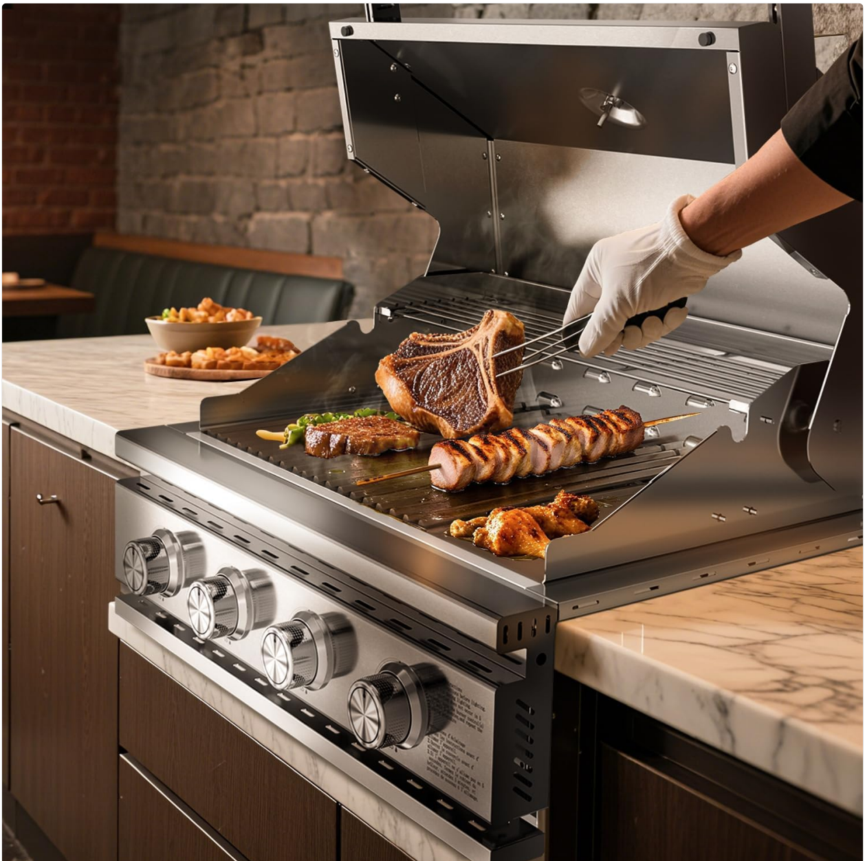
Figure 5.1: The Electactic JQ-4G grill in operation, showing food being cooked on the grates and tray.

The grill features a built-in thermometer on the lid to monitor internal temperature. Adjust the burner control knobs to regulate heat. Lower settings are suitable for slow cooking or warming, while higher settings are for searing and high-heat grilling.