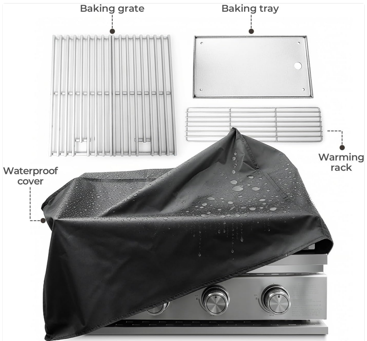
Figure 6.1: Key components of the grill, including the protective waterproof cover.

When not in use, especially during extended periods or adverse weather, cover the grill with the provided rain cover to protect it from the elements.