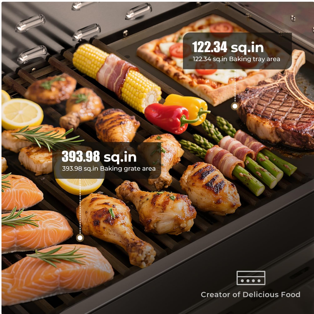
Figure 3.1: Cooking surface layout with baking grate (393.98 sq.in.) and baking tray (122.34 sq.in.) areas.