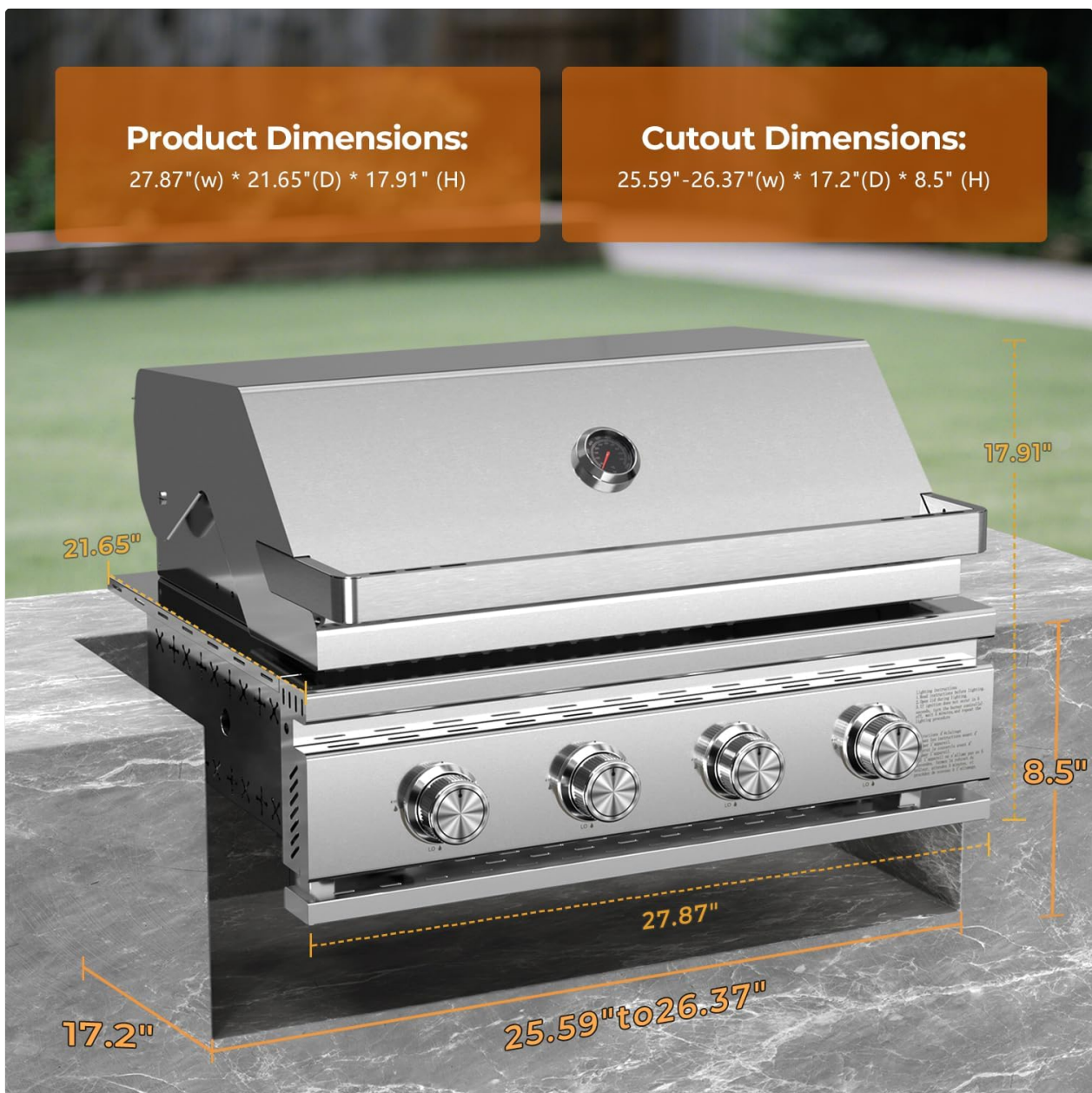
Figure 4.1: Product and recommended cutout dimensions for the Electactic JQ-4G grill.