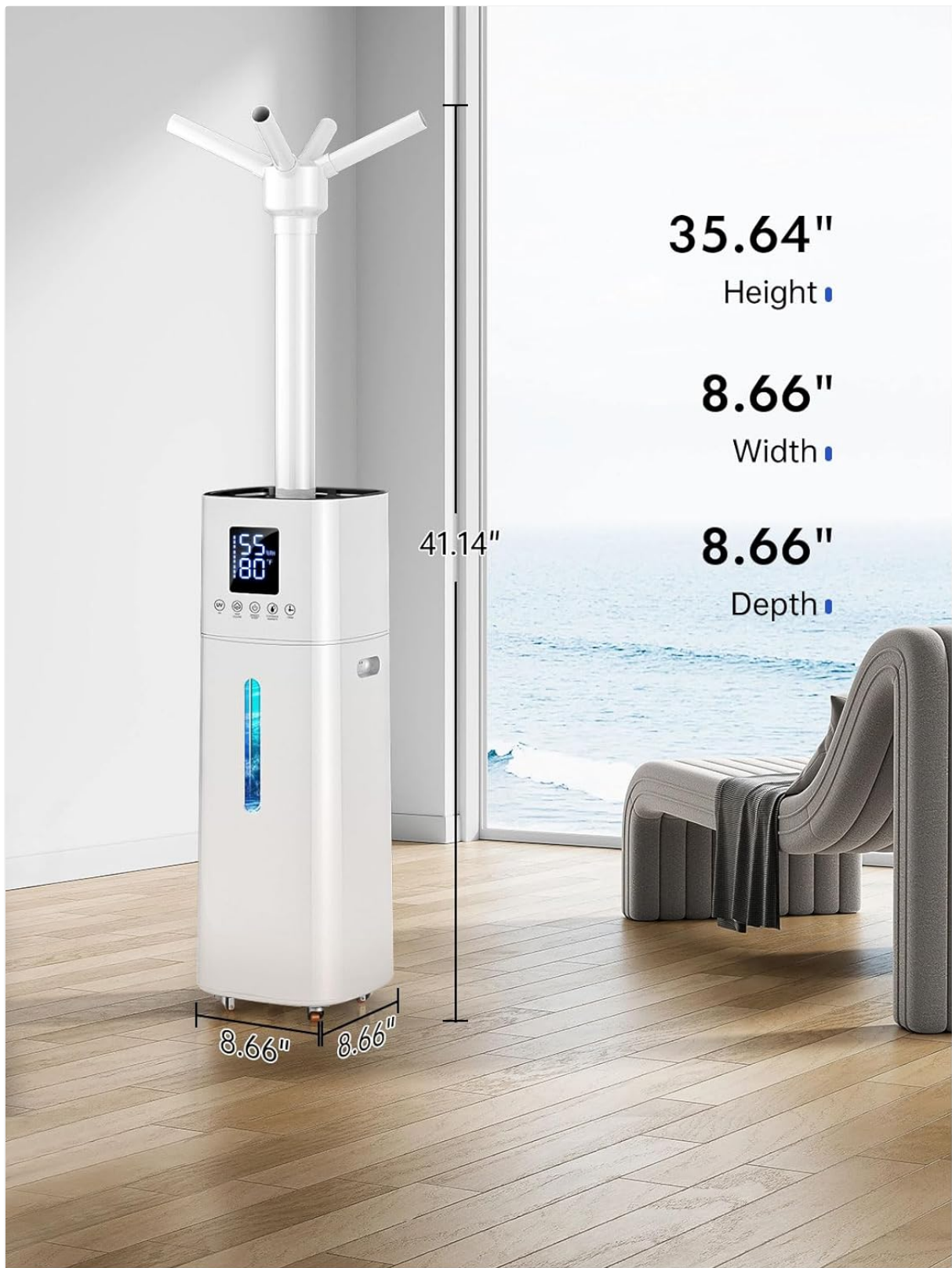
Detailed dimensions of the Nexva H790 humidifier, indicating its compact yet tall design.