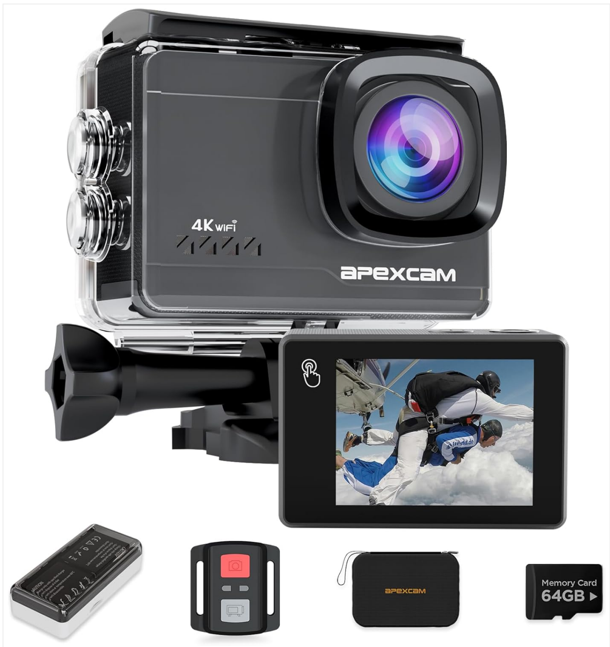
Image: The Apexcam M90 Action Camera shown with its waterproof case, remote control, battery, and 64GB memory card.