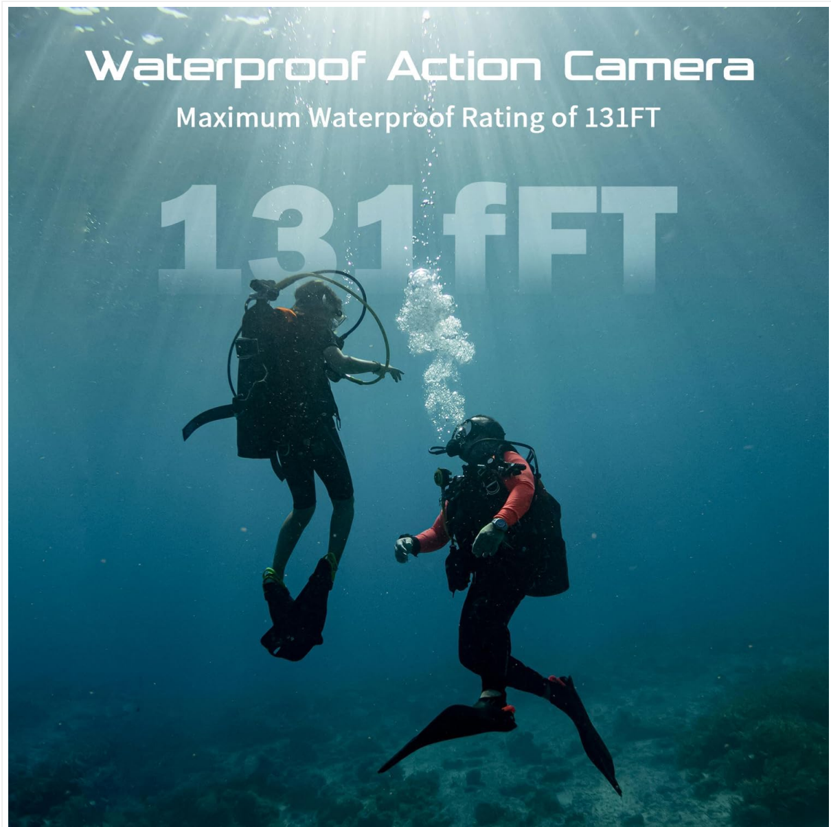
Image: The Apexcam M90 Action Camera in its waterproof case being used by divers underwater, highlighting its 131ft (40m) waterproof rating.

camera being submerged and then removed, still fully operational.